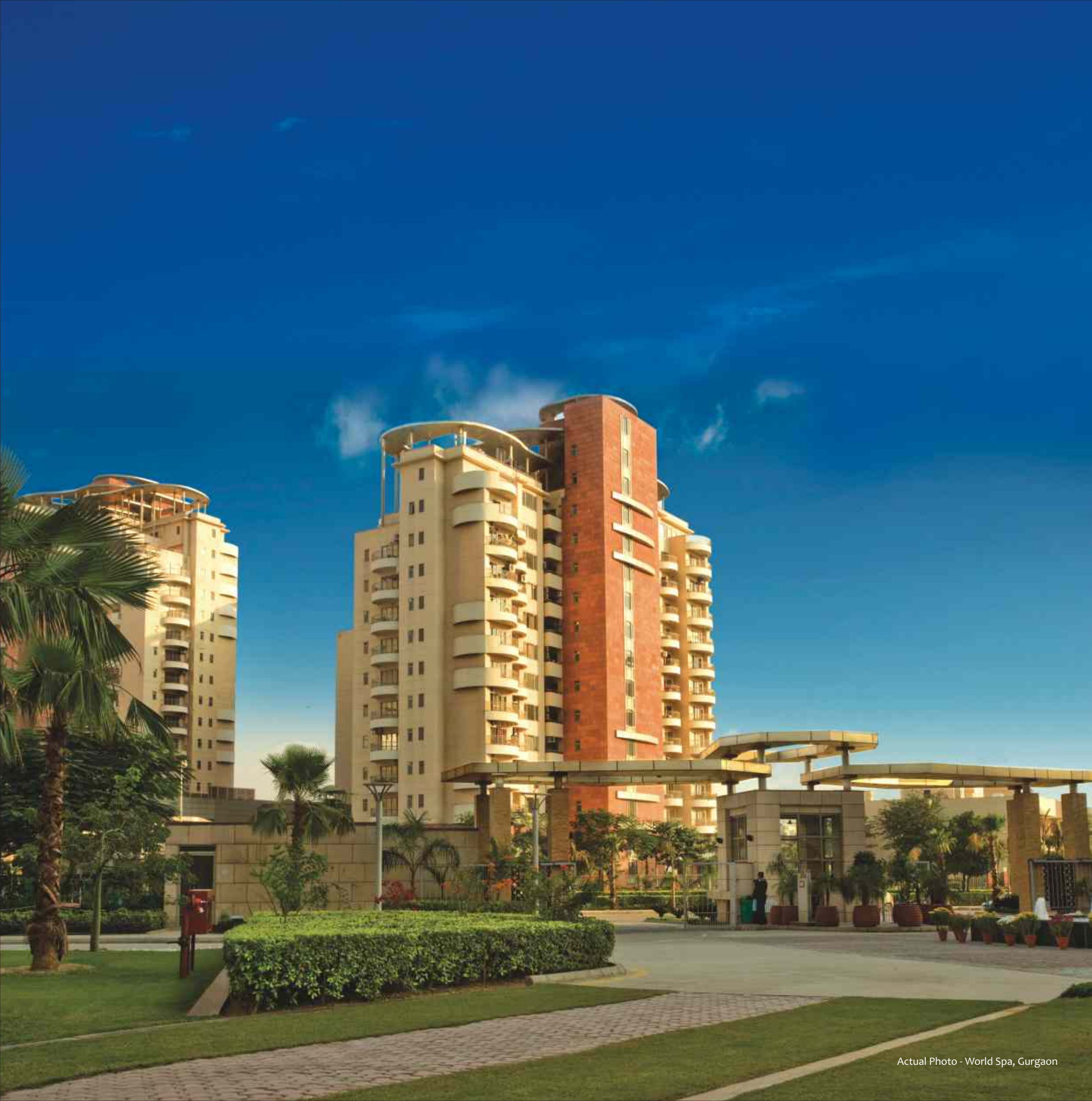
Actual Photo - World Spa, Gurgaon

Unitech Scrip is one of the most liquid stocks in the Indian stock markets and was the first real estate company to be part of the National Stock Exchange's NIFTY 50 Index. The company has over 600,000 shareholders.