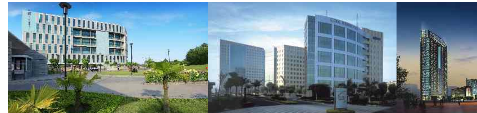
Infospace - Kolkata

Established in 1972, Unitech is today a leading real estate developer in India. Known for the quality of its products, it is the first developer to have been certified ISO 9001:2000 in North India and offers the most diversified product mix comprising residential, commercial/IT parks, retail, hotels, amusement parks and SEZs.