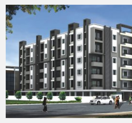
🔺 MK GRAND, SHEELANAGAR