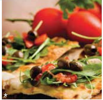
Fine Dining, Restaurants and Cafes