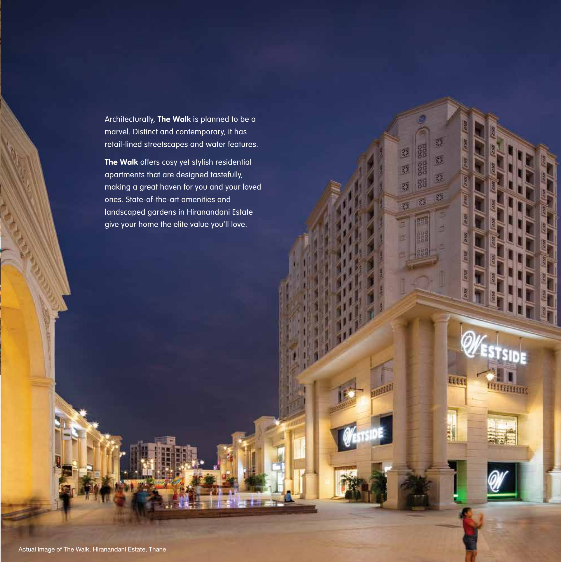
Actual image of The Walk, Hiranandani Estate, Thane

Architecturally, The Walk is planned to be a marvel. Distinct and contemporary, it has retail-lined streetscapes and water features.