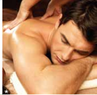
Beauty and Wellness Centre