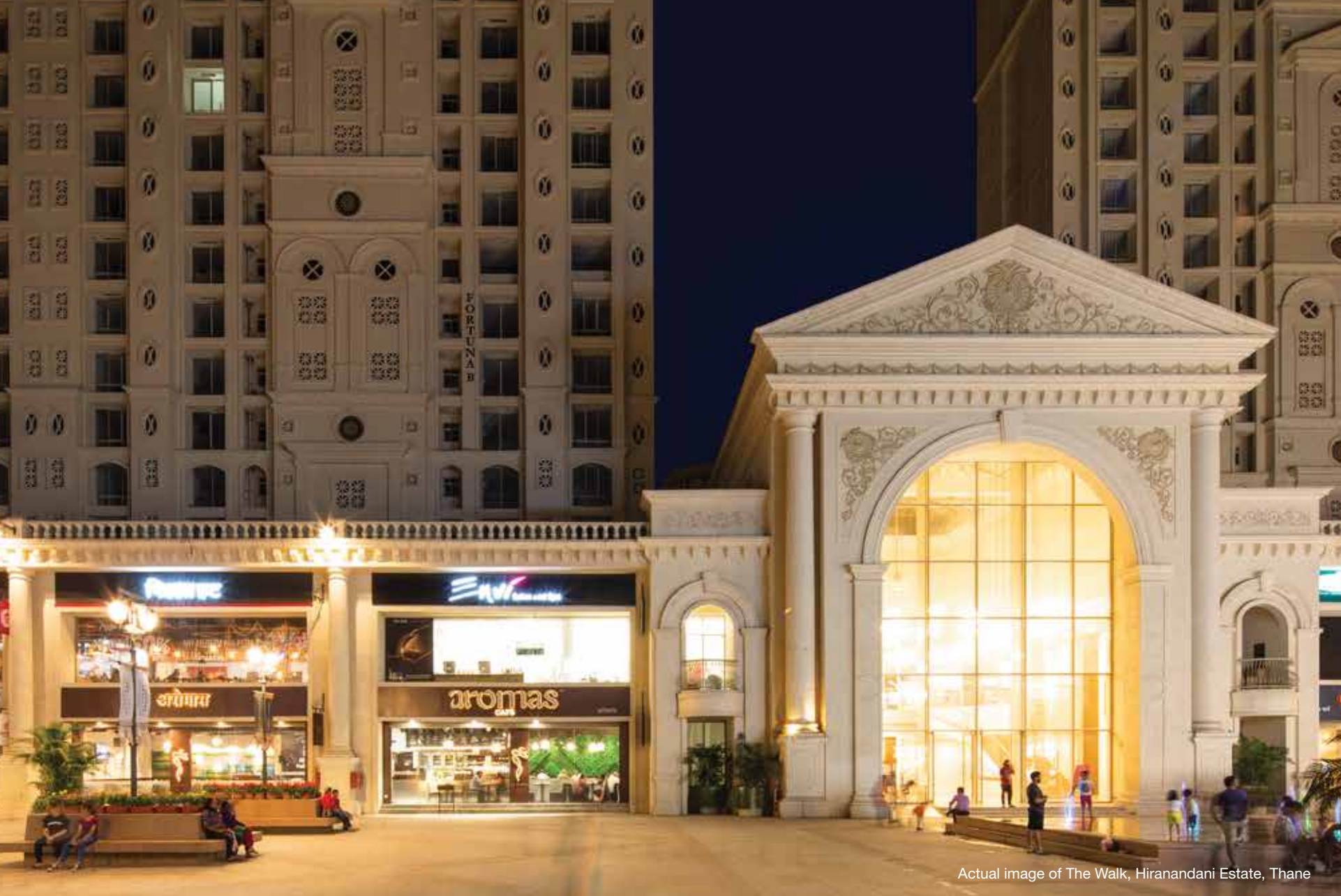
Actual image of The Walk, Hiranandani Estate, Thane