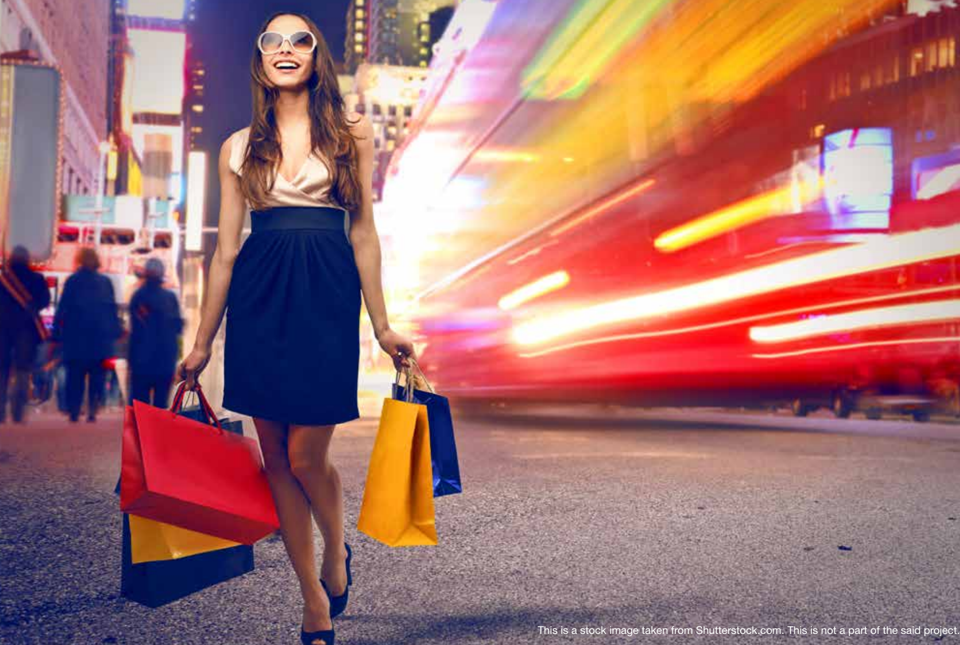
This is a stock image taken from Shutterstock.com. This is not a part of the said project.