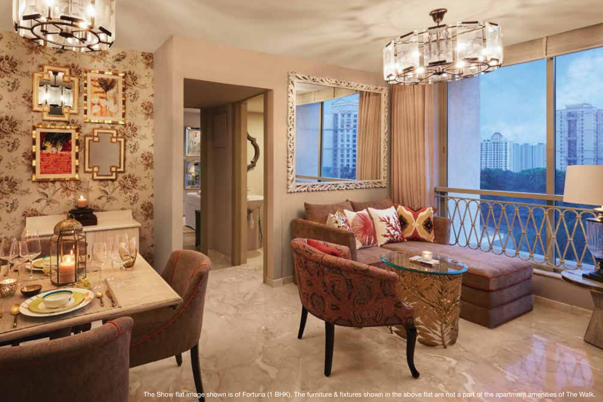
The Show flat image shown is of Fortuna (1 BHK). The furniture & fixtures shown in the above flat are not a part of the apartment amenities of The Walk.