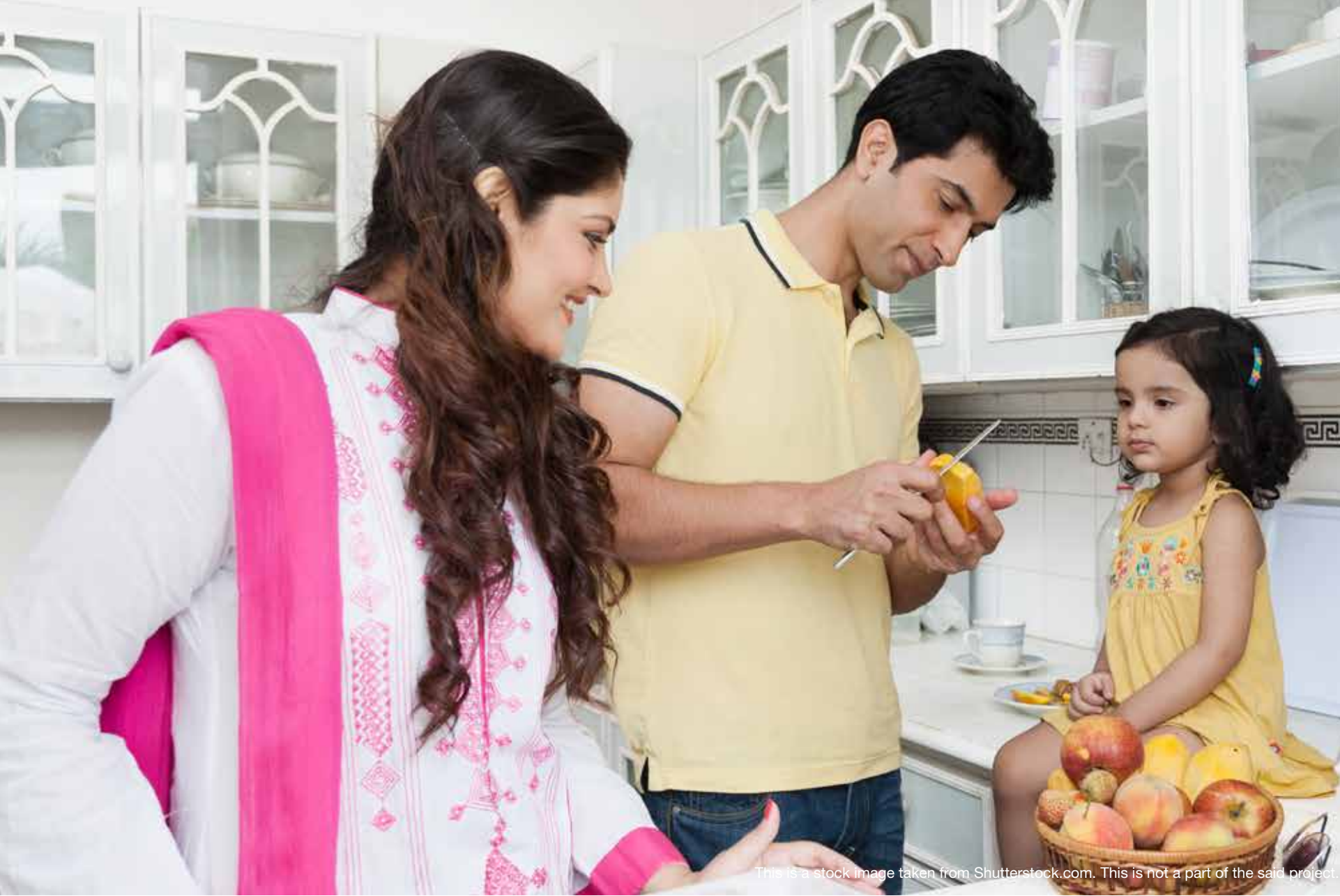
This is a stock image taken from Shutterstock.com. This is not a part of the said project.