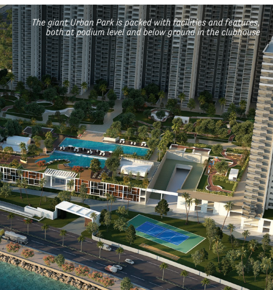
The giant Urban Park is packed with facilities and features, both at podium level and below ground in the clubhouse