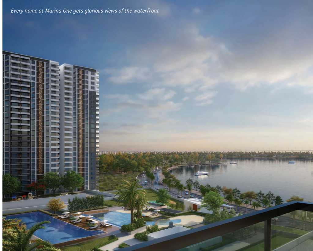
Your living room at Marina One

Download all the plans from www.sobha.com