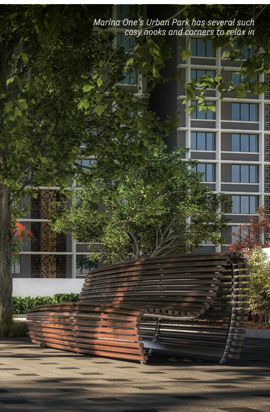
Marina One's Urban Park has several such cosy nooks and corners to relax in