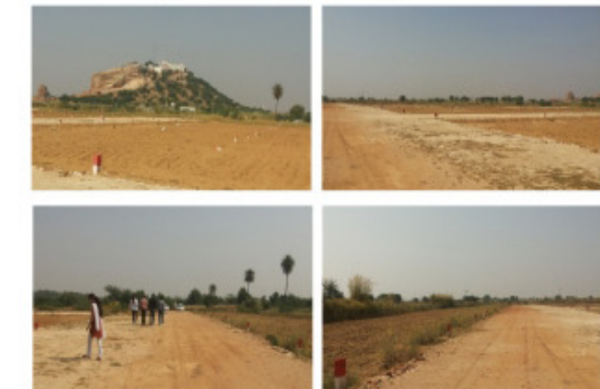
Actual Site Photographs