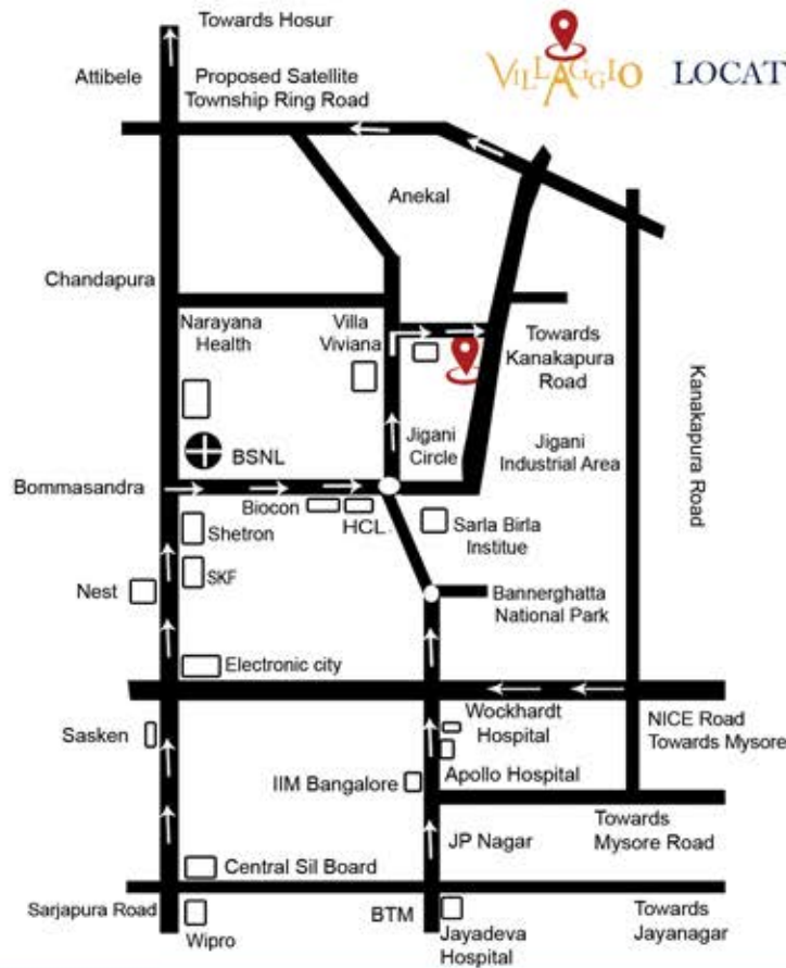
VILLAGGIO LOCATION MAP