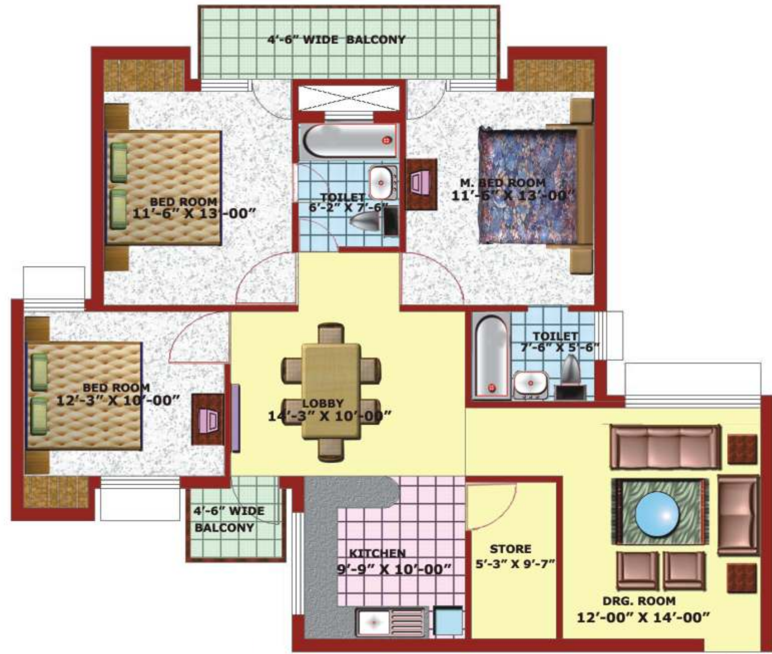
TENTATIVE LAYOUT: 3 BEDROOM FLAT + SER. ROOM