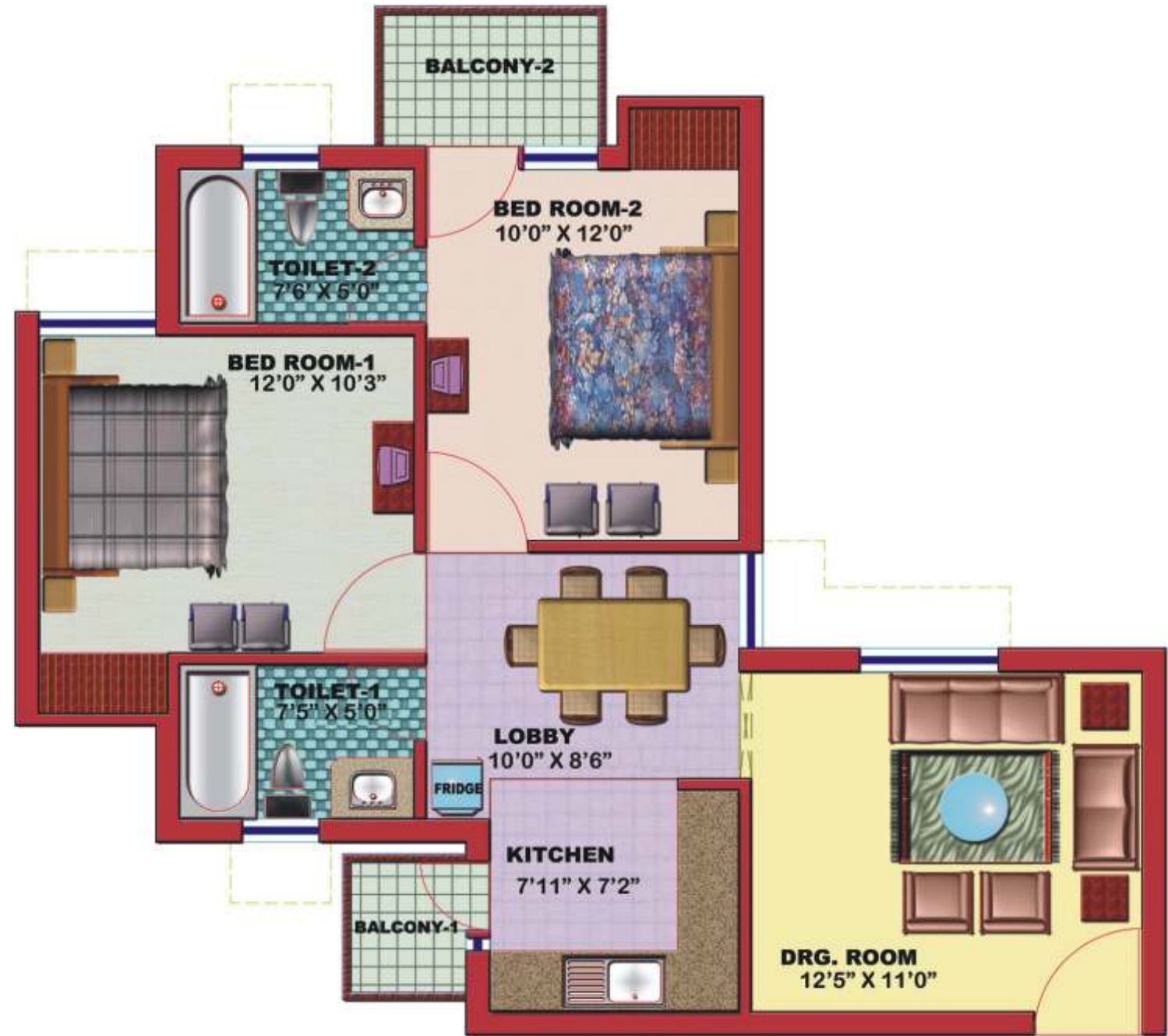
TENTATIVE LAYOUT: 2 BEDROOM FLAT