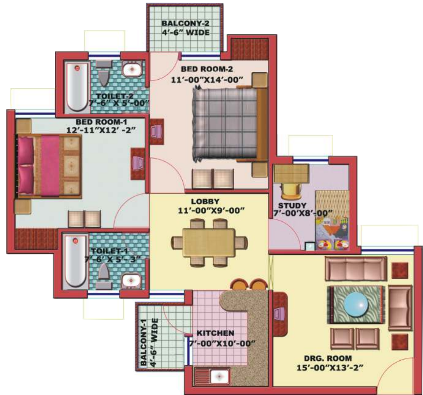
TENTATIVE LAYOUT: 2 BEDROOM FLAT + STUDY