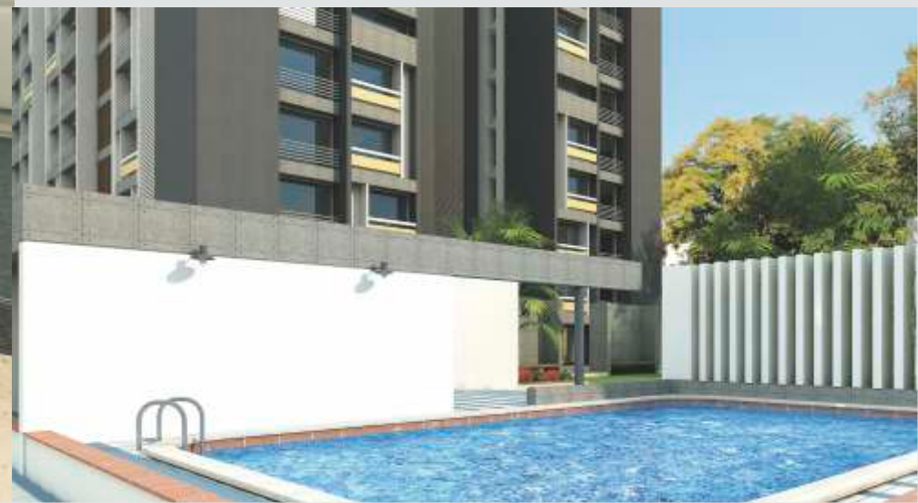
garden and swimming pool at Riviera ELEGANCE