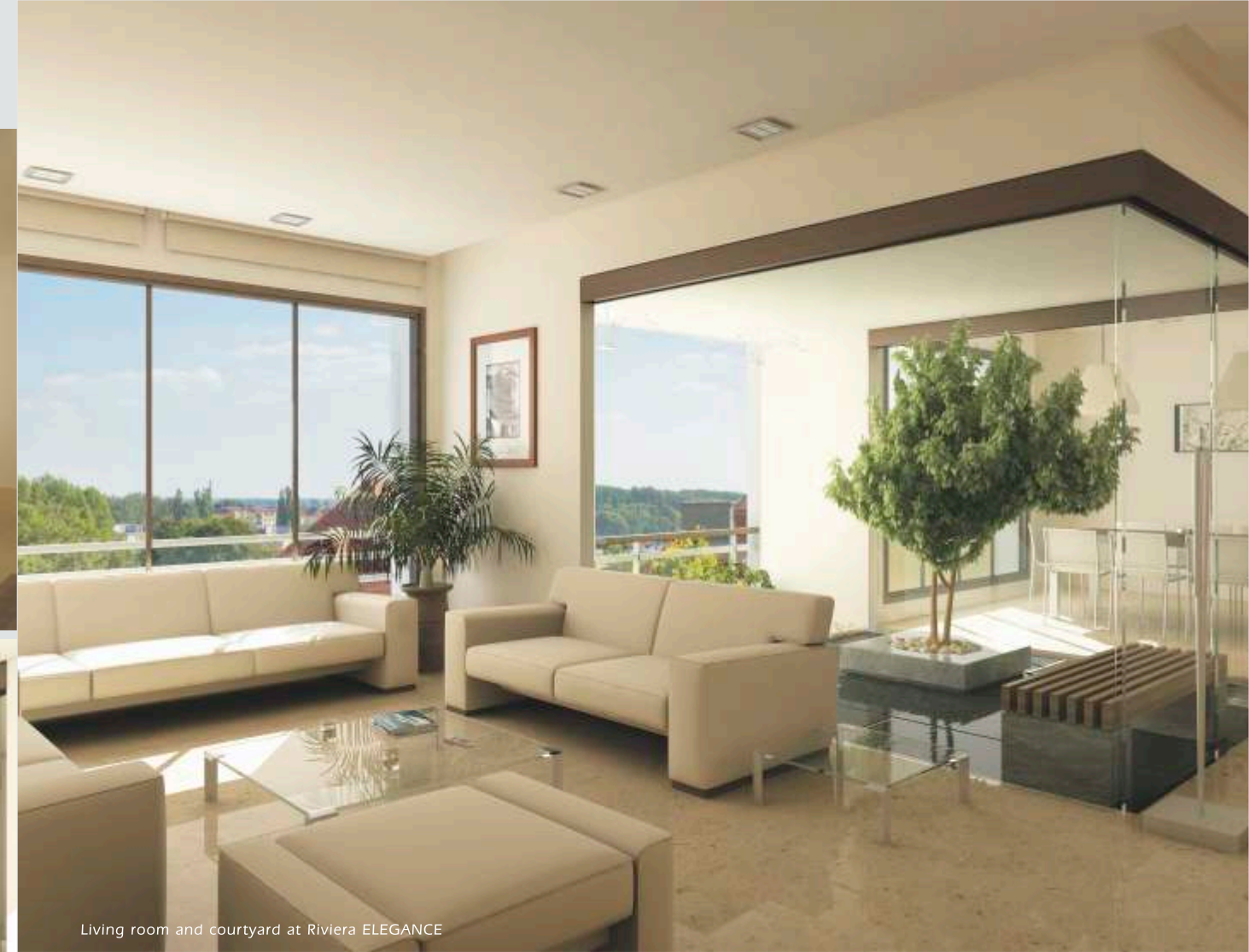
Living room and courtyard at Riviera ELEGANCE

Enter any of our living spaces, and you'll instantly find yourself in a 'bungalow'. A kind of bungalow you've never seen before.