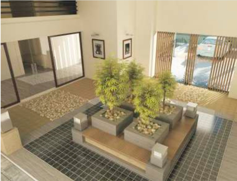
Entrance lobby at Riviera ELEGANCE