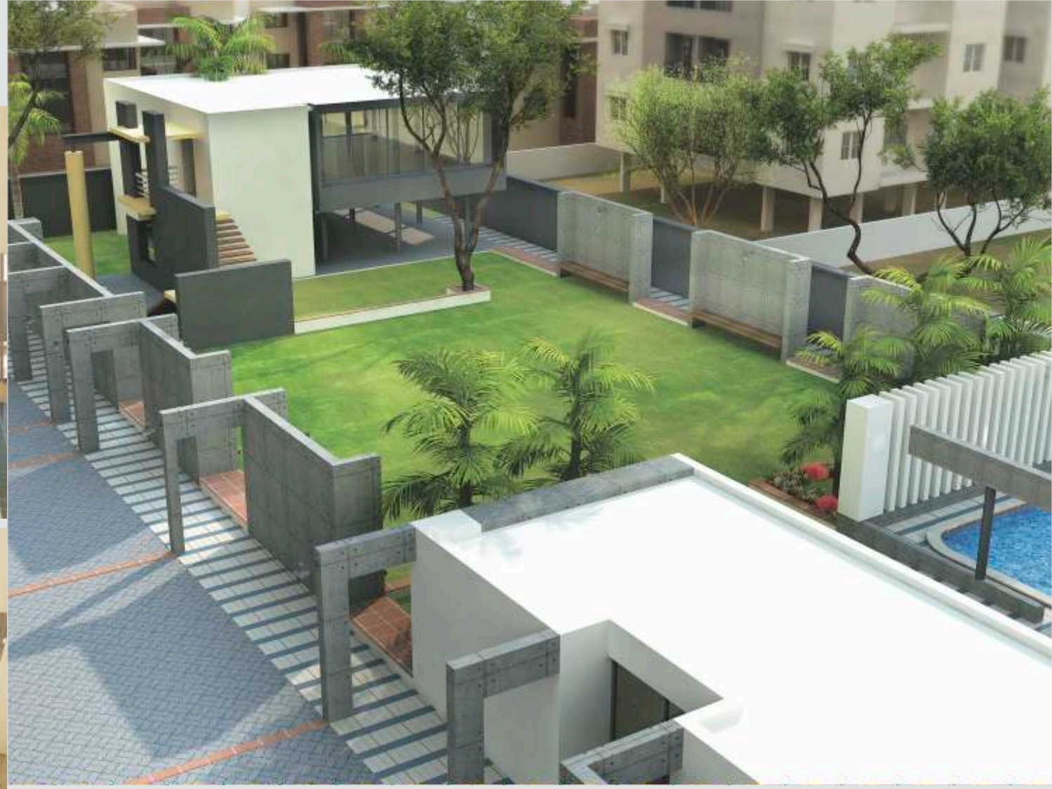
Club house at Riviera ELEGANCE