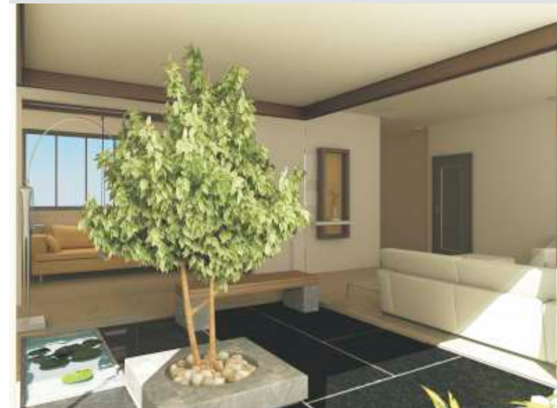
Court yard at Riveira ELEGANCE