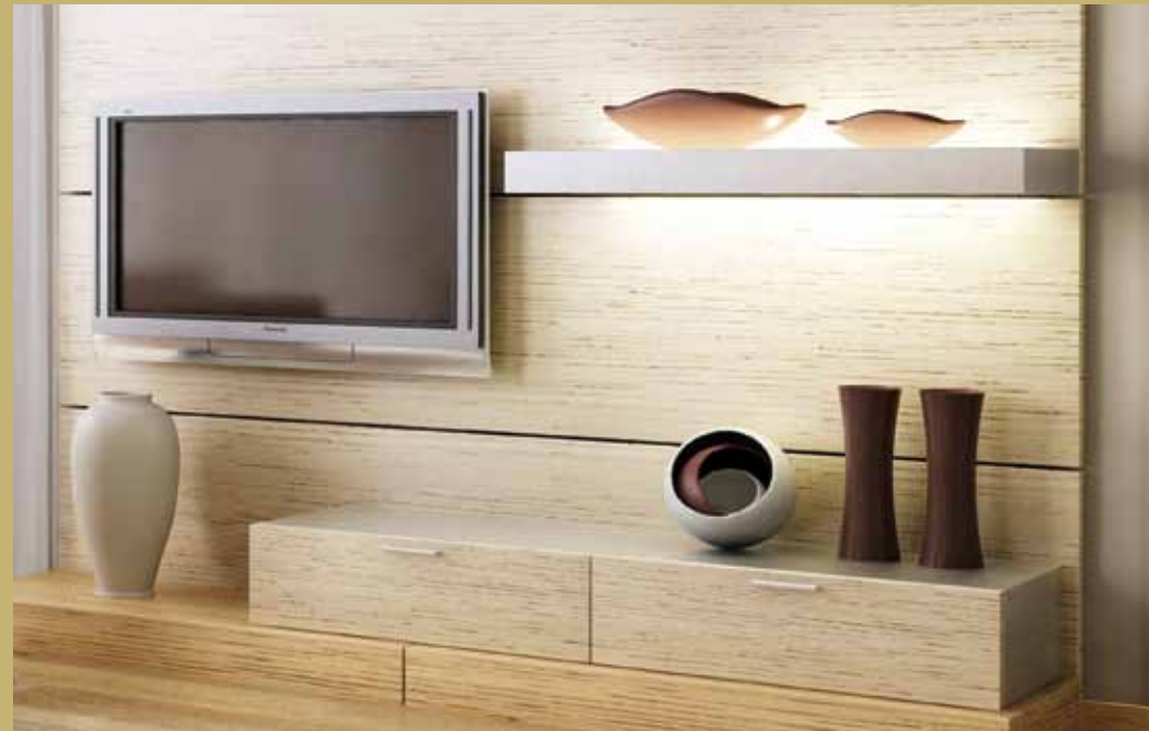
Step into the Eternity world and discover a world of affordable luxury and extraordinary living.