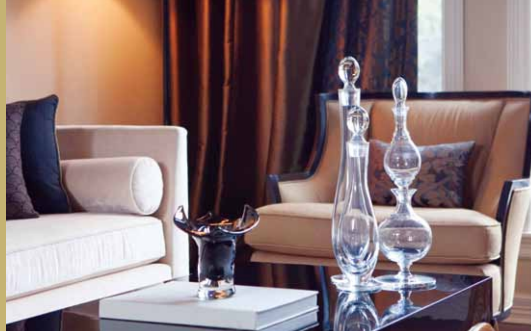
Your Eternity living room comes with a sense of spaciousness, ample sunlight and fresh breezes welcoming you to a wonderful world.