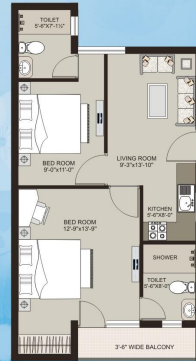
2 BHK (G+3) Block SALEABLE AREA - 879 SQ. FT.