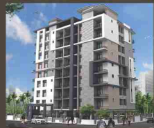
Forest View, Model Town, Jagatpura Jaipur