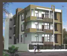
82-A, Keshav Vihar, Jaipur