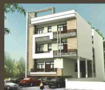
71, Mangal Vihar, Jaipur