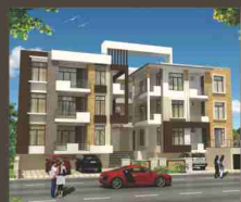
Coral Residency, Keshav Vihar