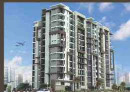
Acacia- H-Block, Sidharth Nagar, Near Jawhar Circle, Jaipur