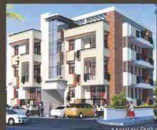
Aashish Enclave Veshali Nagar, Jaipur