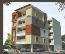
Ganga Path, Shanti Nagar, Near Gujar Ki Thadi, Jaipur