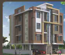
Madhuban Enclave, Bani Park, Jaipur