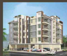
16-17, Ganga Path, Shanti Nagar, Near Gujar Ki Thadi, Jaipur