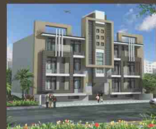
1A-1B, Mangal Vihar, Jaipur