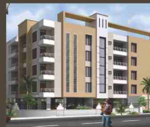
Aashish Saffire, Civil Lines