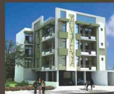
Gagandeep Residency, Raja park