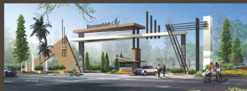
Devaashish City- Gramin Police Line Road, Borekhera, Kota