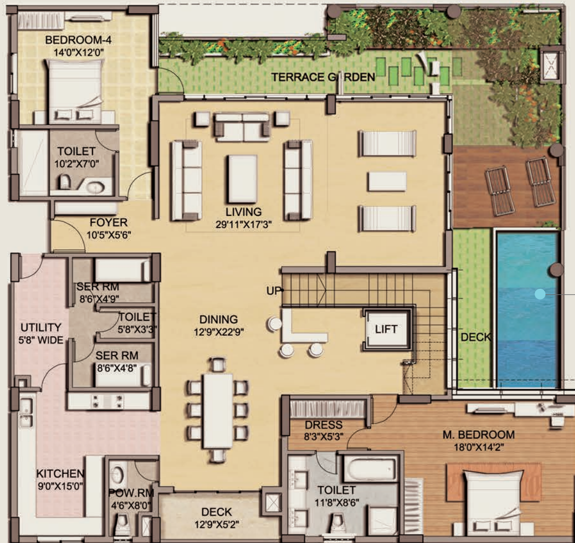
LOWER LEVEL PLAN PENTHOUSE TYPE -02

Anti-current chlorine-free plunge pool in sky villas to give you a swim otherwise possible only in a full-sized swimming set-up.