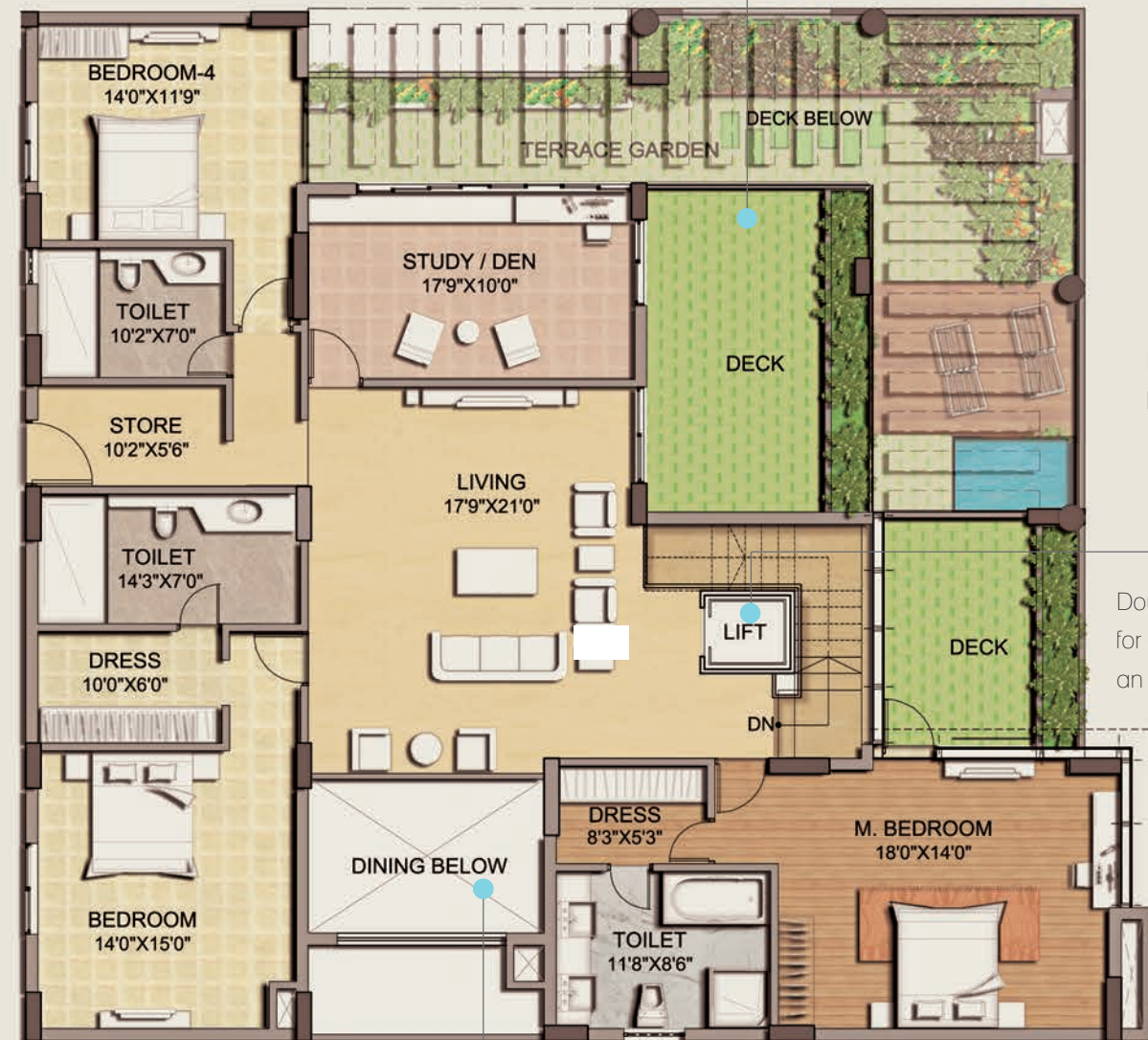
UPPER LEVEL PLAN PENTHOUSE TYPE -02

Upper level garden for seamless view of lower terrace garden