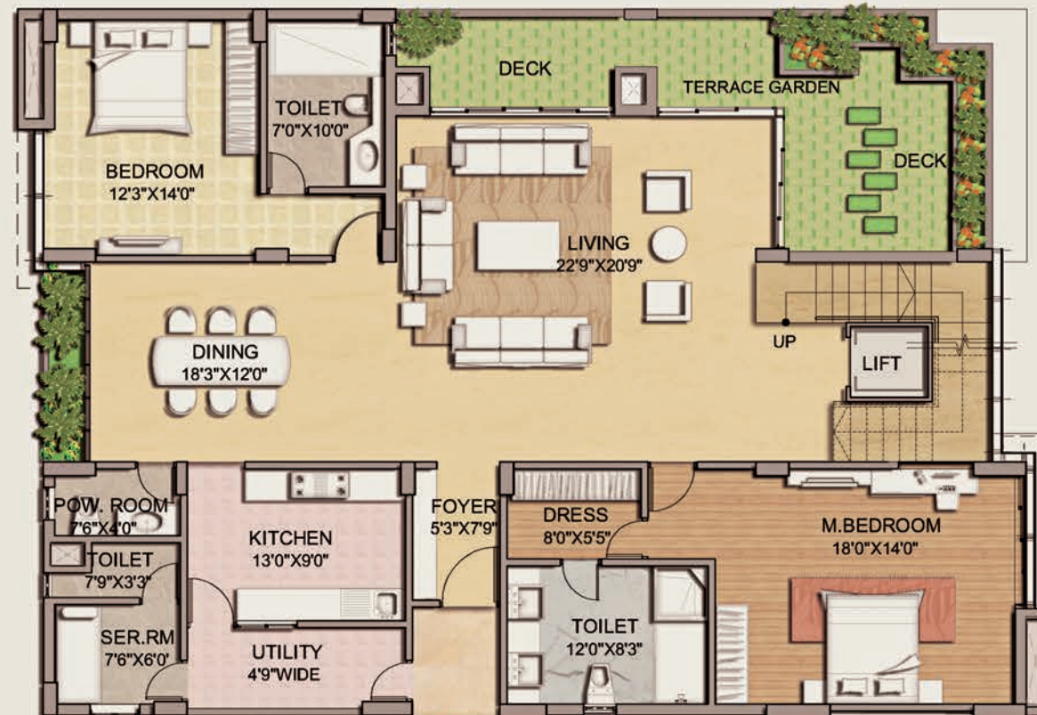
LOWER LEVEL PLAN PENTHOUSE TYPE -01