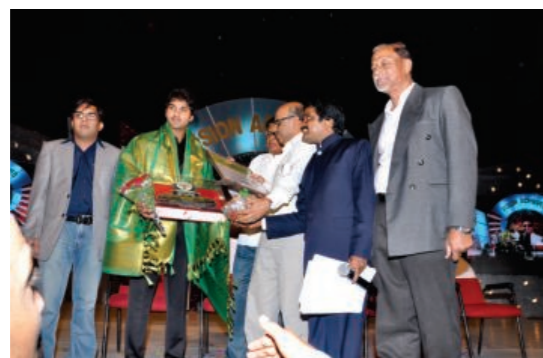
VASUNDHARA NATIONAL AWARD (Eco-Friendly Projects)