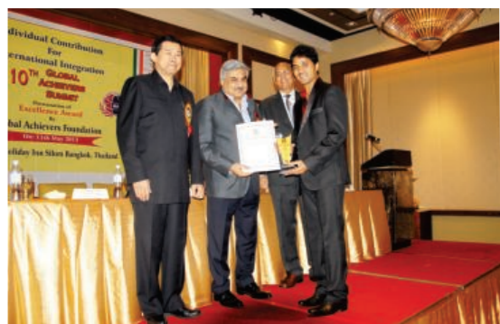
Global Achievers Award for (Young Entrepreneur)