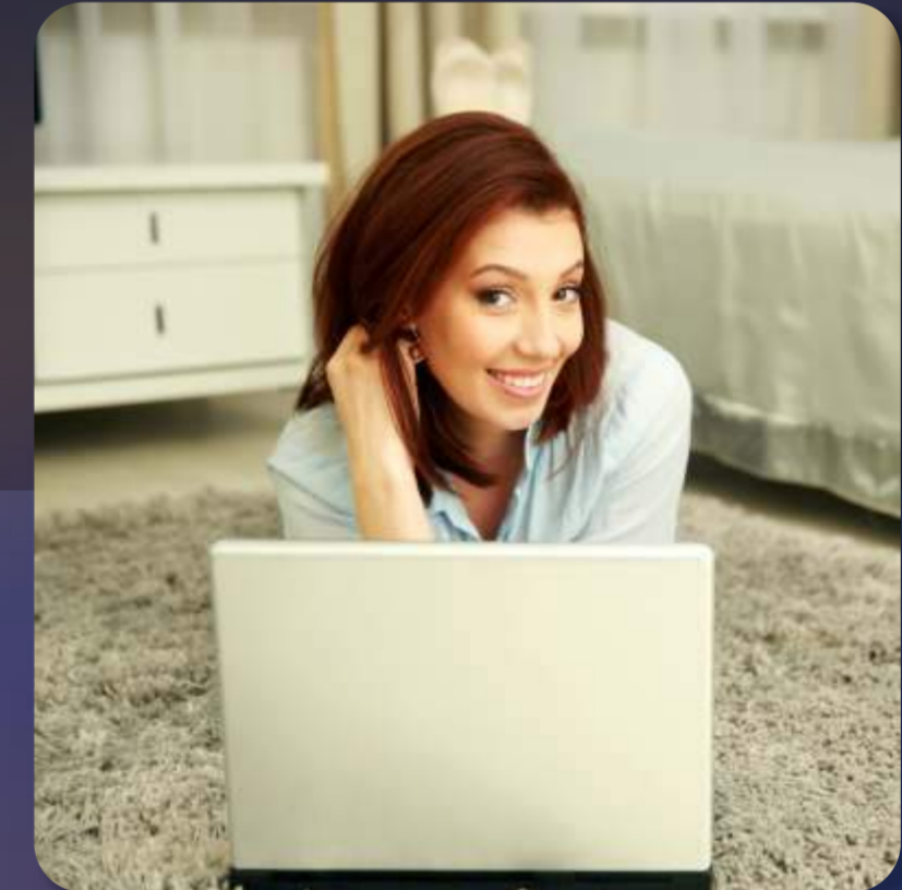
Pictorial representation is used to simply convey the essence of suggested lifestyle.