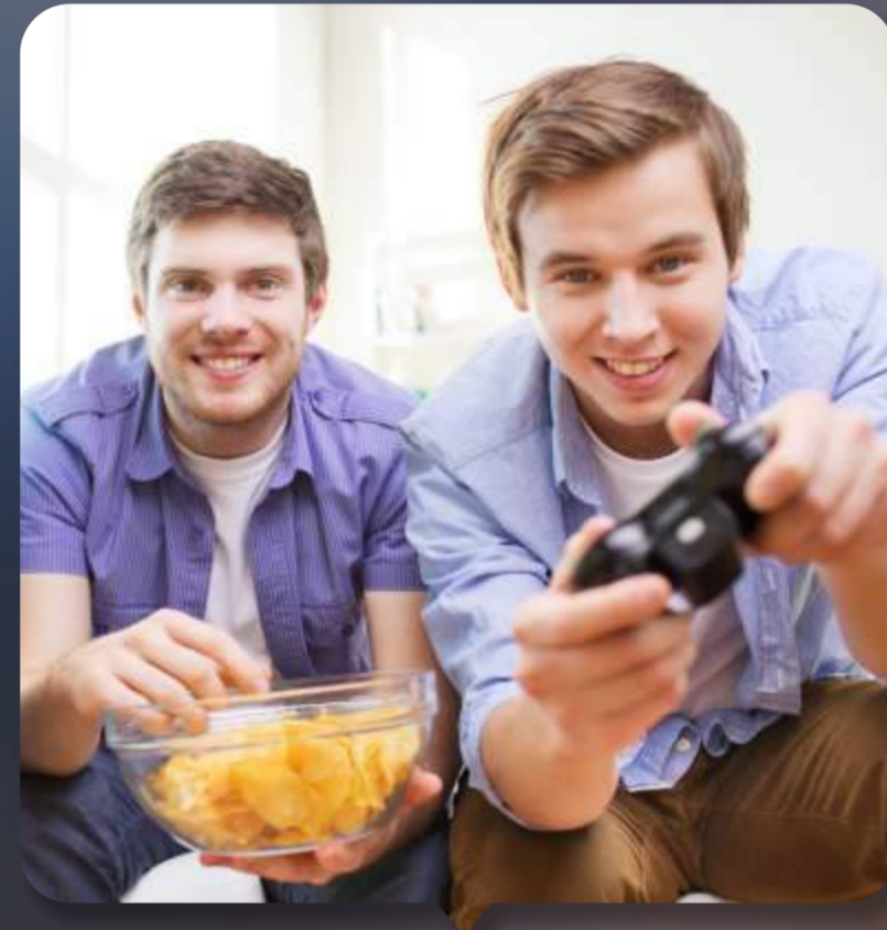
Pictorial representation is used to simply convey the essence of suggested lifestyle.

The amenities are carefully thought through to make you feel that this is just the place for you. You won't really feel the need to go elsewhere... 'The Lofts' with a shopping arcade downstairs, a mini football arena and to top it all a Sky lounge.