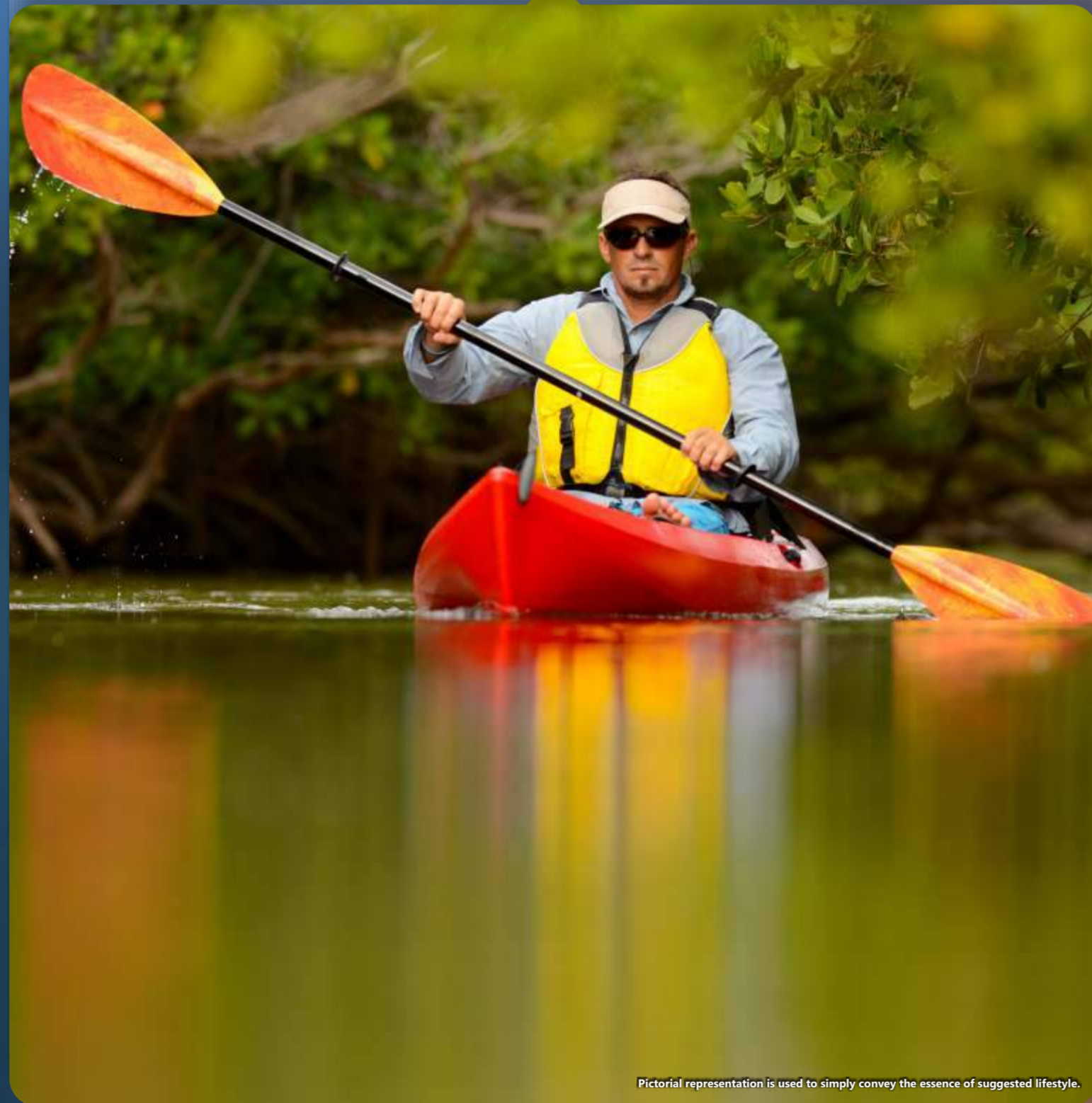
Pictorial representation is used to simply convey the essence of suggested lifestyle.

MARINA WITH BOATING FACILITY - A unique treat at Blue Ridge where you can make any day really cool! Call over friends, get your boats and go!