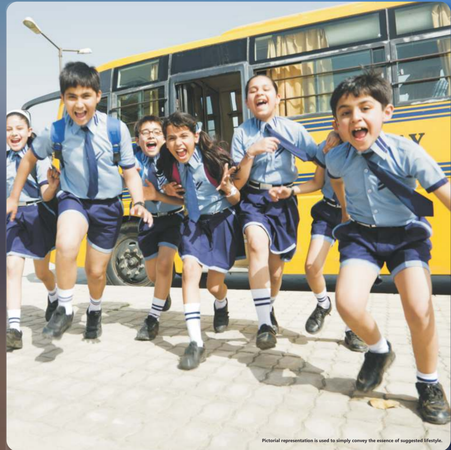
Pictorial representation is used to simply convey the essence of suggested lifestyle.