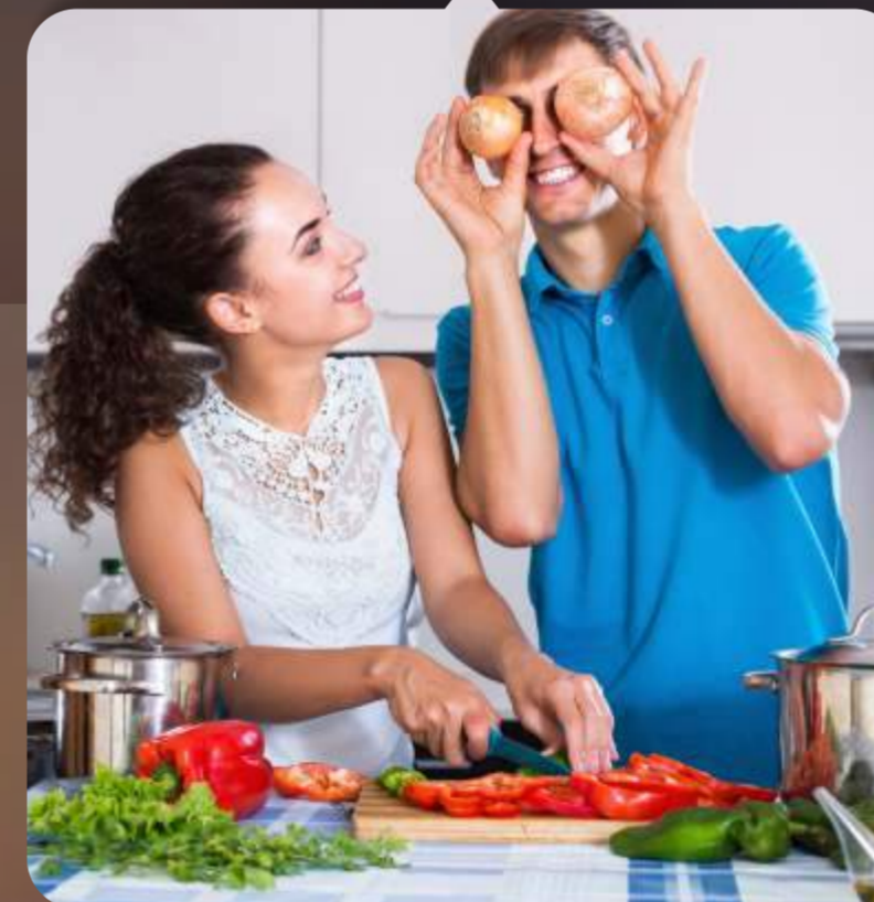
Pictorial representation is used to simply convey the essence of suggested lifestyle.