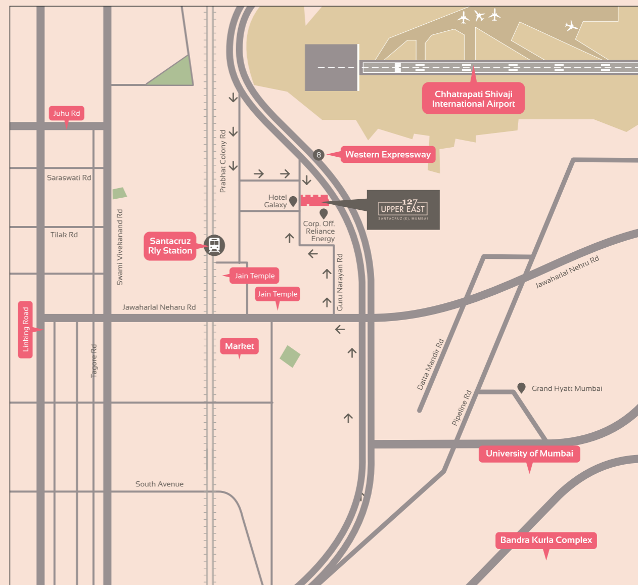
Map not to the scale