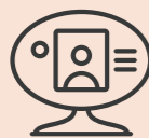
VIDEO INTERCOM FACILITY