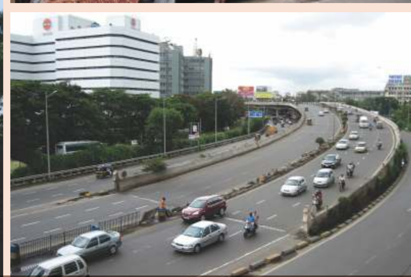
Actual Images of the vicinity