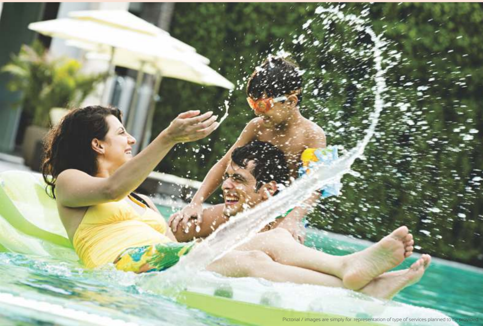
Pictorial / images are simply for representation of type of services planned to be provided.