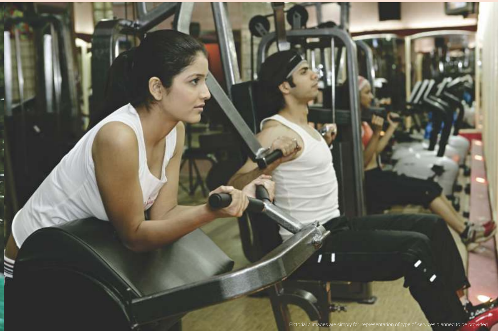
Pictorial / images are simply for representation of type of services planned to be provided.