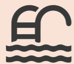
ROOF TOP POOL