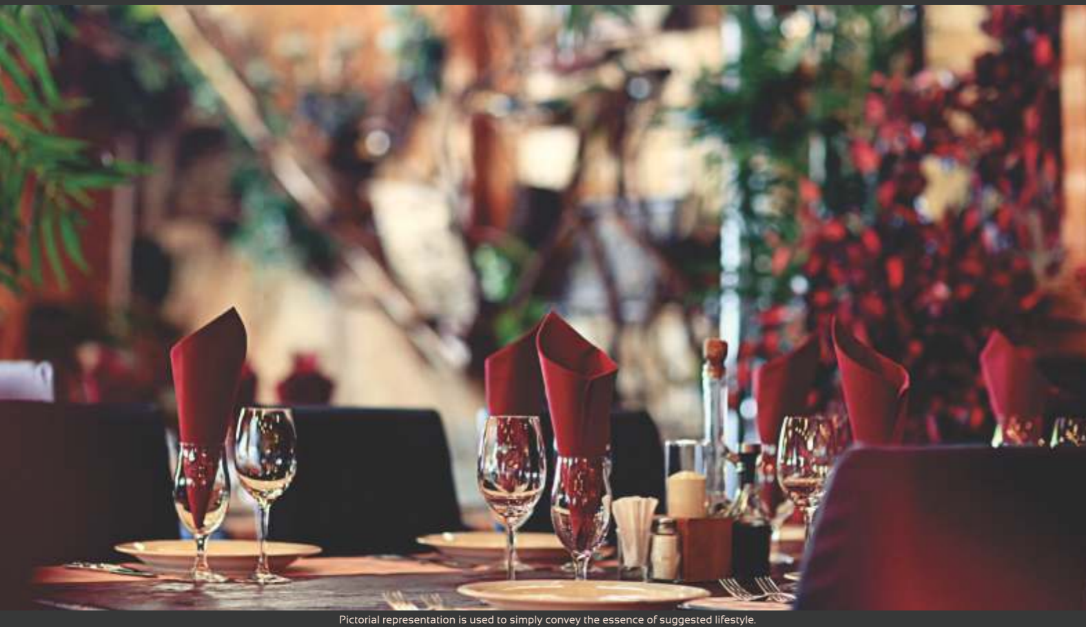
Pictorial representation is used to simply convey the essence of suggested lifestyle.