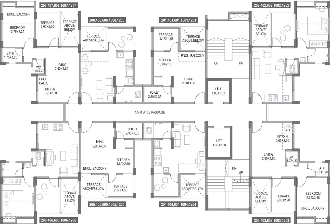
AREA STATEMENT IN SQ.MT