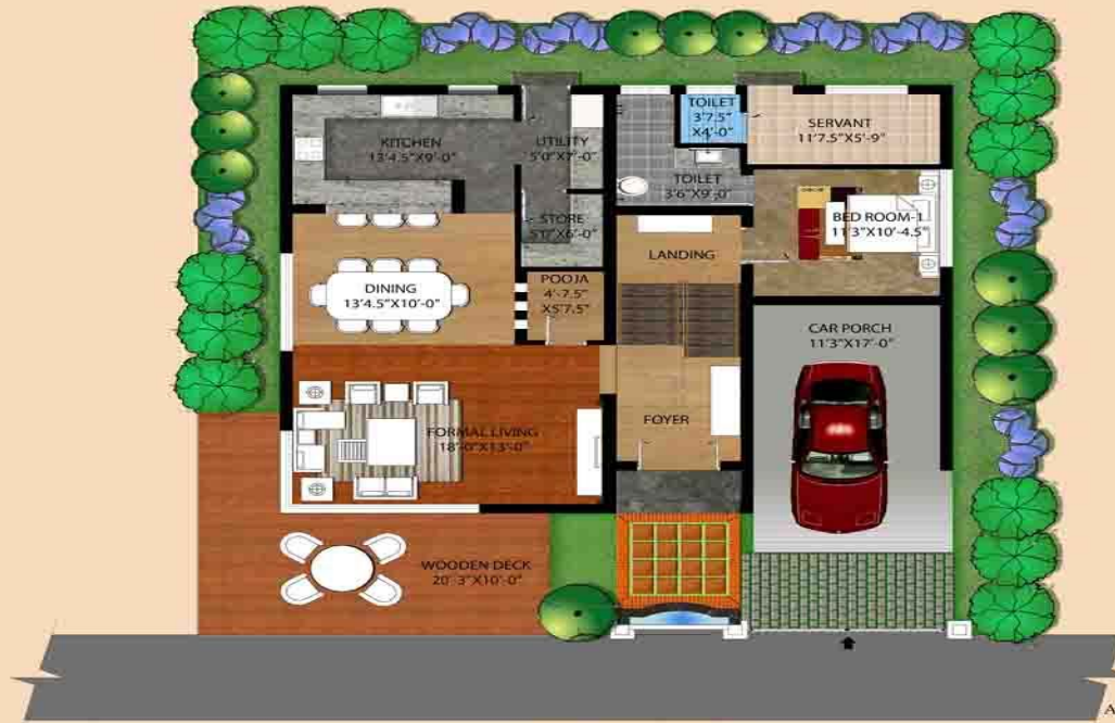
GROUND FLOOR PLAN (TYPE - 1)

PROPOSED LAYOUT PLAN FOR INDUS CITYSCAPES CONSTRUCTION (P) LTD.