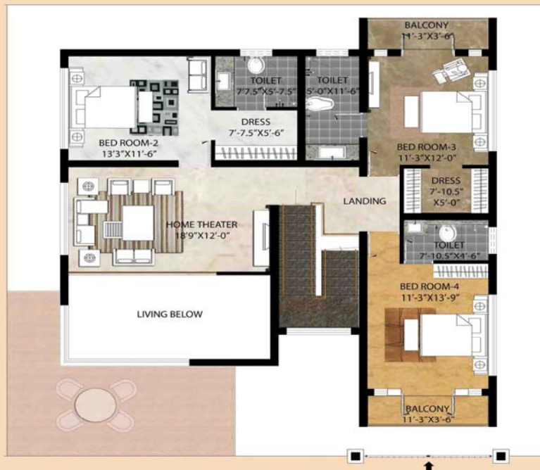
FIRST FLOOR PLAN (TYPE - 1)

ARCHITECTURE & INTERIOR DESIGN PASSARGAD ITC PARKSHERATON HOTEL & TOWERS 132, T.T.K. ROAD, MADRAS - 600 018, TEL:24980101 - EXTN.1886 TELEFAX - 42110595