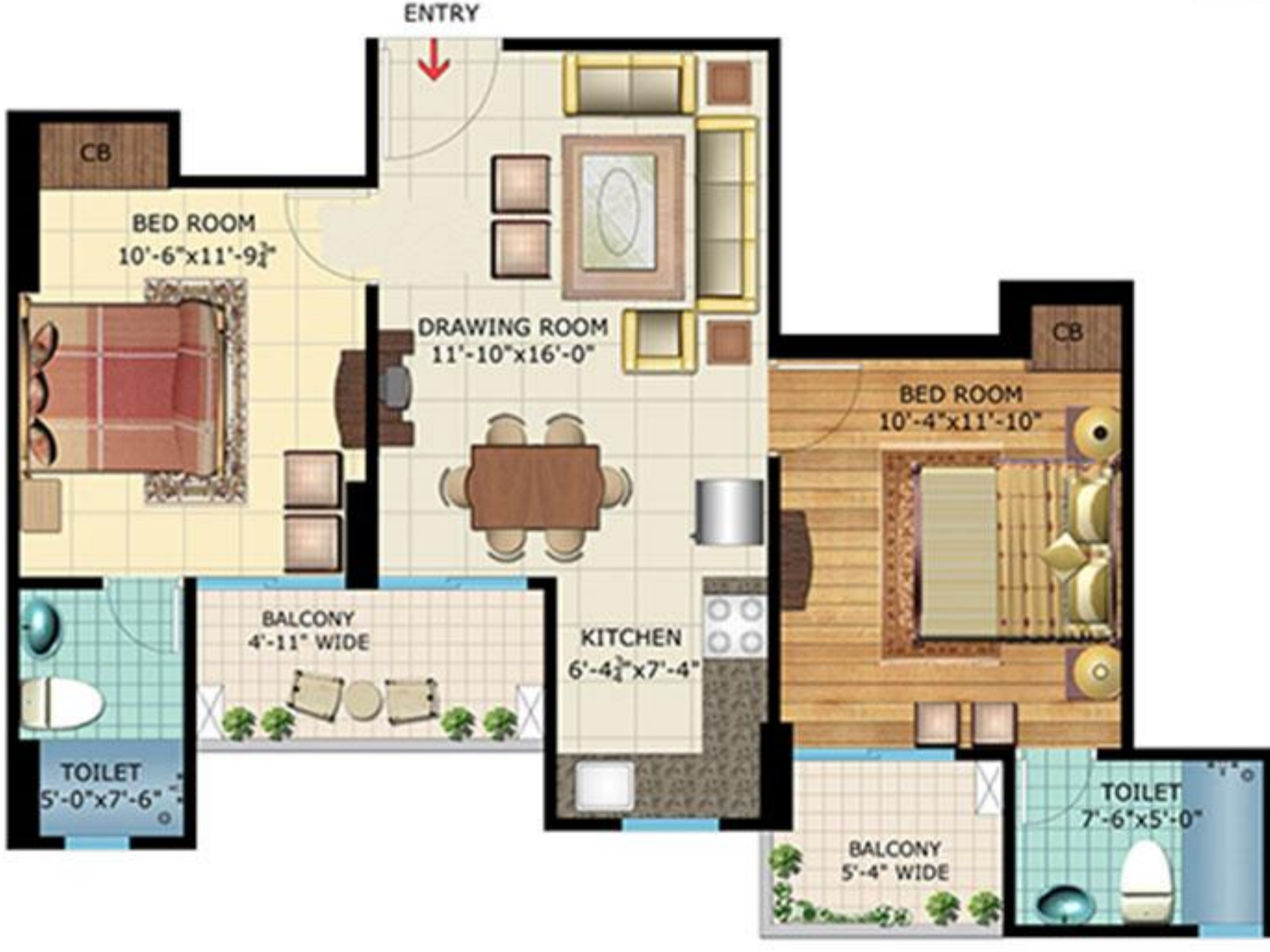
2 BHK + 2 TOI Saleable Area: 946 Sq. Ft.