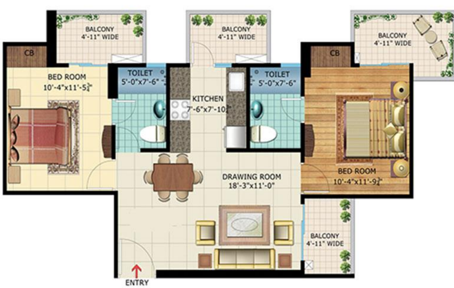
2 BHK + 2 TOI Saleable Area: 1080 Sq. Ft.