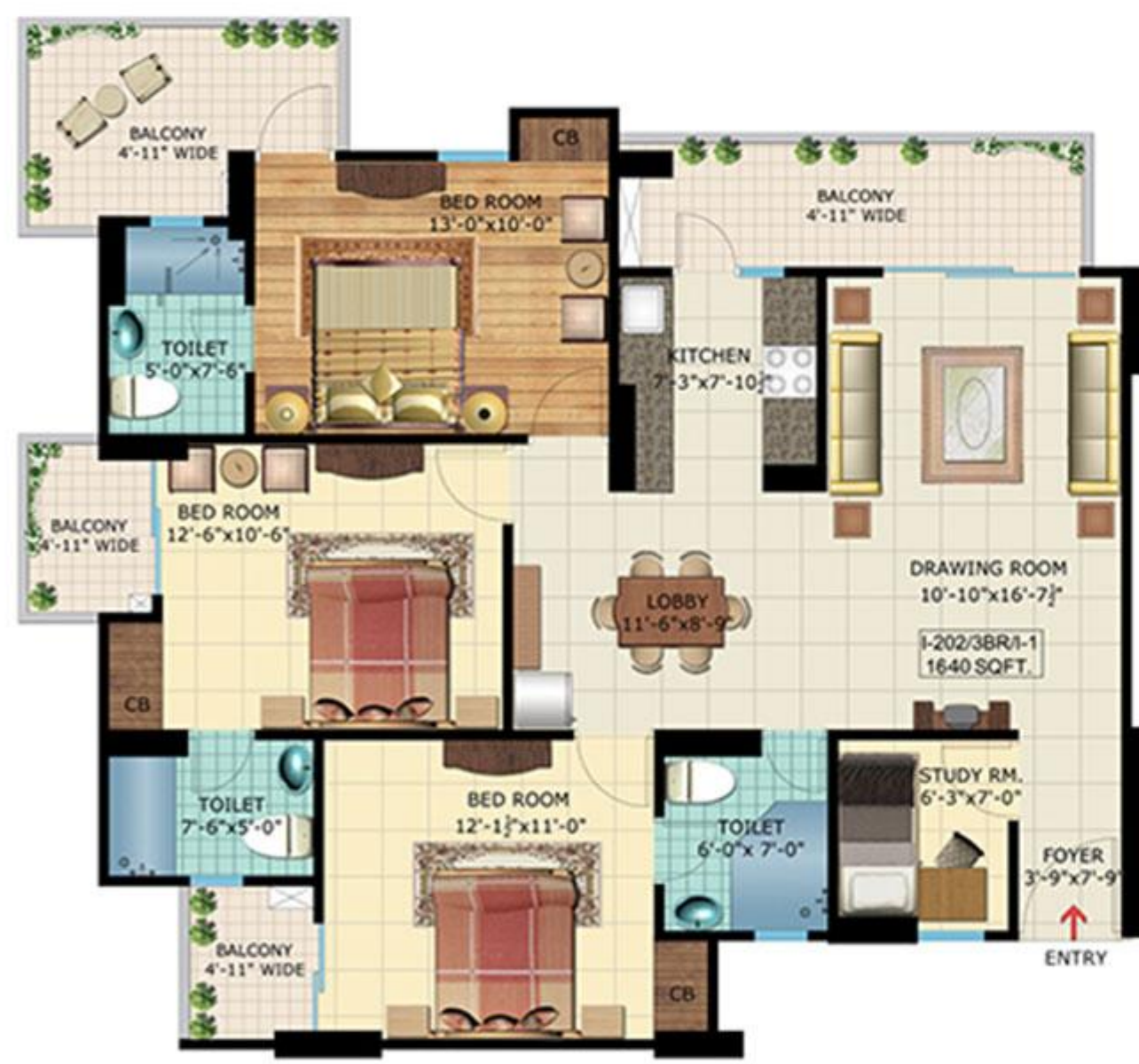
3 BHK + STUDY + 3 TOI Saleable Area: 1640 Sq. Ft. 6 th , 7 th , 14 th , 15 th , 22 nd Floor