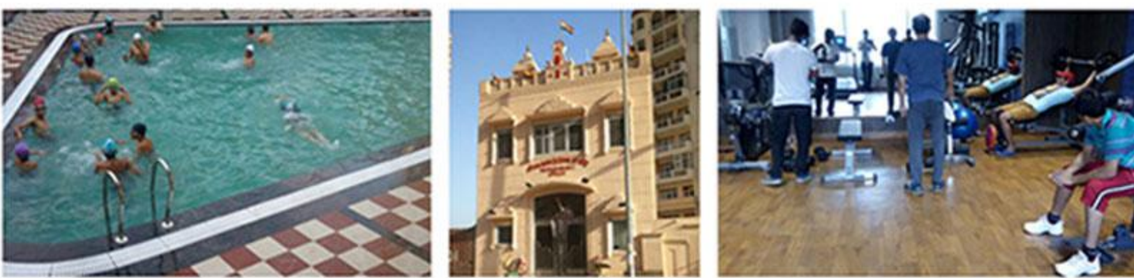
Actual Photographs of Cloud9, Indirapuram