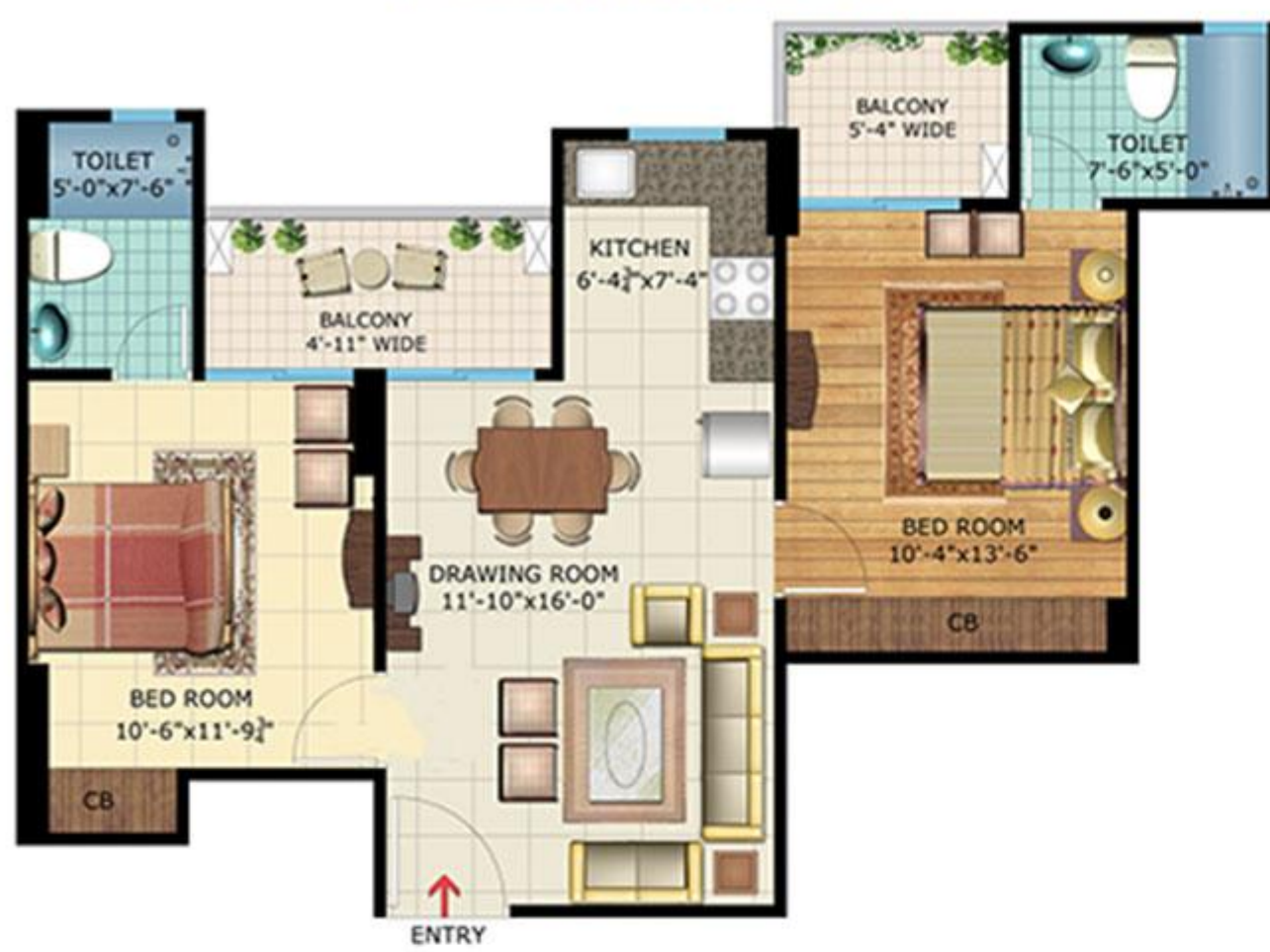
2 BHK + 2 TOI Saleable Area: 965 Sq. Ft.