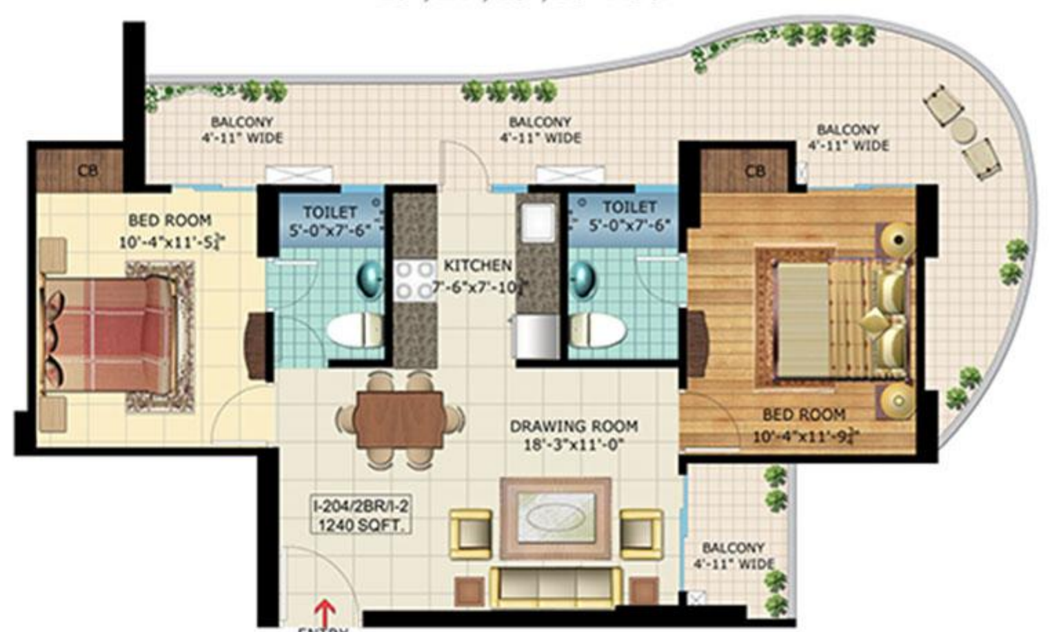
2 BHK + 2 TOI Saleable Area: 1240 Sq. Ft. 23 rd , 24 th , 25 th , 26 th Floor