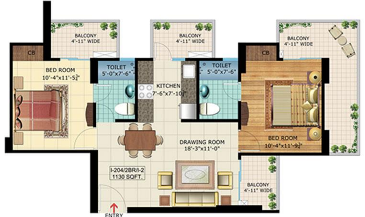
2 BHK + 2 TOI Saleable Area: 1130 Sq. Ft. 3 rd , 11 th , 19 th Floor