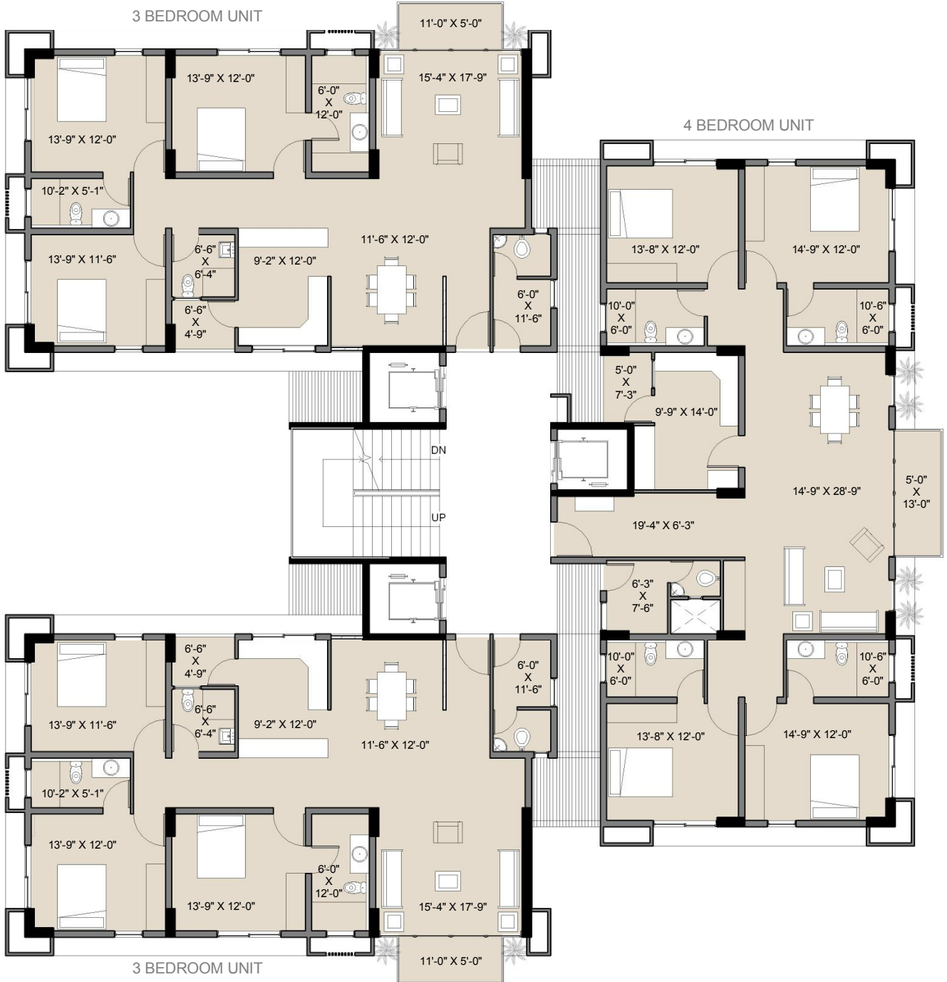
TYPICAL FLOOR PLAN (FLOORS 1-10)