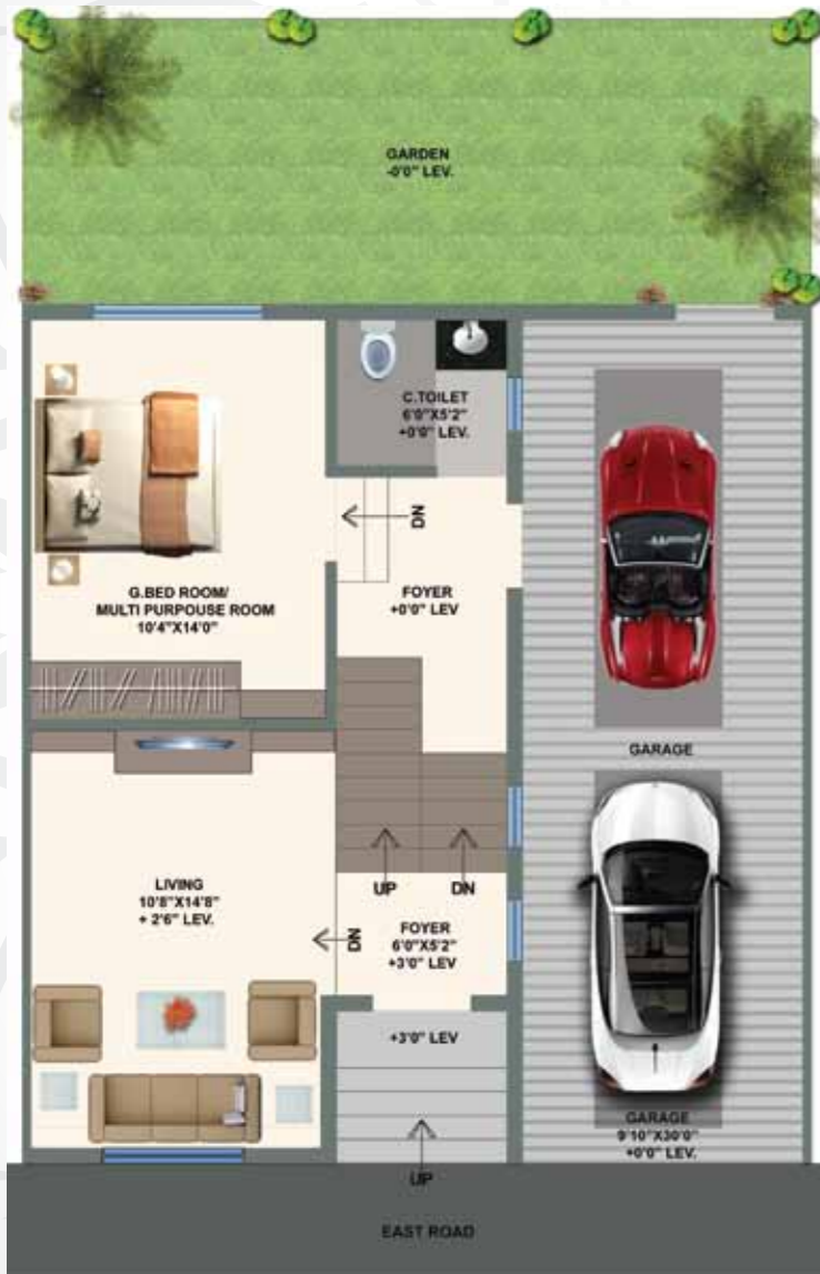
Ground Level Plan