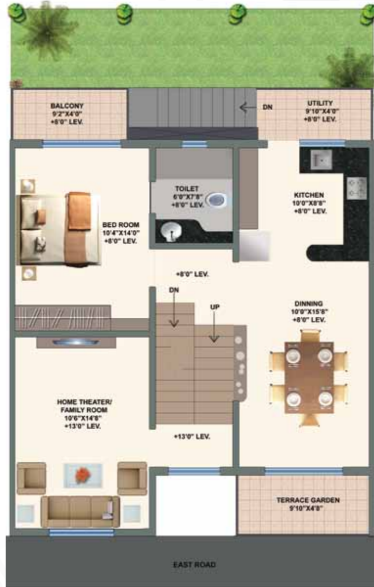
First Level Plan