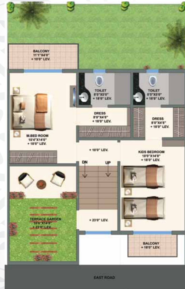
Second Level Plan