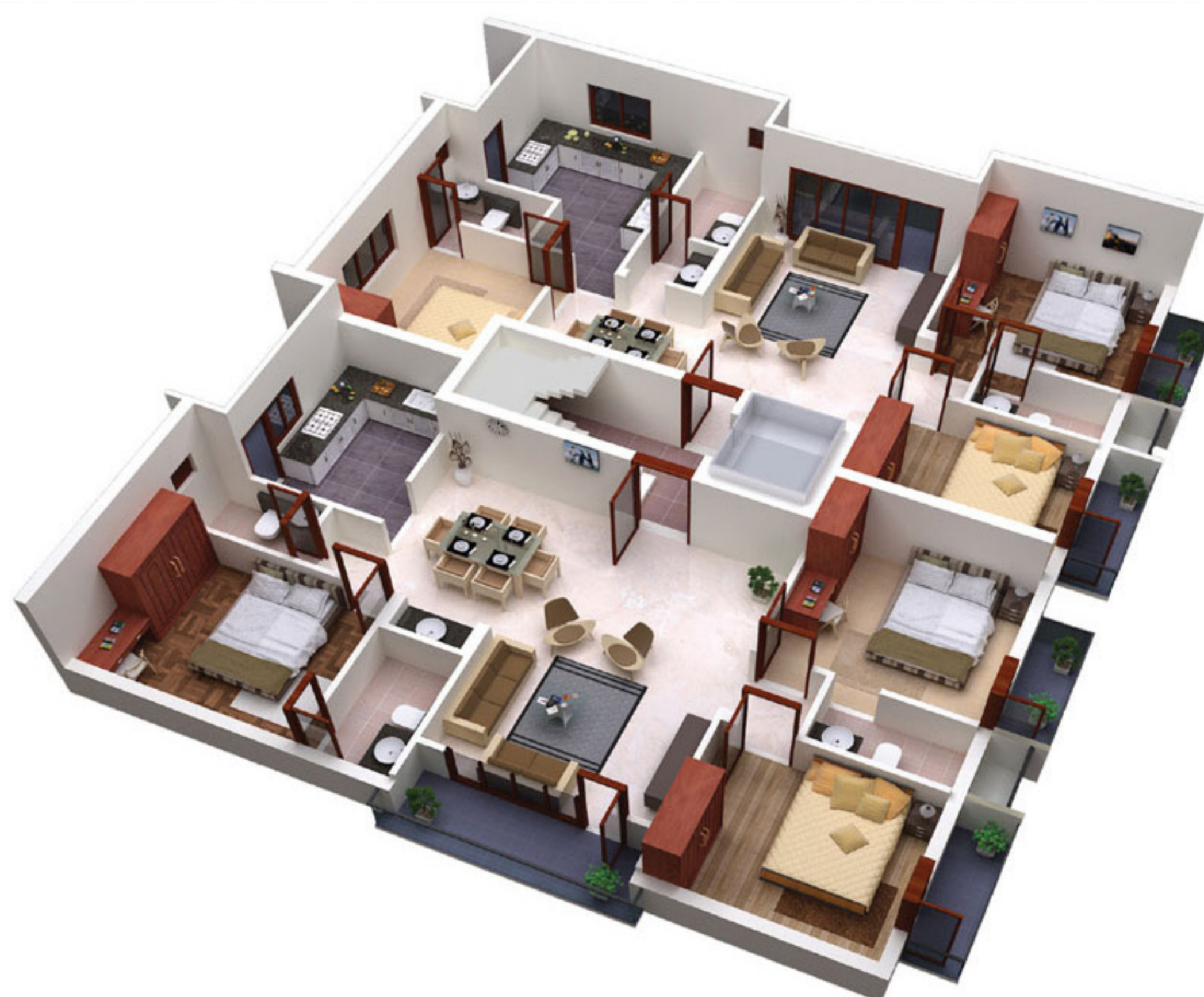
TYPICAL PLAN : 1 & 2 FLOOR