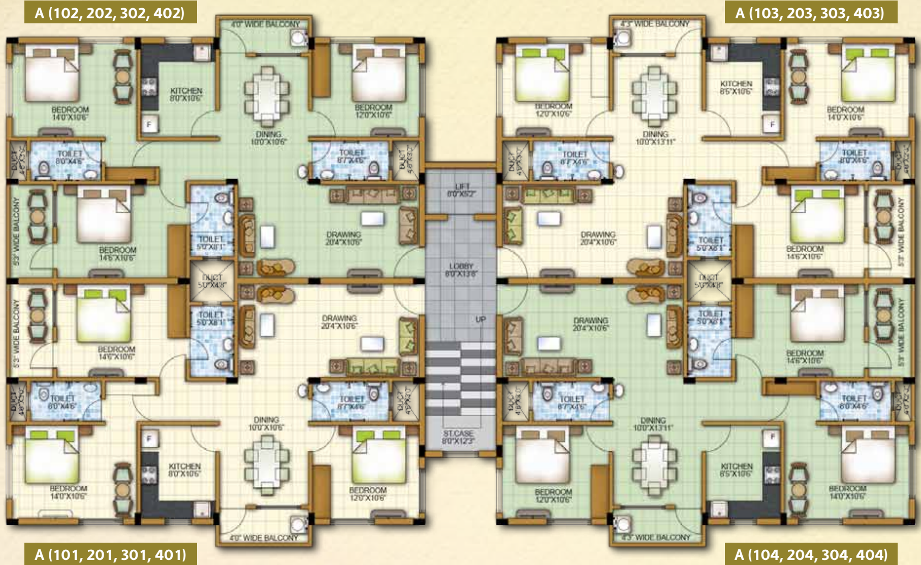
A (101, 201, 301, 401)