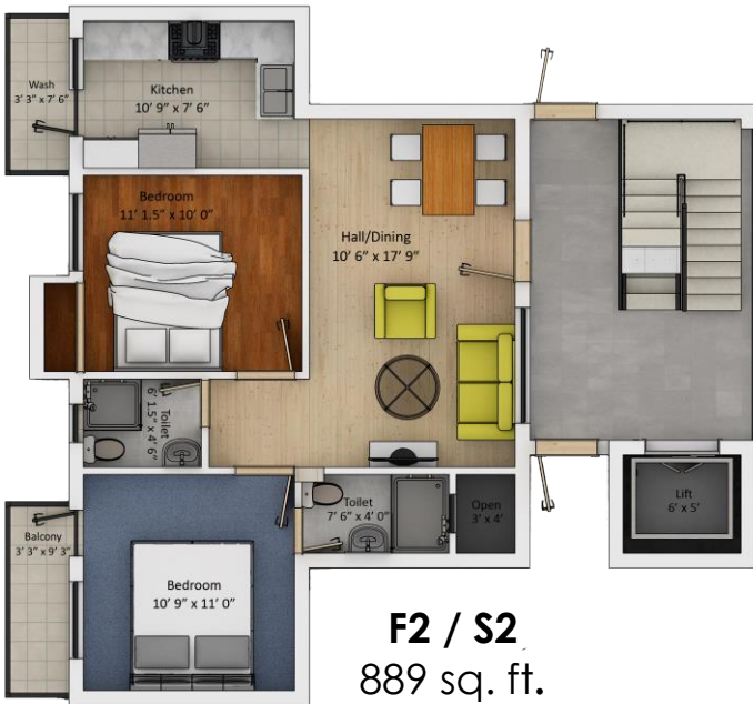
F2 / S2 889 sq. ft.