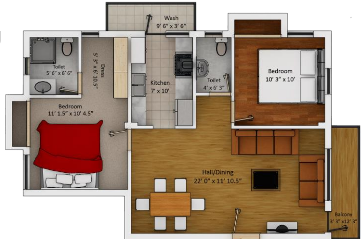
F1 / S1 1049 sq. ft.

We listened. We vetted. We tried and tested. Did everything to bring you the most attentively designed living spaces that adapt to your changing lifestyle.