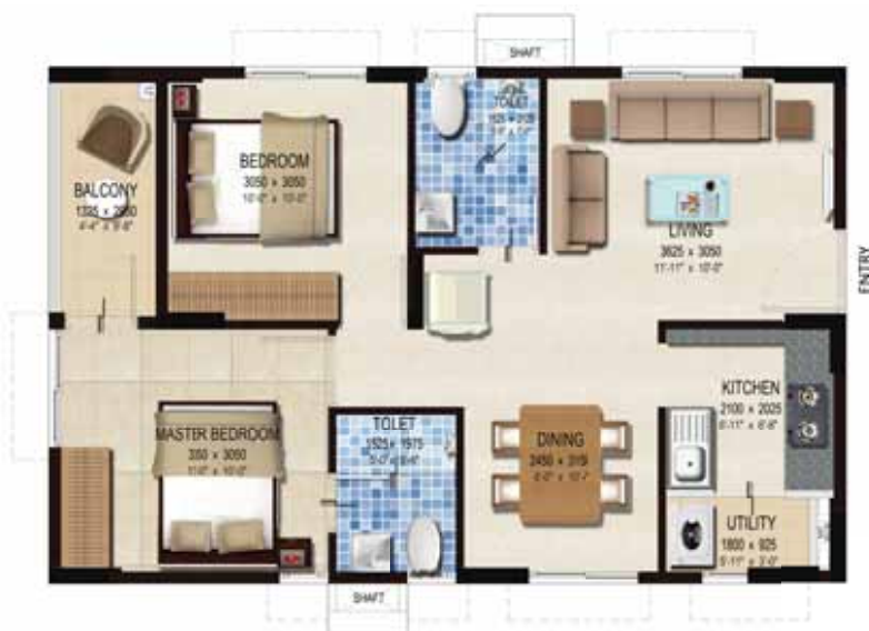
Typical 2 BHK Comfort