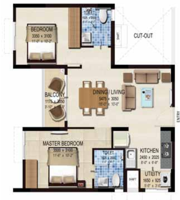
Typical 2 BHK Grand