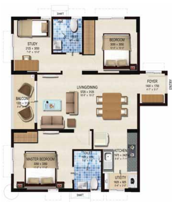
Typical 3 BHK Comfort