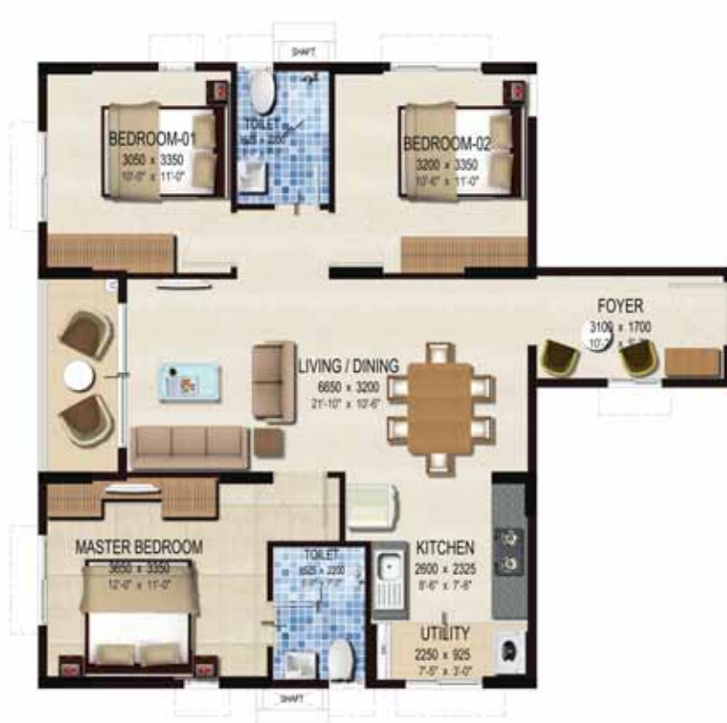
Typical 3 BHK Grand