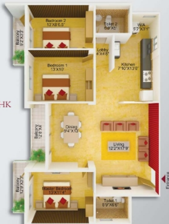
UNIT : 207, 307, 407 - 3 BHK 1536 Sqft.