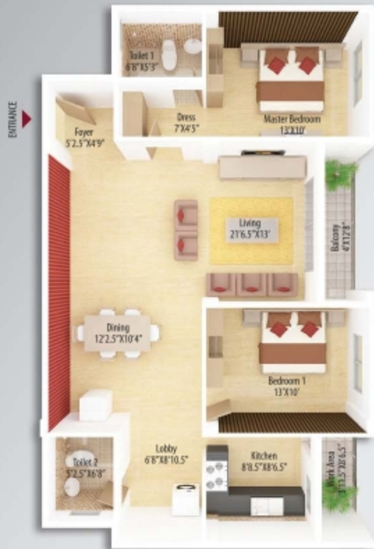
UNIT : 103, 105 - 2 BHK 1406 Sqft.