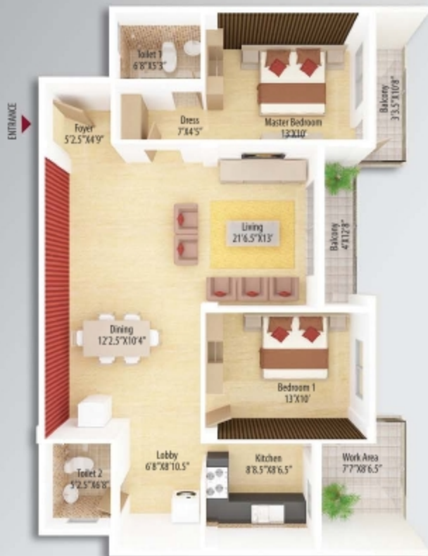
UNIT : 203, 205, 303, 305, 403, 405 - 2 BHK 1492 Sqft.