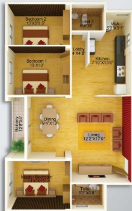
UNIT : 107- 3 BHK 1444 Sqft.