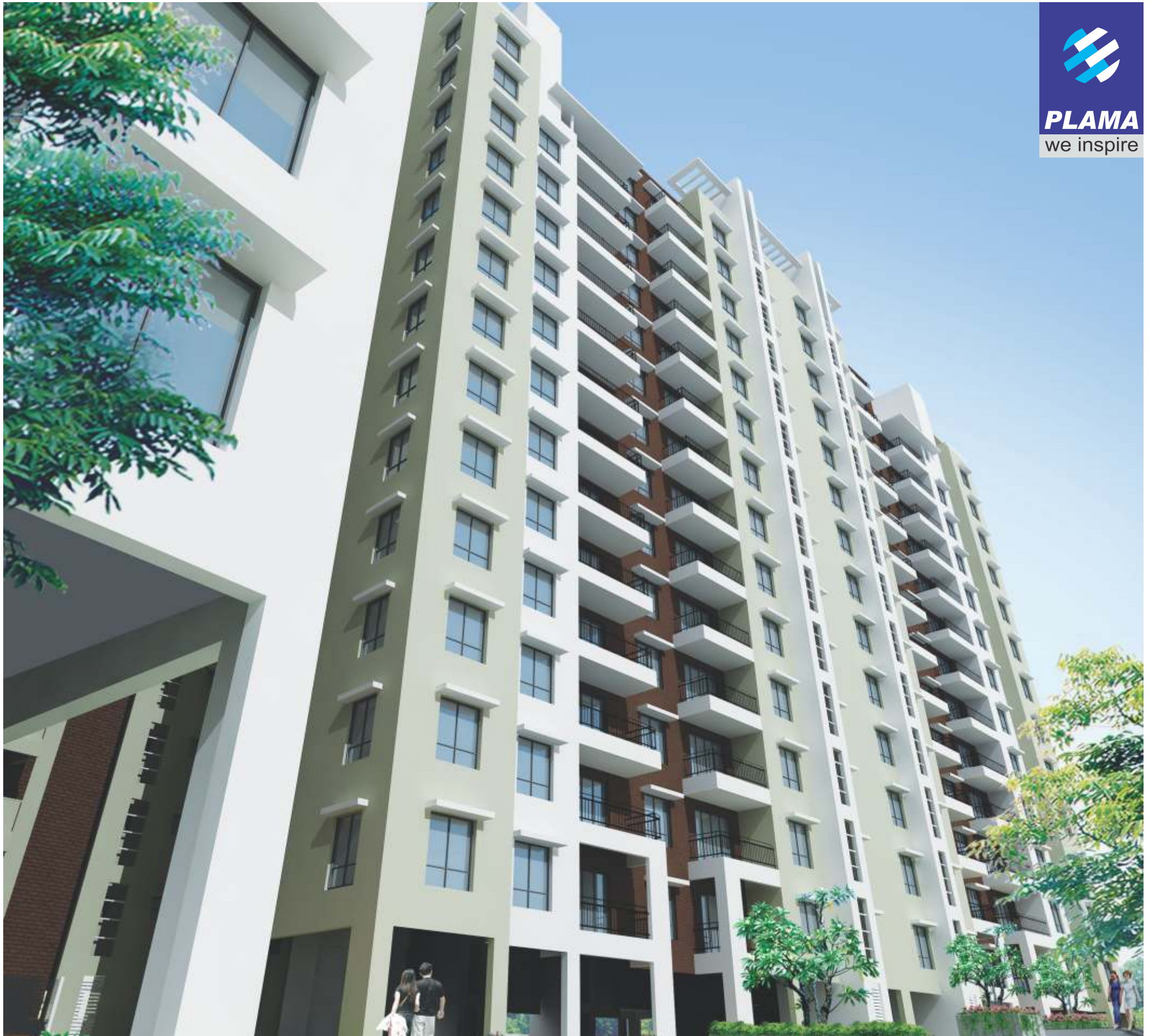
Plama Heights – View 1