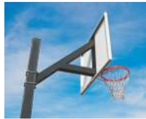
Basket Ball Pole