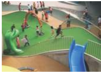
Sandpit with Children's Play Area