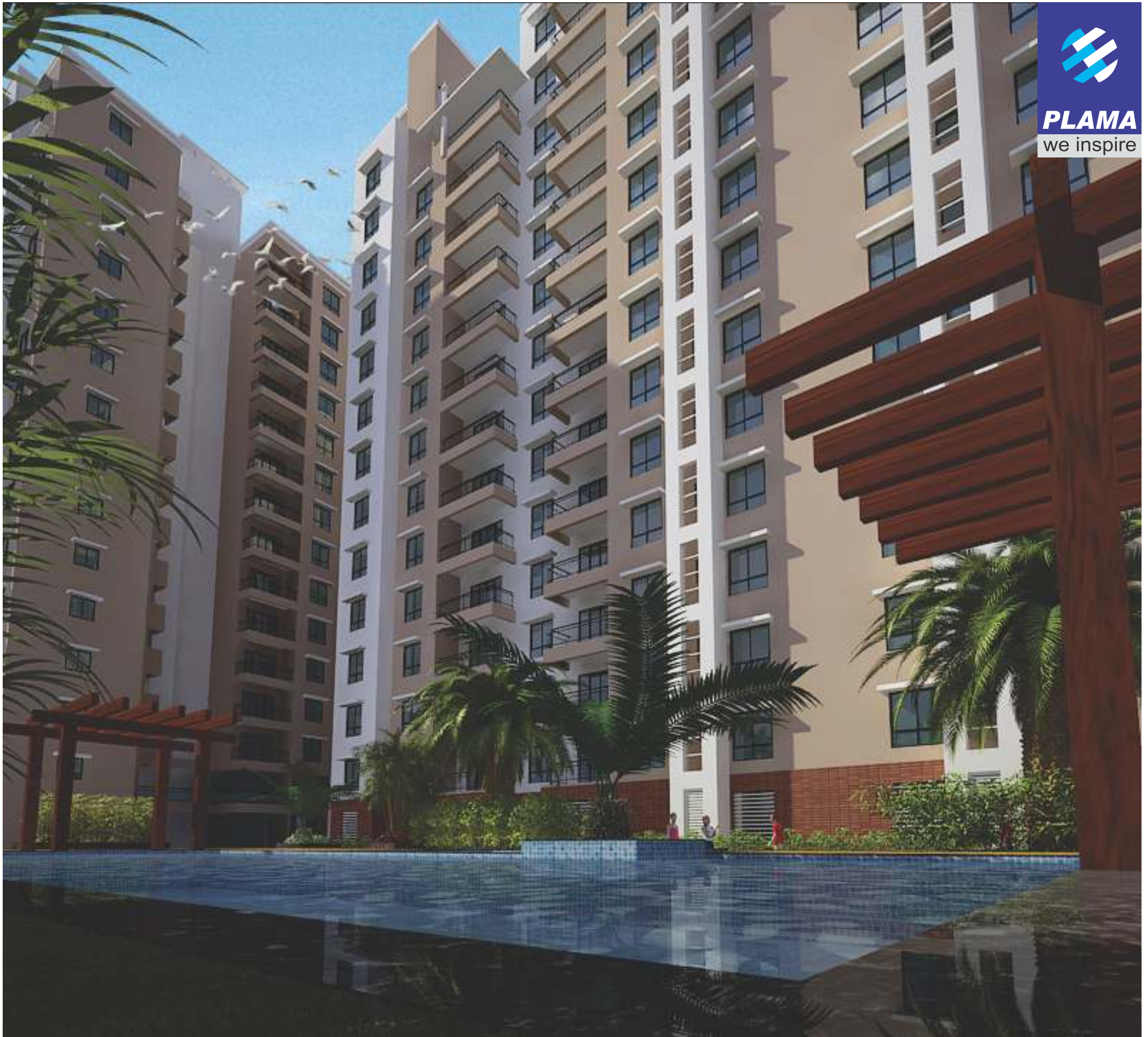
Plama Heights – View 2