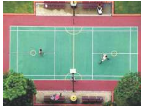
Shuttle Badminton Court