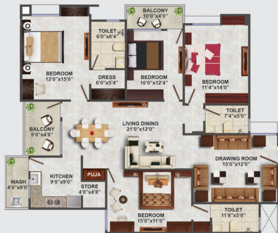
4 BHK Block-'E' Type