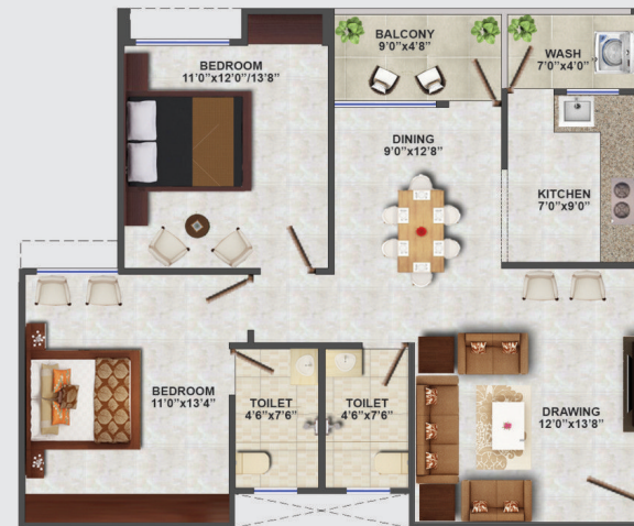
3 BHK Block-'C' Type