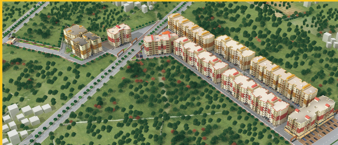
Bird eye view