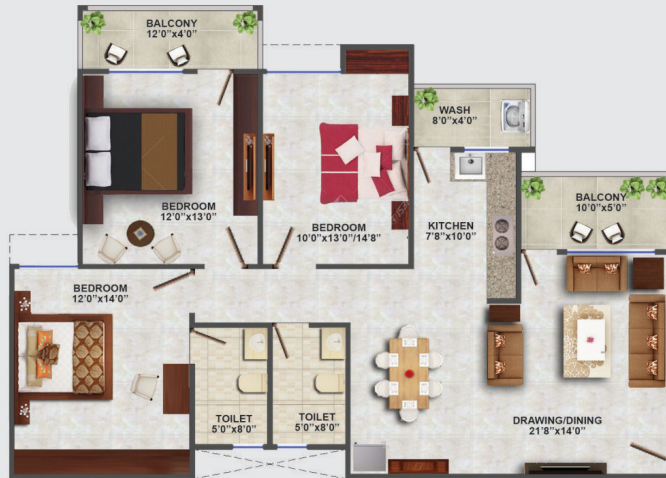
3 BHK Block-'B' Type