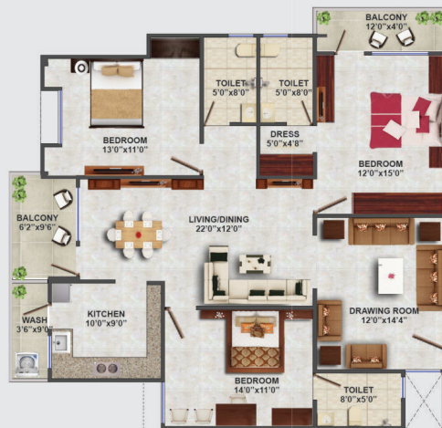
3 BHK Block-'F' Type