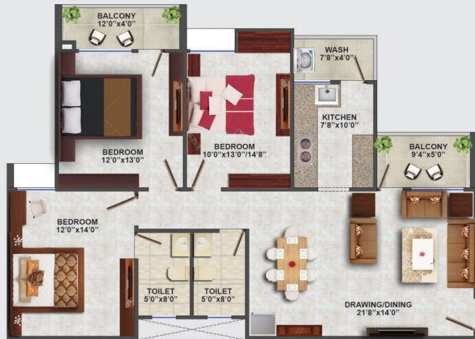
3 BHK Block-'A' Type