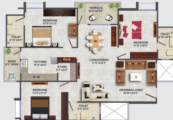
3 BHK Block-'G' Type