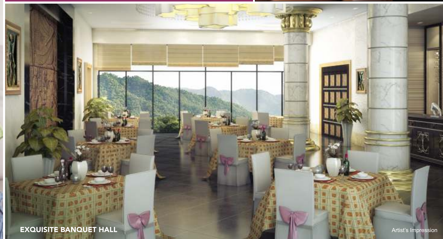
EXQUISITE BANQUET HALL