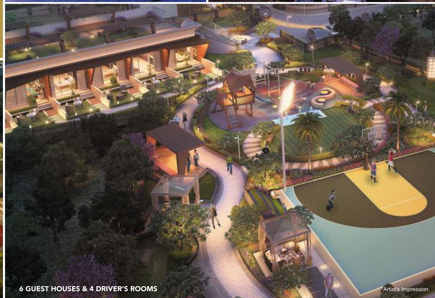
6 GUEST HOUSES & 4 DRIVER'S ROOMS