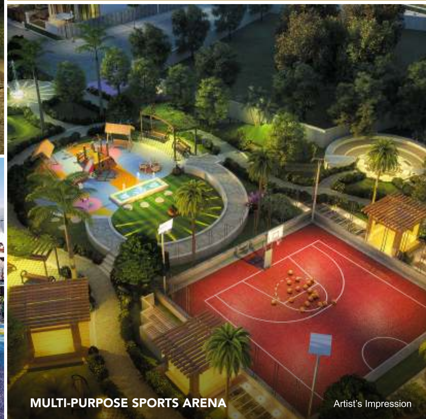
MULTI-PURPOSE SPORTS ARENA