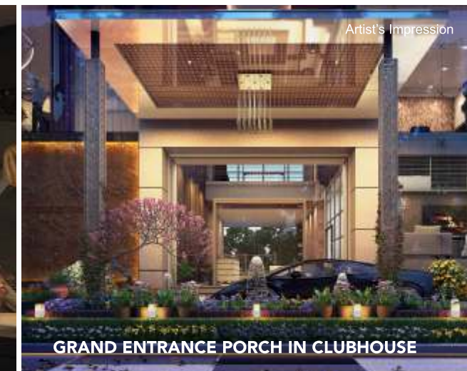
GRAND ENTRANCE PORCH IN CLUBHOUSE