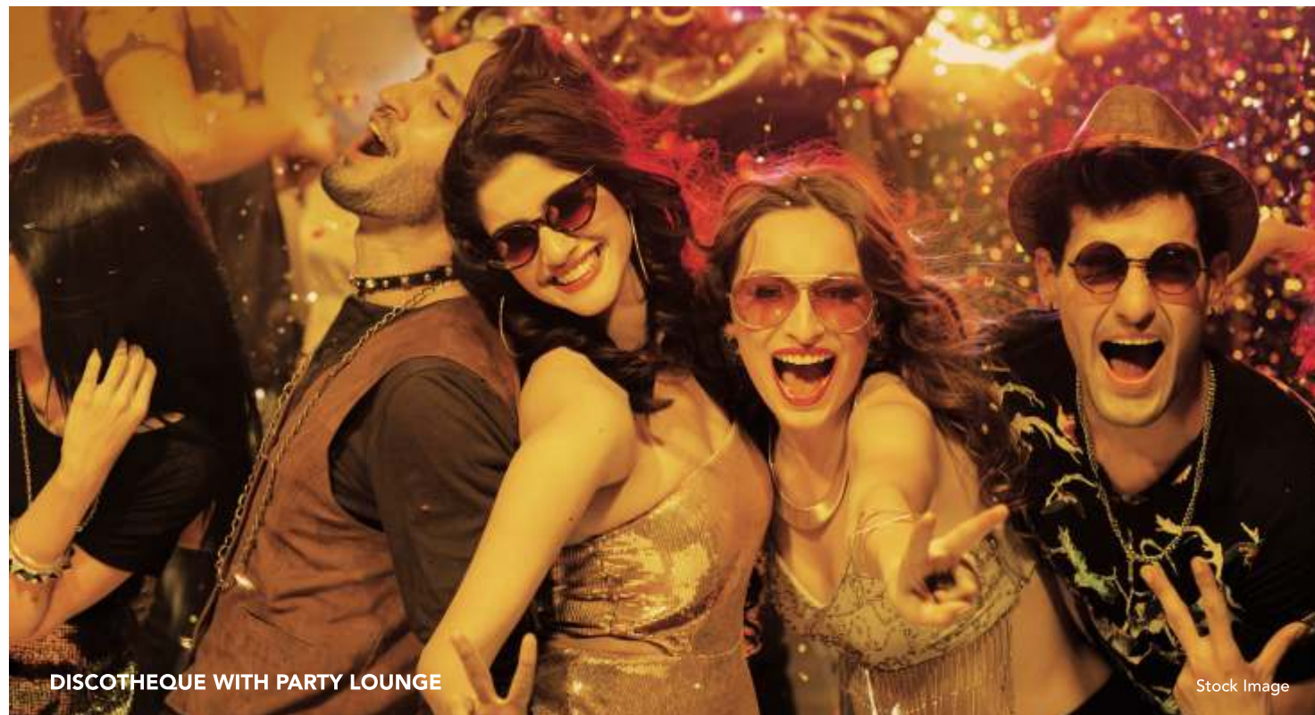
DISCOTHEQUE WITH PARTY LOUNGE