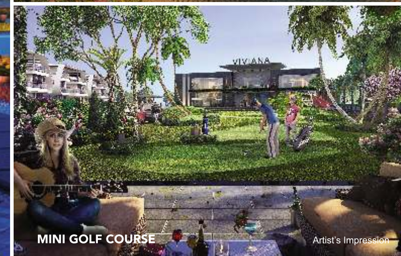
MINI GOLF COURSE