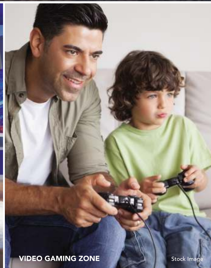
VIDEO GAMING ZONE