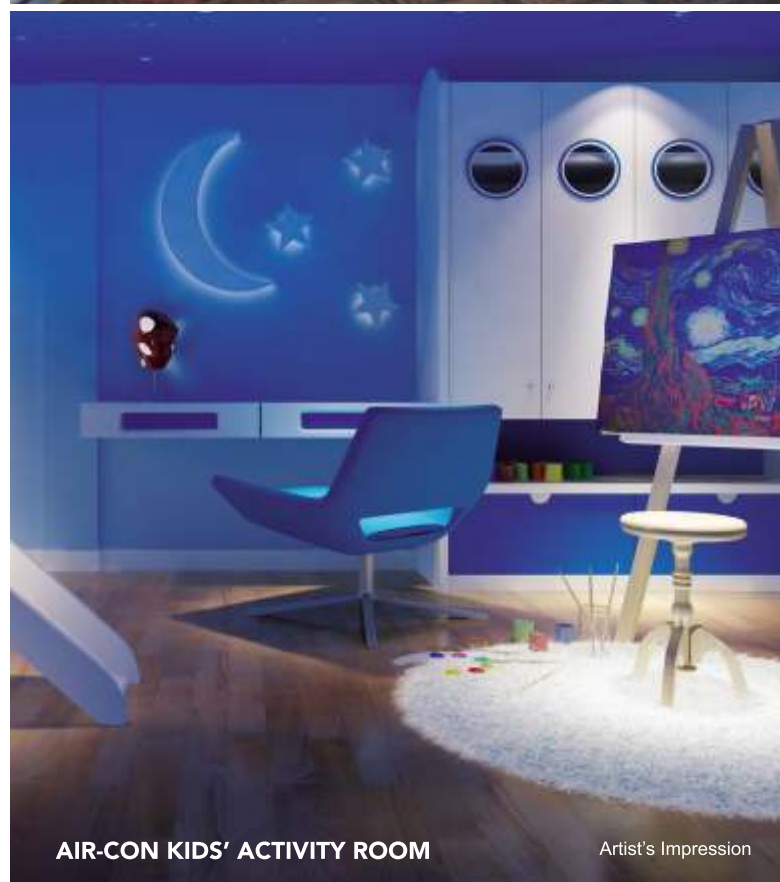
AIR-CON KIDS' ACTIVITY ROOM