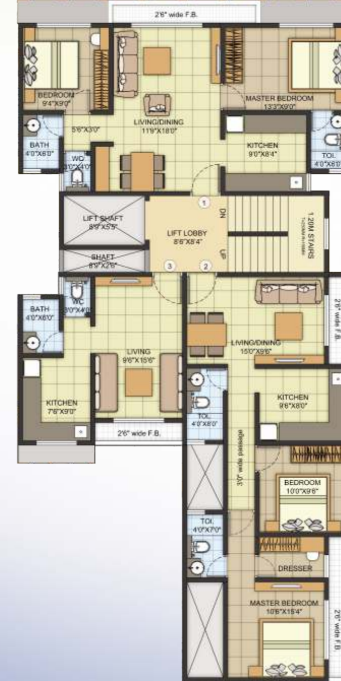
2 BHK + 1 RK - 2nd to 4th Floor