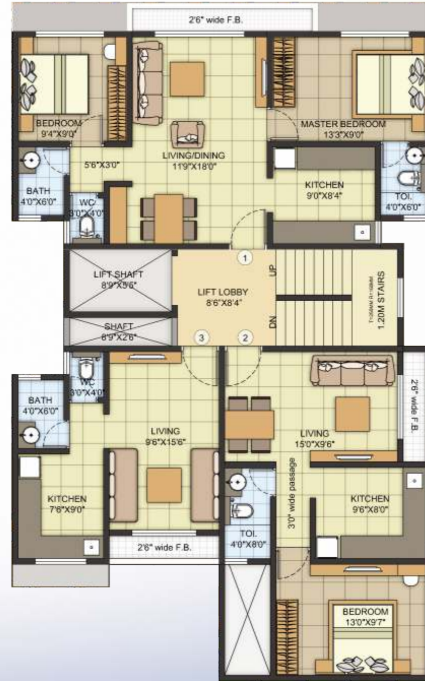
1 BHK + 1 RK - 2nd to 4th Floor