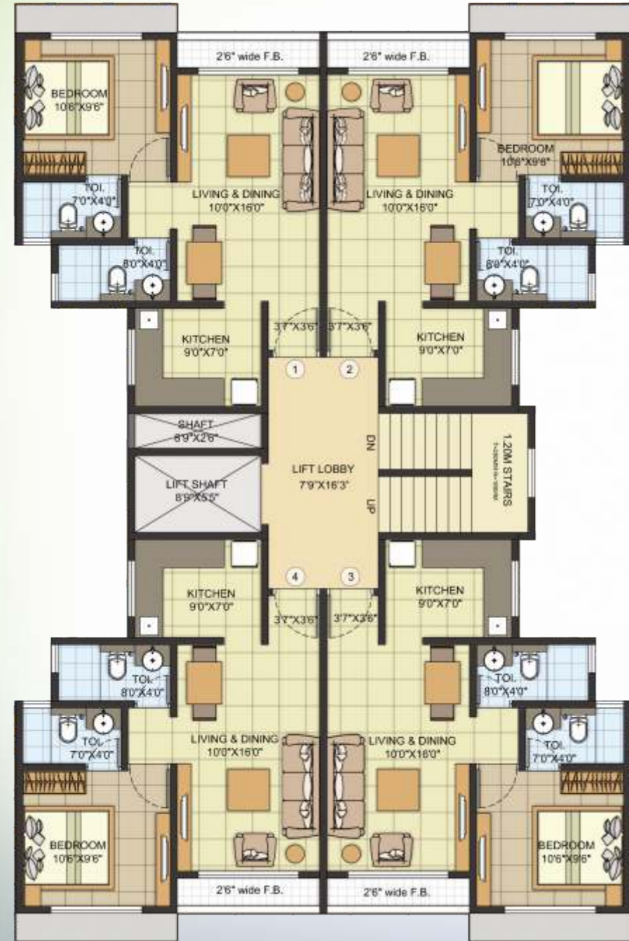
1 BHK - 1st to 4th Floor