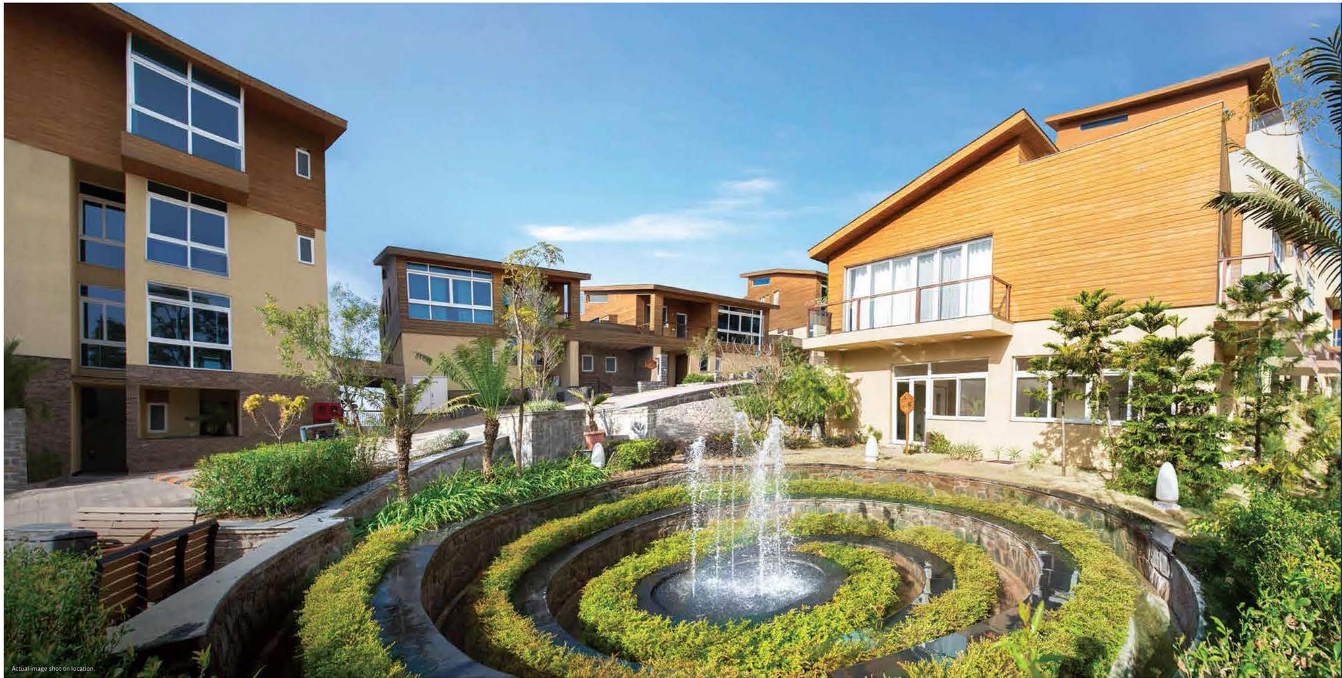
Actual image shot on location.