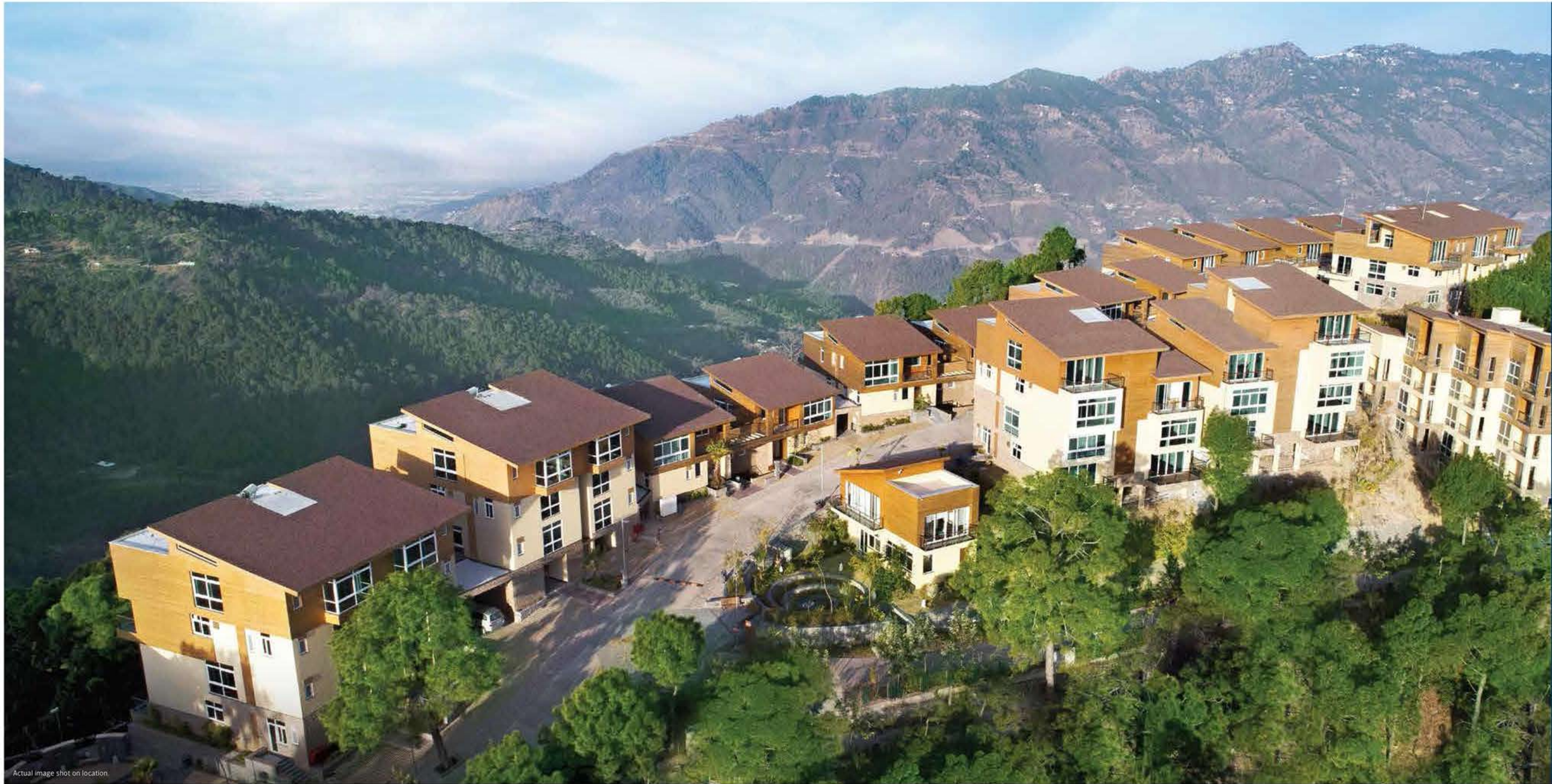
Actual image shot on location.