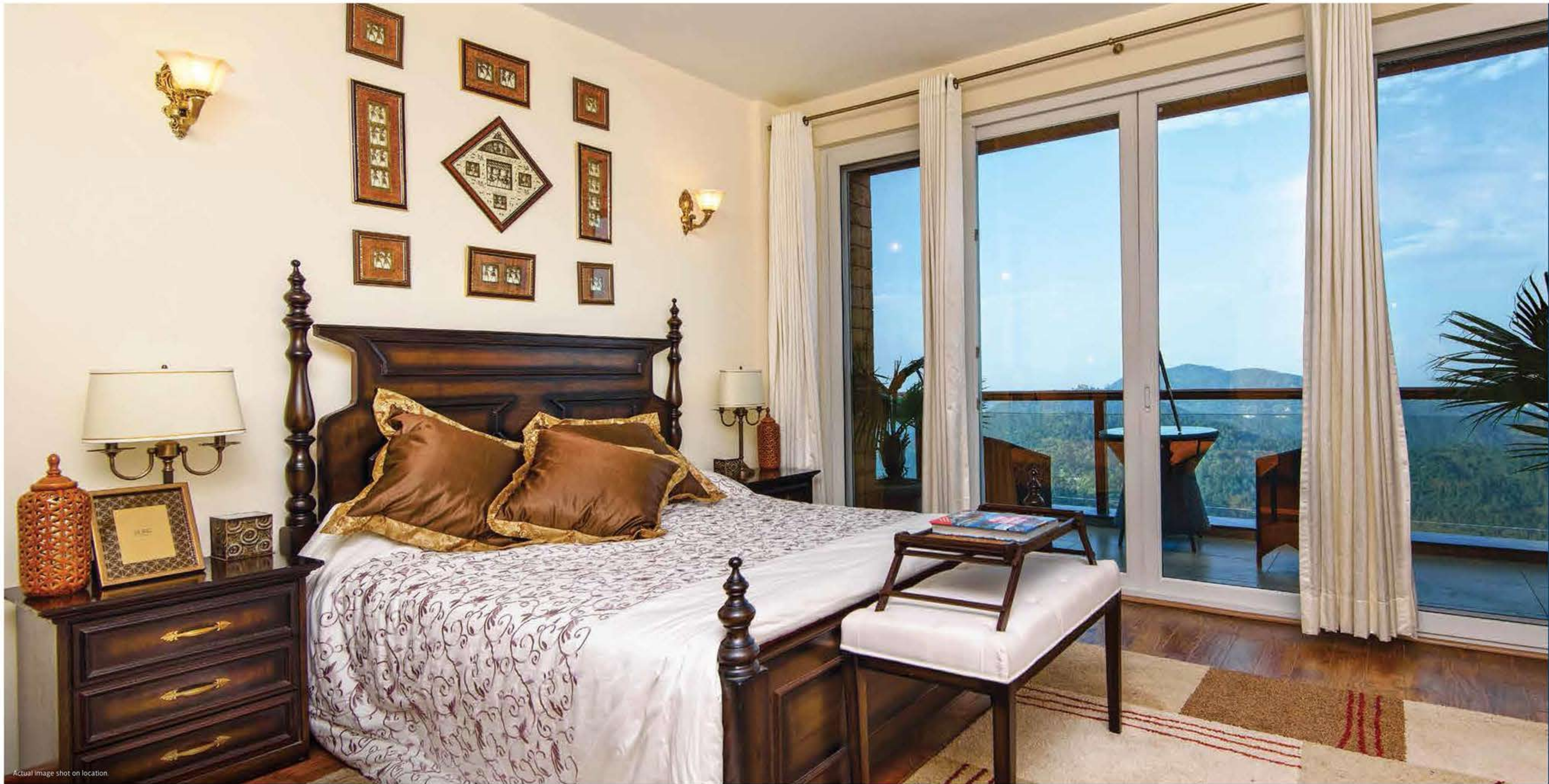
Actual image shot on location.