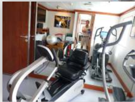
Fitness dreams fulfilled with the state-of-the-art Gymnasium Centre