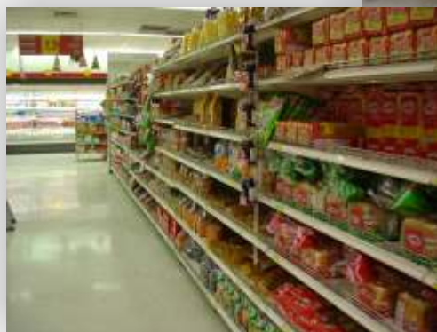
Integrated Super Market