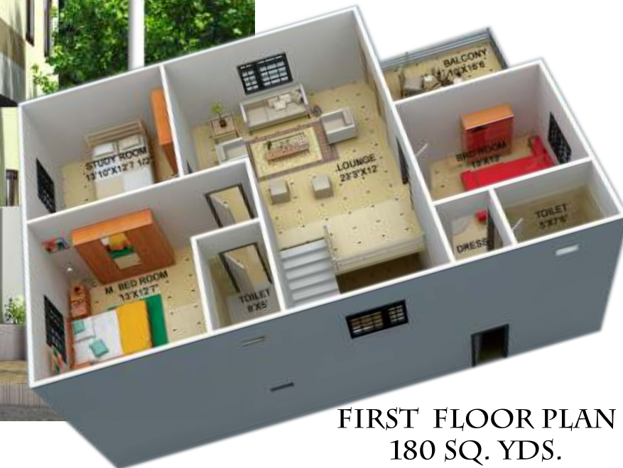
FIRST FLOOR PLAN 180 SQ. YDS.

Not just flexible space options at your disposal, but also a choice to live life in exclusivity. You also have a choice to own a duplex version in a spacious 180 sq. yd. plot which is well designed and planned keeping the needs of small/medium sized families seeking huge living spaces in every corner of the house they live in with all the modern amenities.