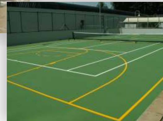
Tennis Court you love to play on