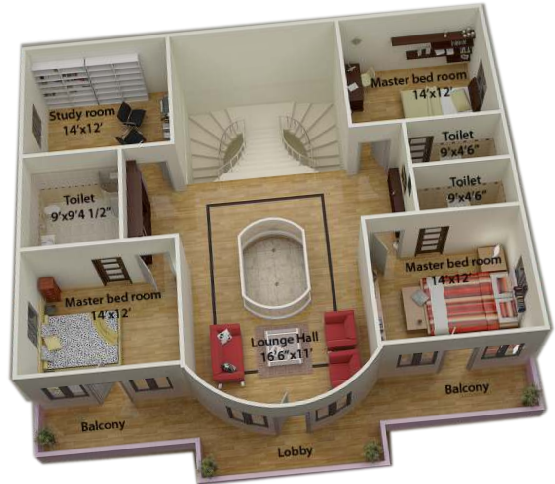
360 SQ. YDS. FIRST FLOOR PLAN