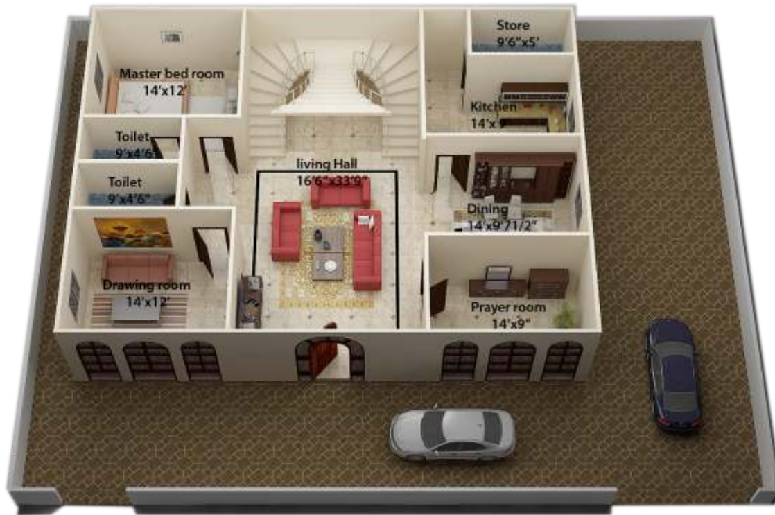
360 SQ. YDS. GROUND FLOOR PLAN