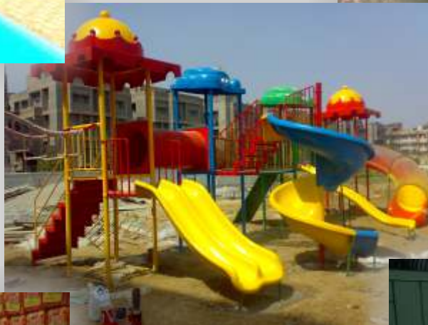
Children Park in Two locations