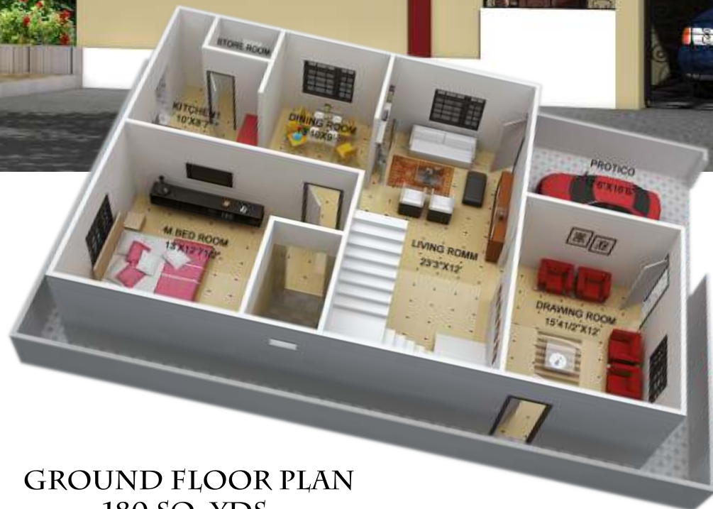
GROUND FLOOR PLAN 180 SQ. YDS.