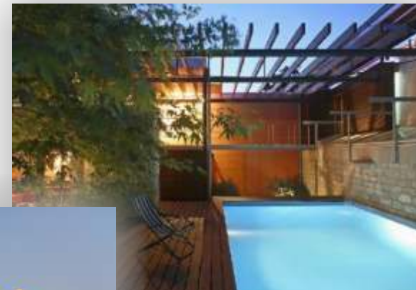
Ultra-Modern Swimming Pool