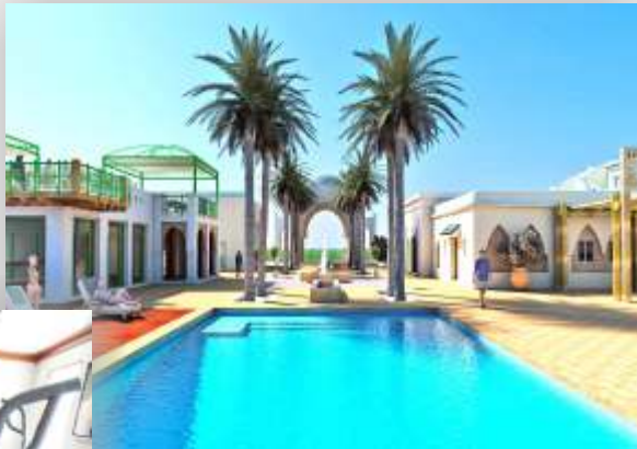
Modern Club house designed to taste for you to relax after a busy day at work