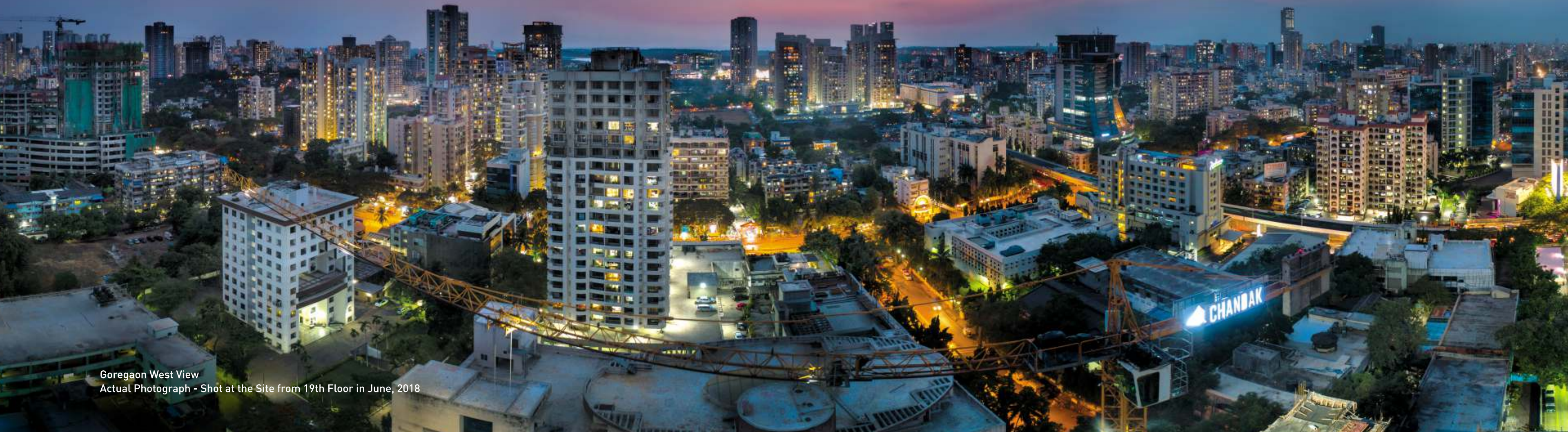
Goregaon West View Actual Photograph - Shot at the Site from 19th Floor in June, 2018

HAPPINESS IS KNOWING THAT YOU ARE IN THE HEART OF GOREGAON