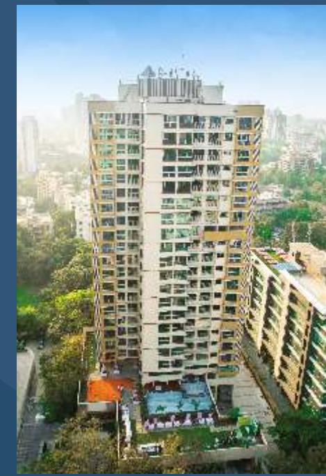
PALOMA GOREGAON (EAST)