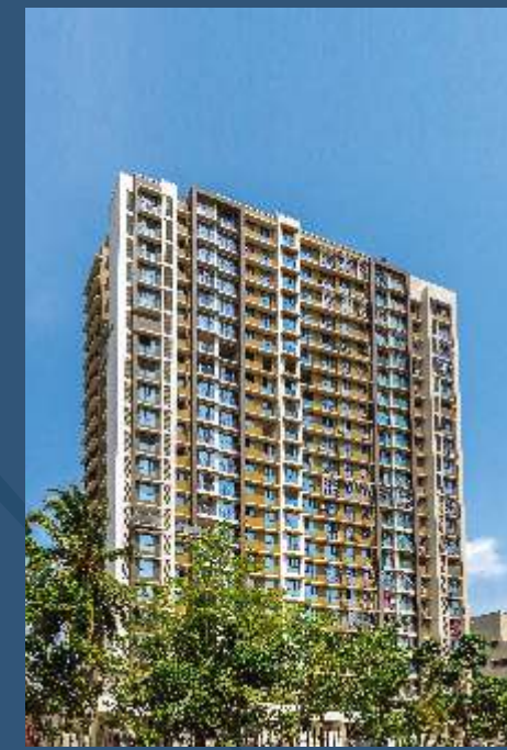
HARMONY KANDIVALI (WEST)