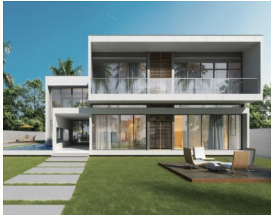
VILLA FLAMINGO 6 BHK