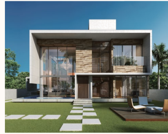
VILLA DOVE 4 BHK