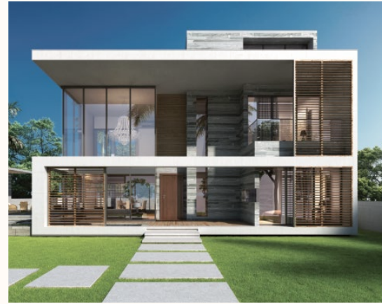
VILLA IBIS 5 BHK