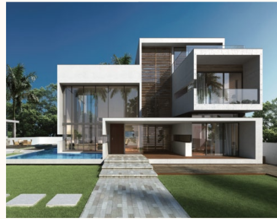
VILLA PELICAN 5 BHK