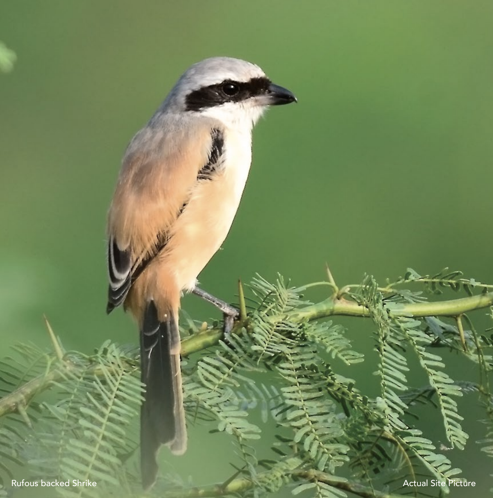
Rufous backed Shrike