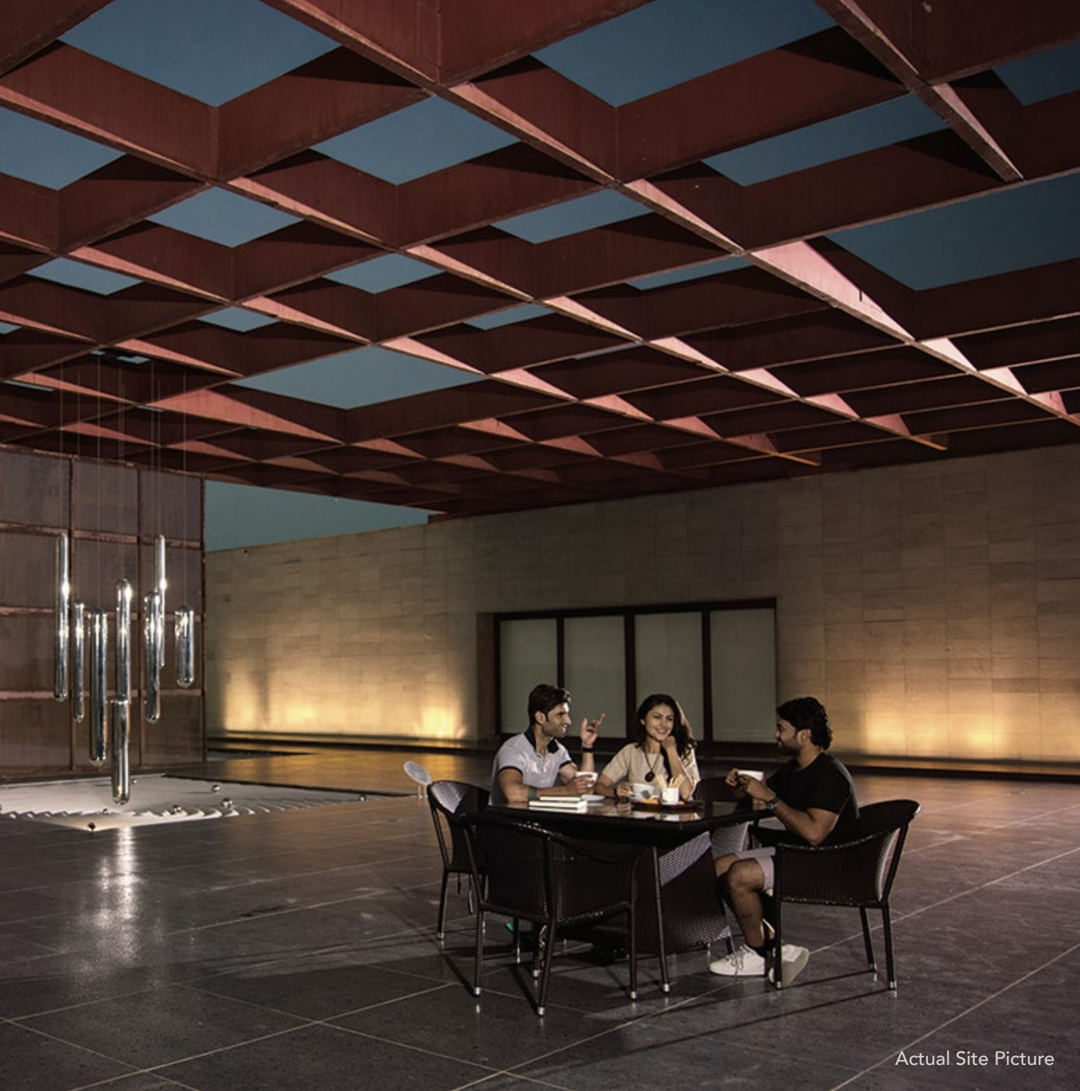
Actual Site Picture

Peace is about having a quiet day looking at clear blue skies and dreaming with open eyes and more importantly an open mind. Free your mind and explore various activities that bring peace and knock the doors of your mind. Enter the realm of boundless unwinding and awaken your soul. With fully equipped centres for wellness, the Zen Square at Uplands One takes peace to a new level altogether. Spread over 72,000 sq. ft. of land, this chunk of earth is dedicated to those seeking the divine. The aura of the location can heal the mind and free it. Lush landscaping with water fountains add a natural touch to this 5,000 sq. ft. meditation hall.