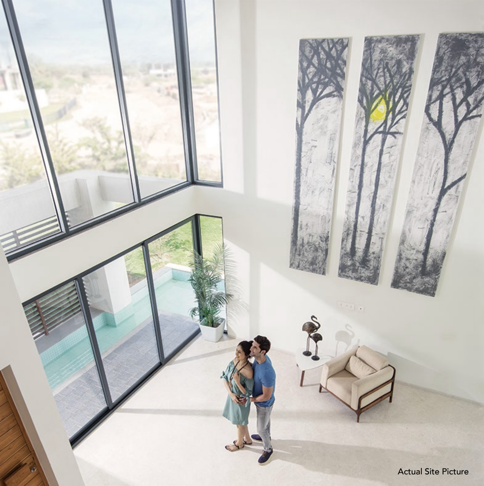
Actual Site Picture