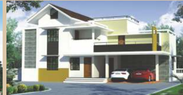
Cinthia Park Thirissur.