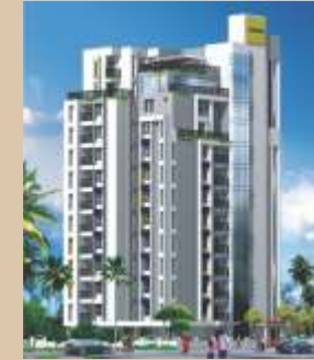
Coronet Apartments Thirissur.