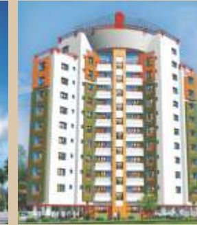
Corel Apartments Thirissur.