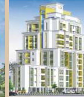
Chaithram Apartments Thirissur.