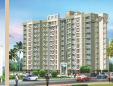
Cedar Premium Apartments Thirissur.