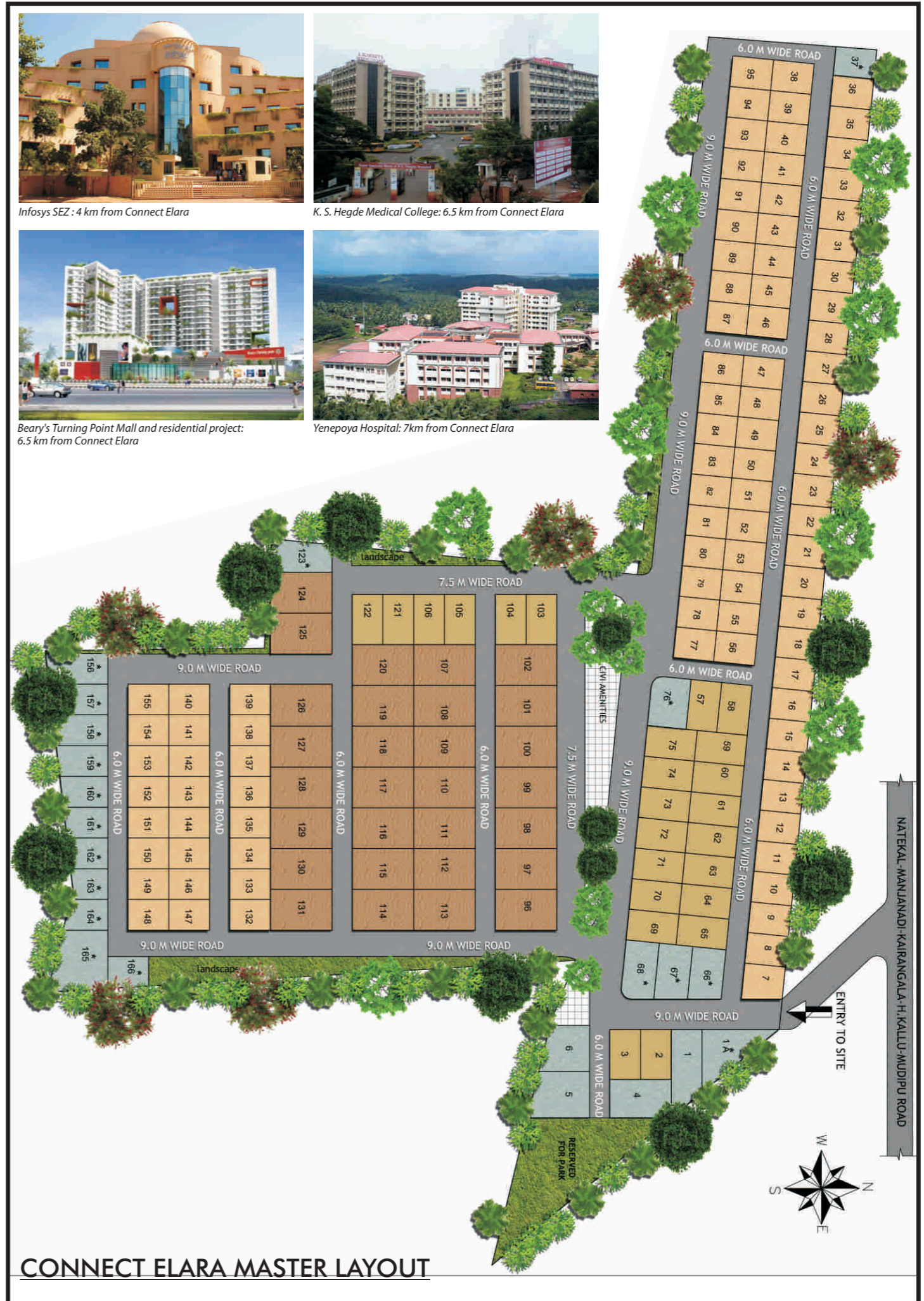
CONNECT ELARA MASTER LAYOUT