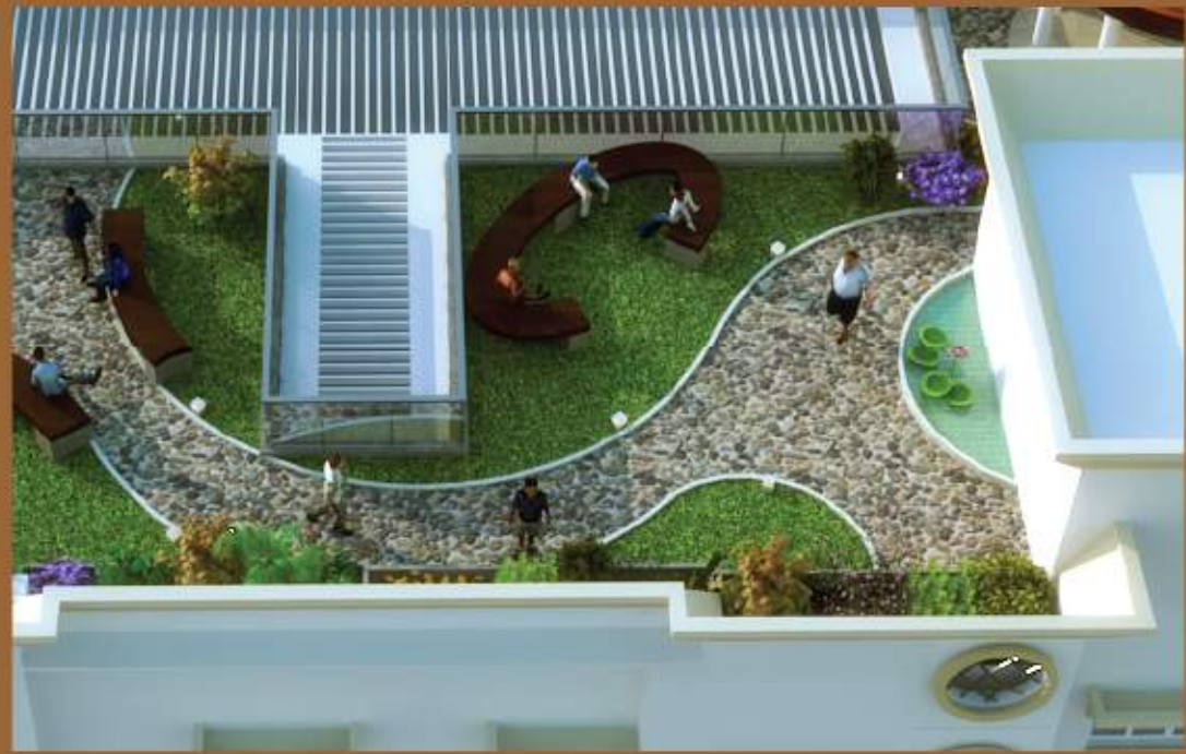
Landscaped Terrace Garden