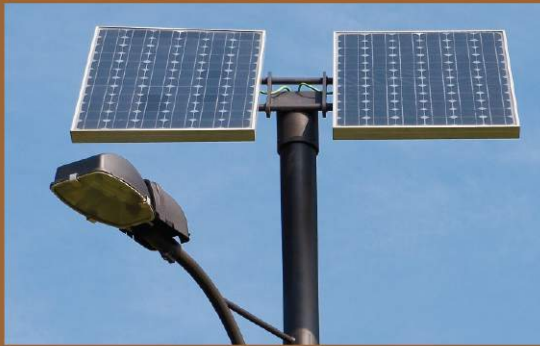
Solar Lighting for Common Area