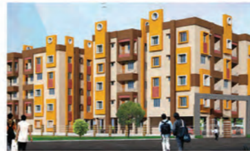
Skyline Harmony, Fartabad, Garia