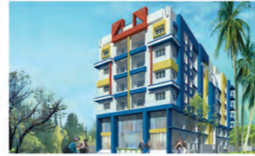
Skyline Sapphire, Bansdrani

SKYLINE GROUP has an array of projects lined up for the future which will be home to a number of families who yearn for quality living.