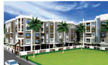
Skyline Lakeview, Purbapara, Laskarpur, Garia