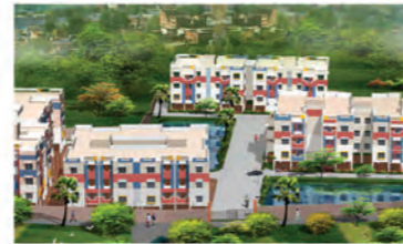
Skyline Apartments, Parnashree, Behala