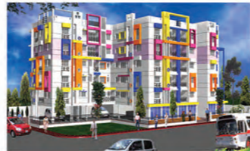
Skyline Mansion, James Long Sarani