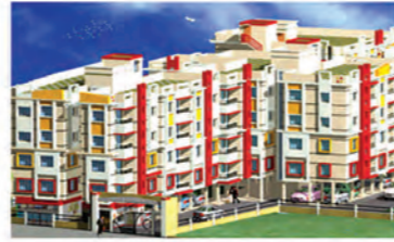
Skyline Residency, Hindusthan More, Garia