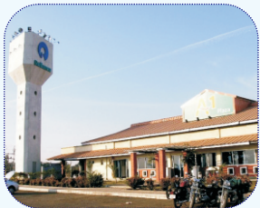
Reliance A1 Plaza