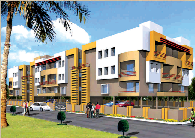
Riddhi Siddhi Enclave Laxmi Sagar