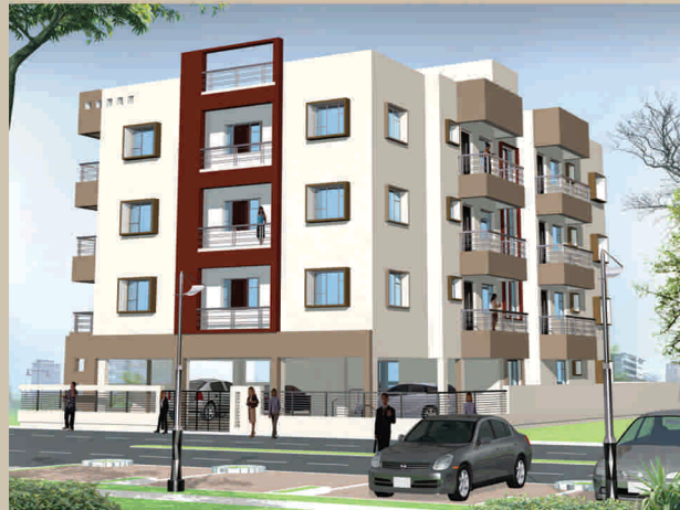
PDN Imperial Chandrasekharpur