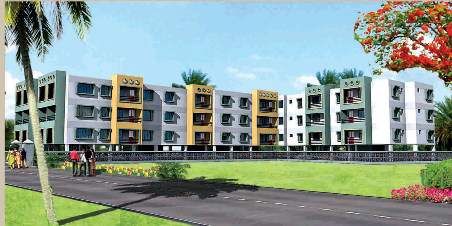
Khandagiri Udyan Khandagiri