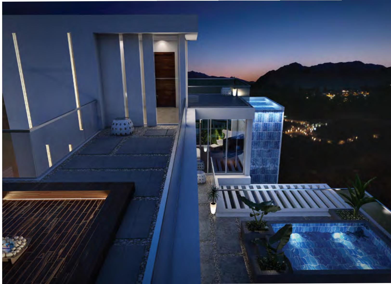
TERRACE VIEW AT DAWN