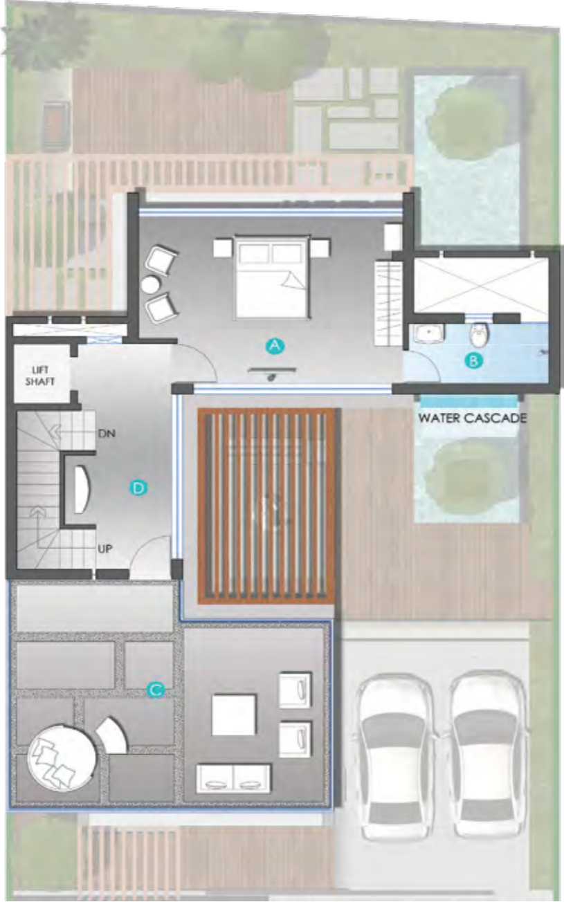
SECOND FLOOR PLAN - TYPE C