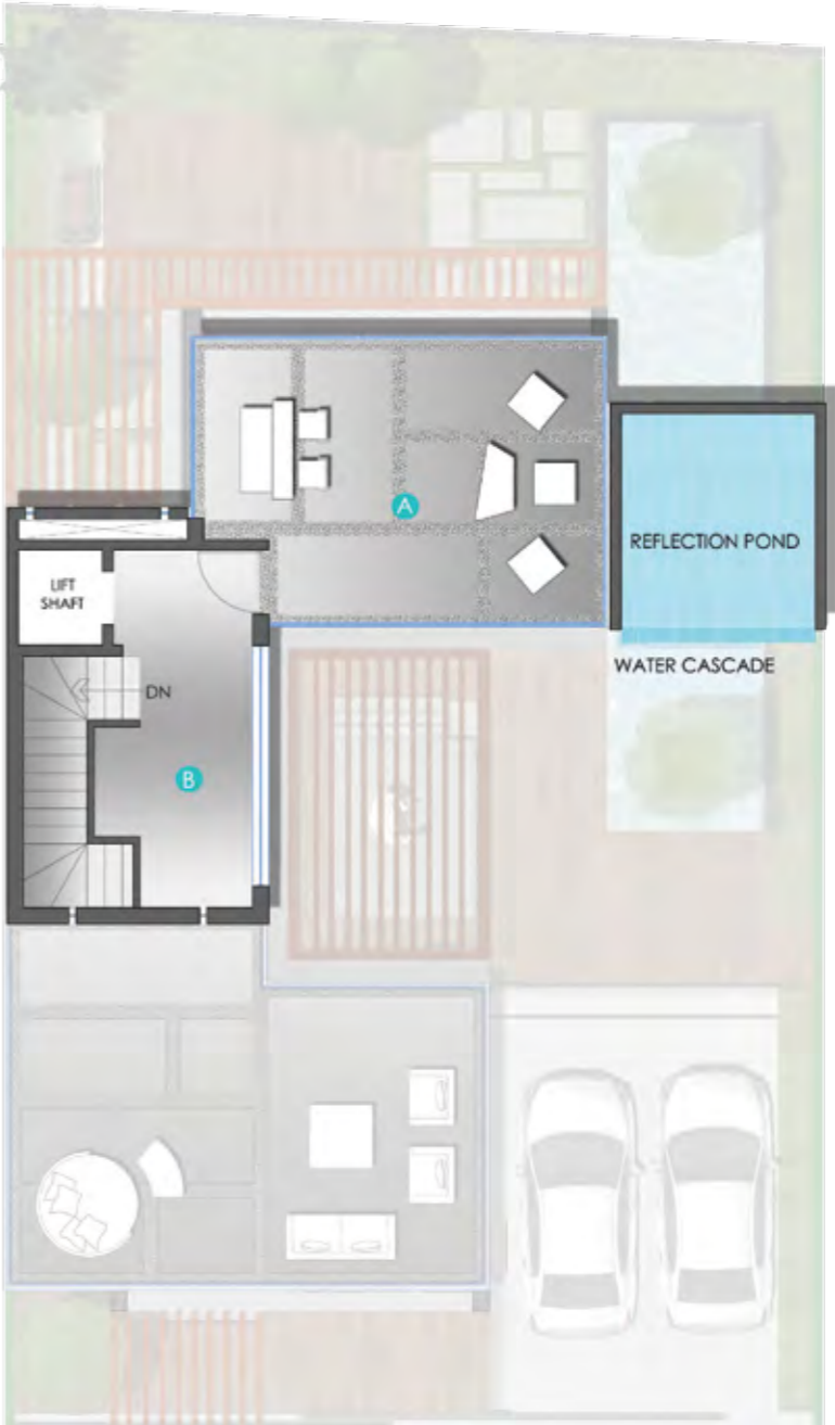
TERRACE FLOOR PLAN - TYPE C