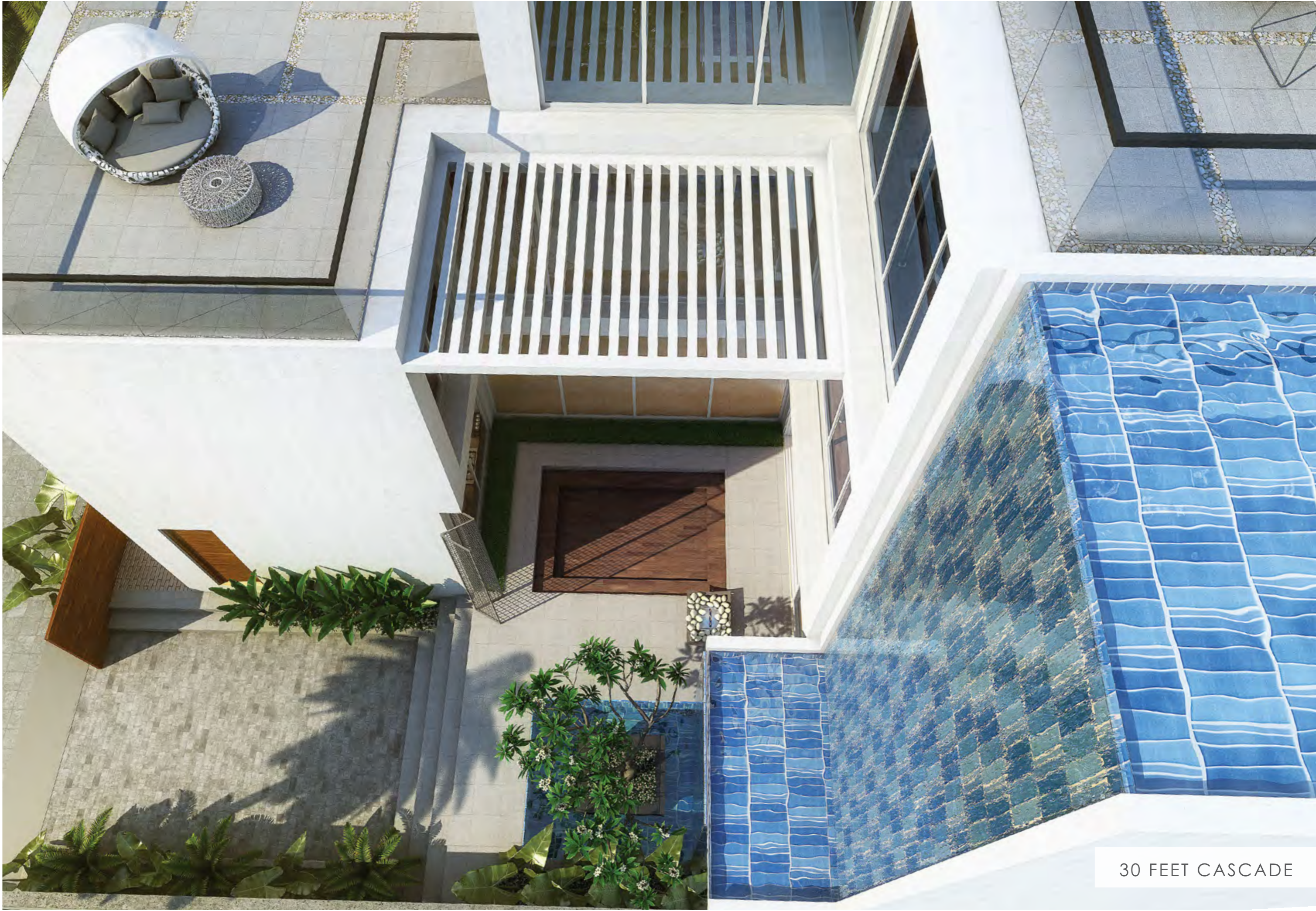
30 FEET CASCADE