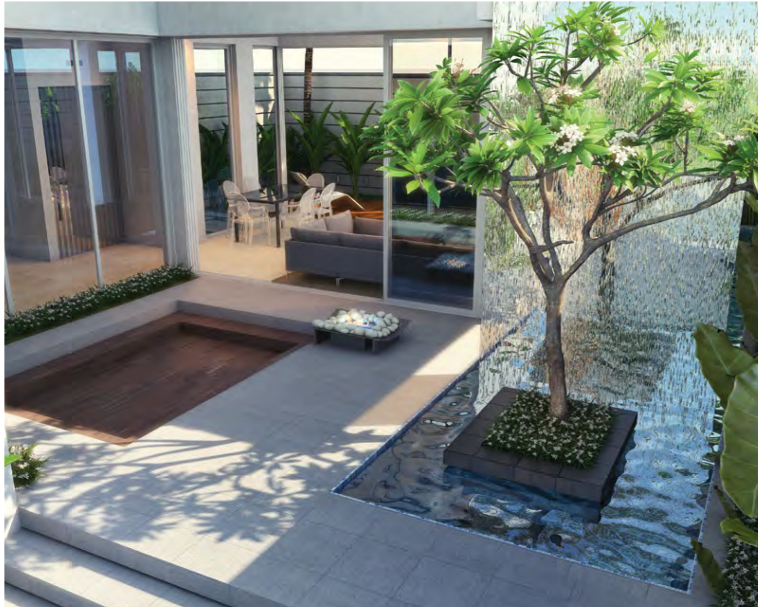
INDOOR OUTDOOR SPACE