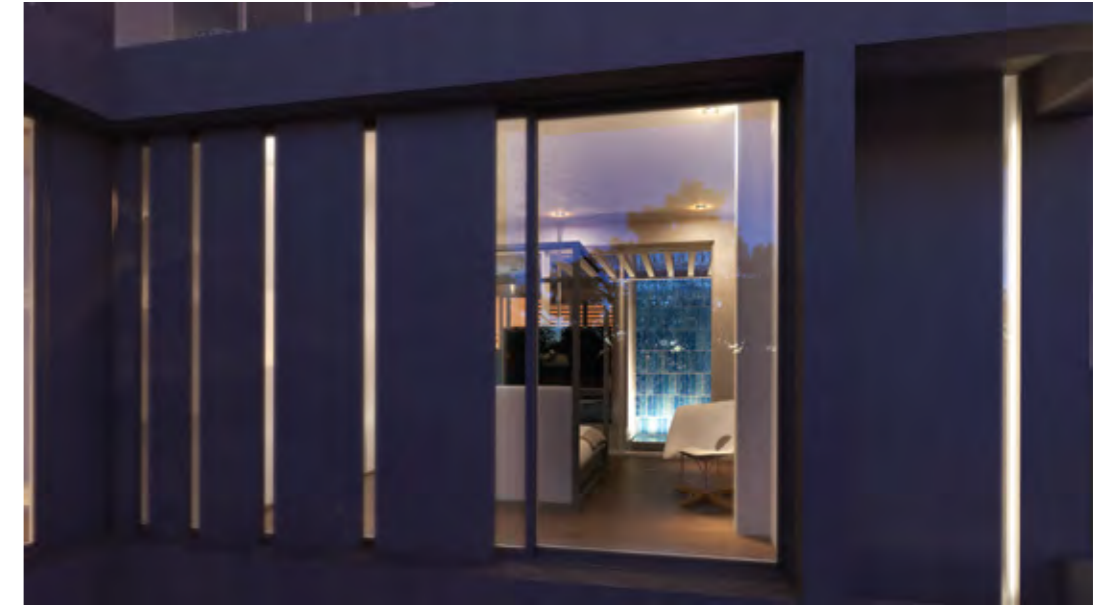
BEDROOM OVERLOOKING THE CASCADE