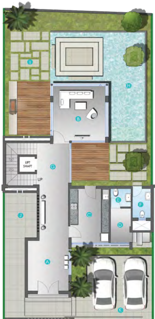
GROUND FLOOR PLAN - TYPE B