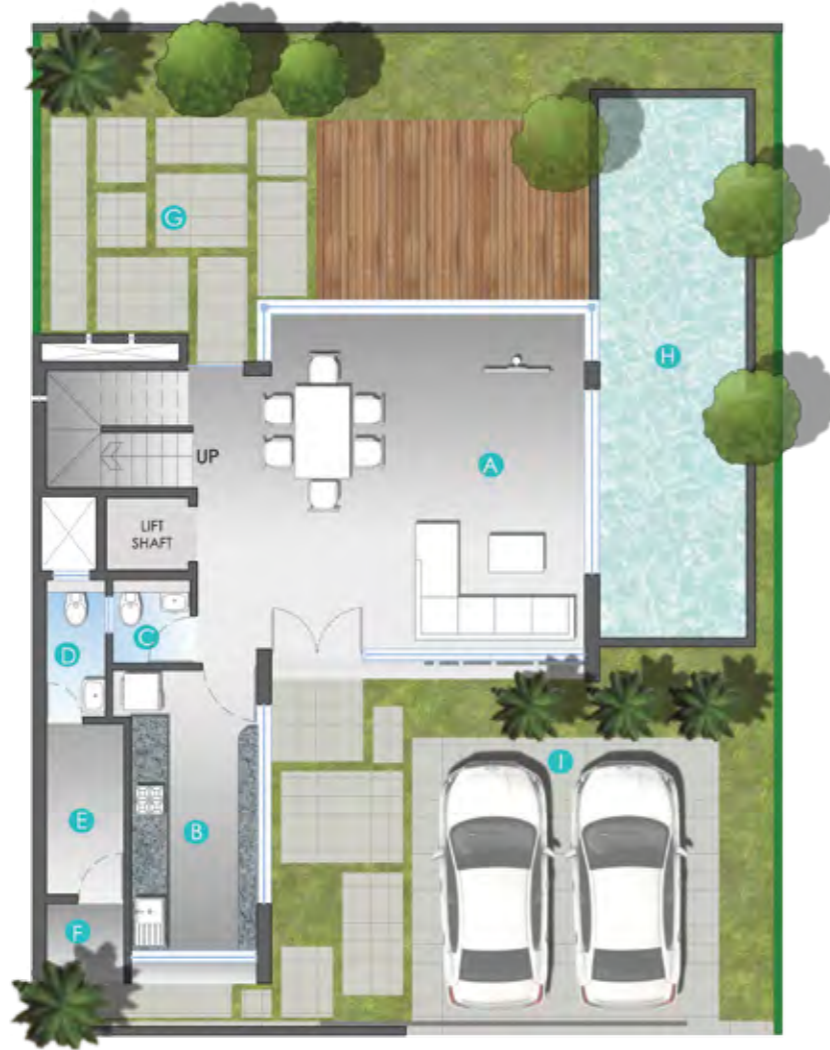
GROUND FLOOR PLAN - TYPE A