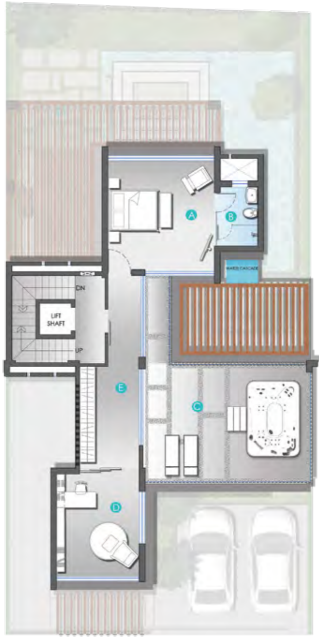
SECOND FLOOR PLAN - TYPE B