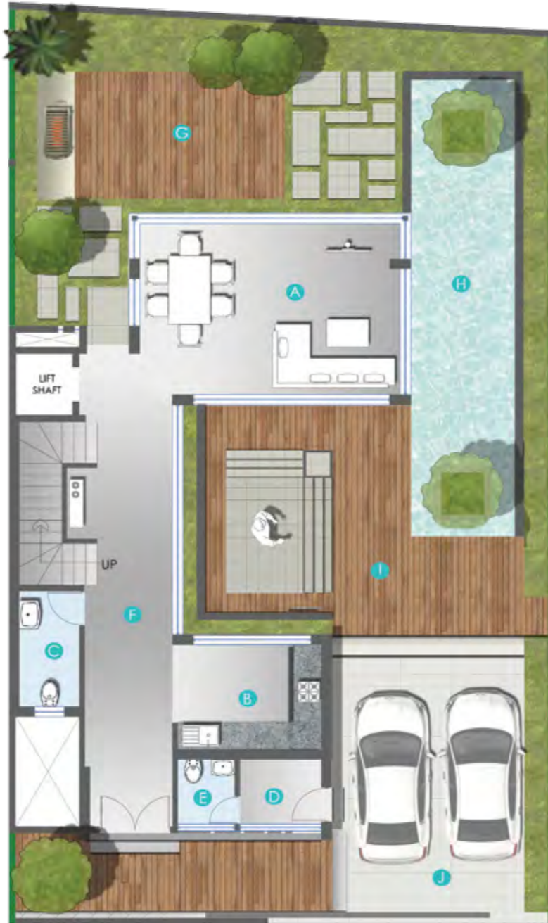
GROUND FLOOR PLAN - TYPE C