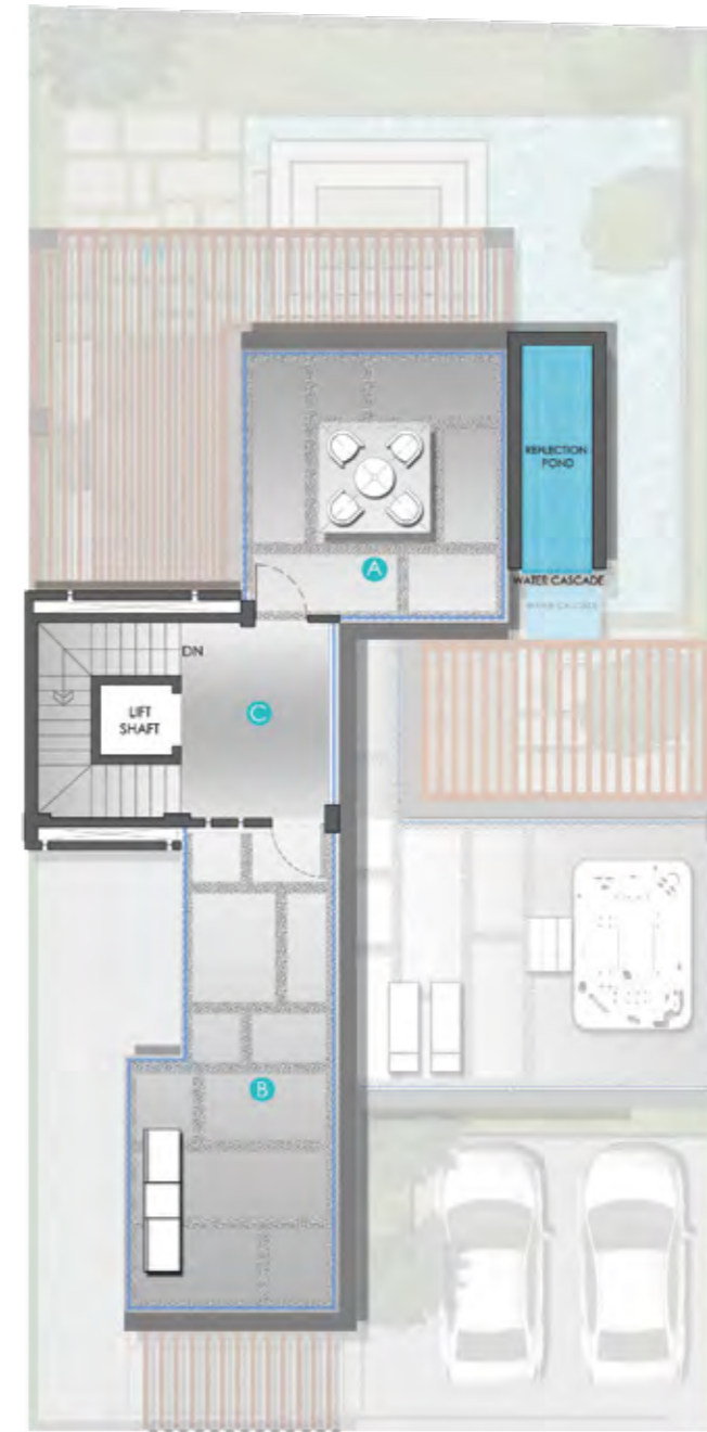
TERRACE FLOOR PLAN - TYPE B