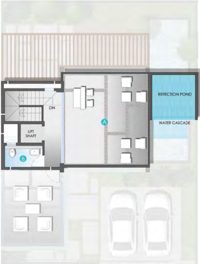
TERRACE FLOOR PLAN - TYPE A