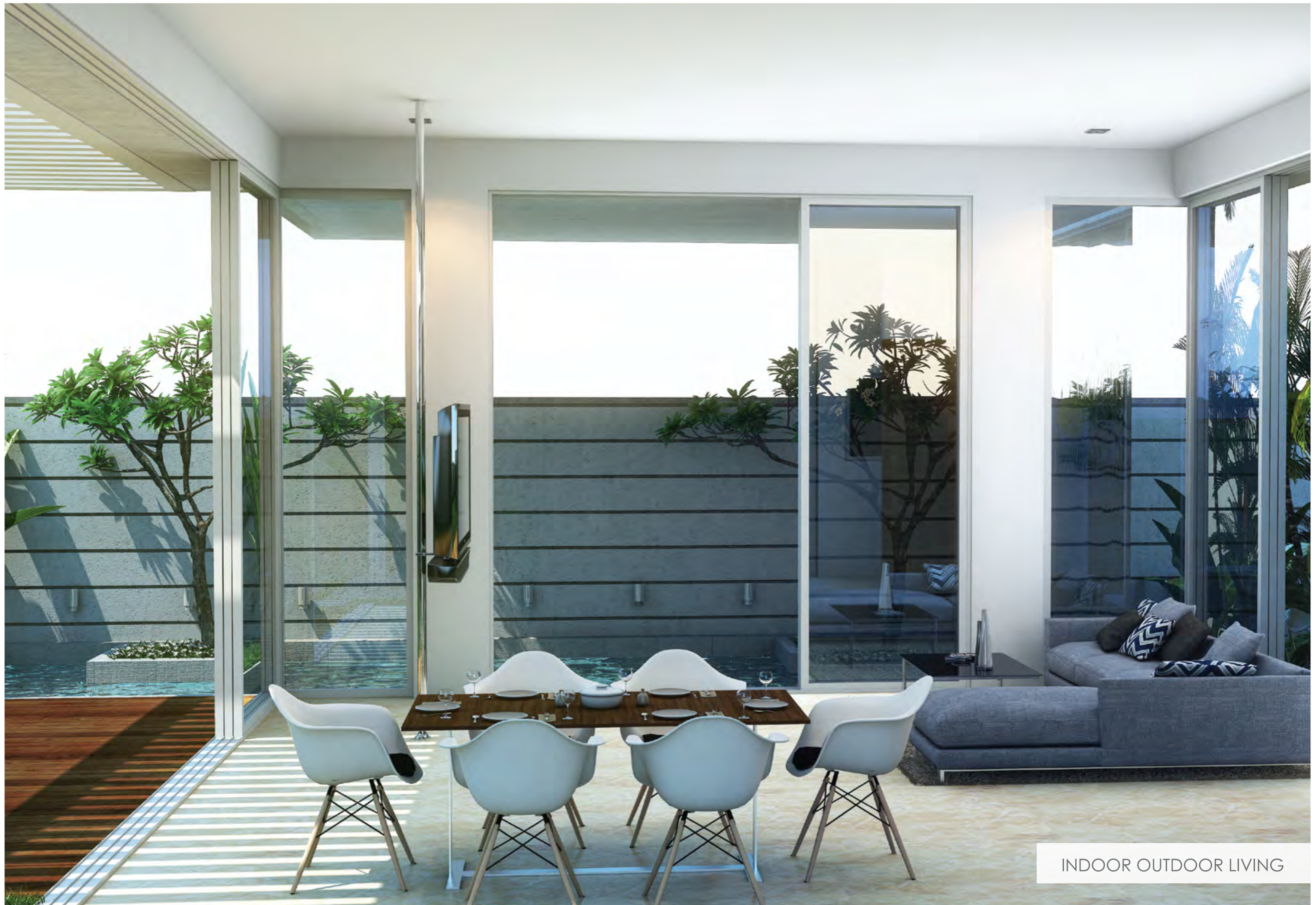
INDOOR OUTDOOR LIVING