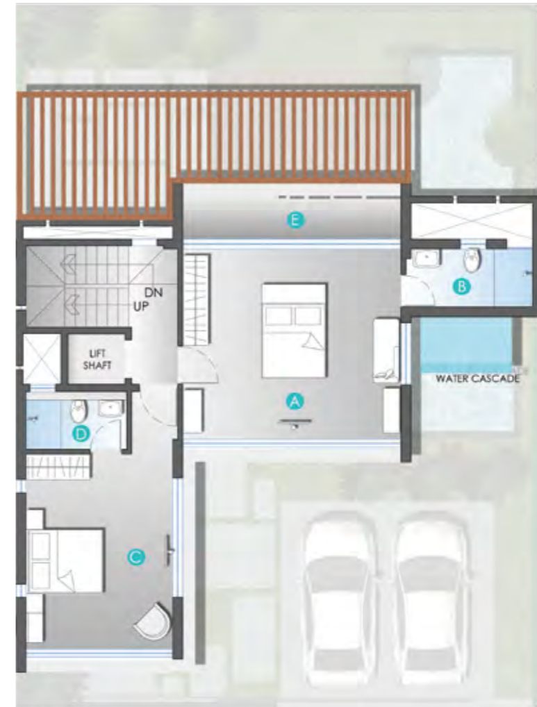
FIRST FLOOR PLAN - TYPE A