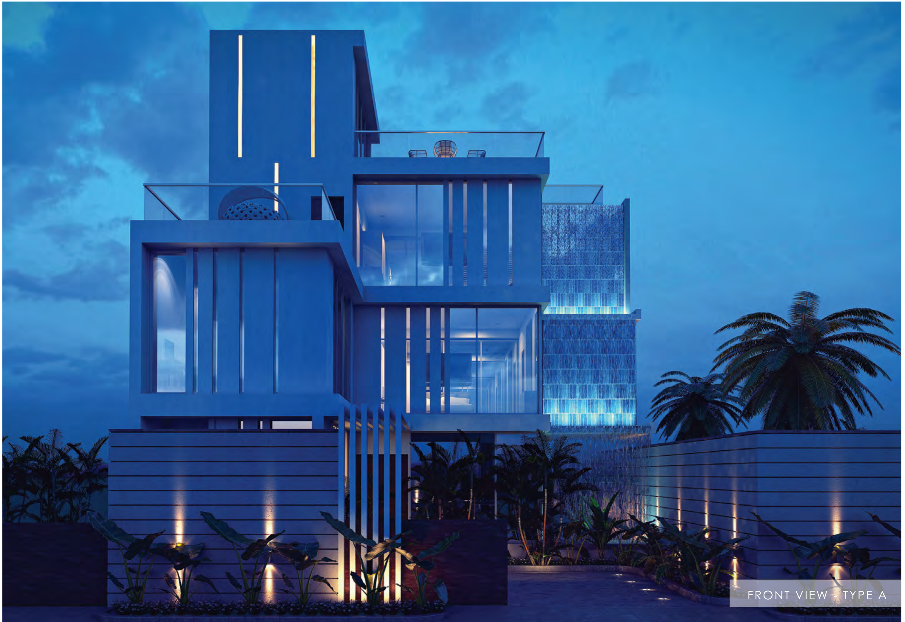
FRONT VIEW - TYPE A