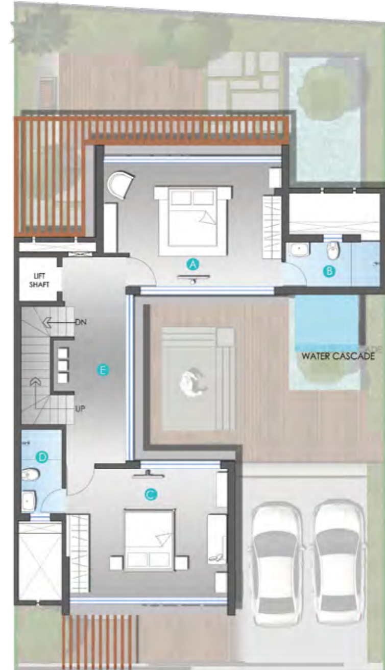
FIRST FLOOR PLAN - TYPE C