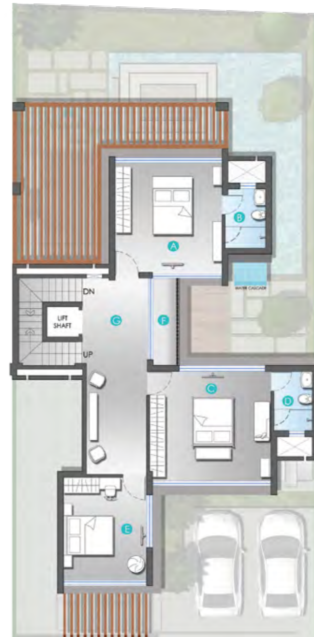
FIRST FLOOR PLAN - TYPE B