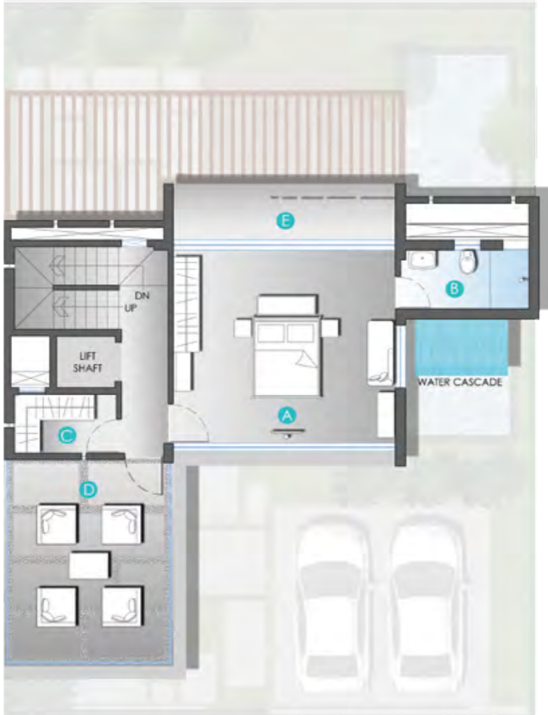
SECOND FLOOR PLAN - TYPE A