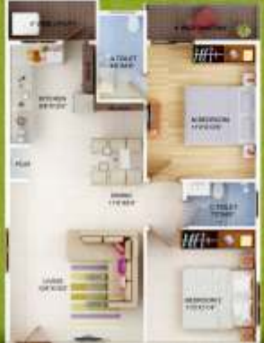
2 BHK NORTH (003) 1115 SQ FT