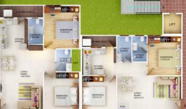
2 BHK EAST (019) 1068 SQ FT