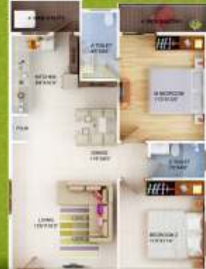
2 BHK NORTH (004) 1115 SQ FT