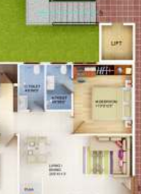
2 BHK WEST (020) 984.50 SQ FT