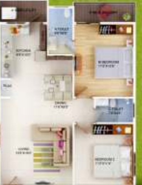
2 BHK NORTH (006) 1090 SQ FT