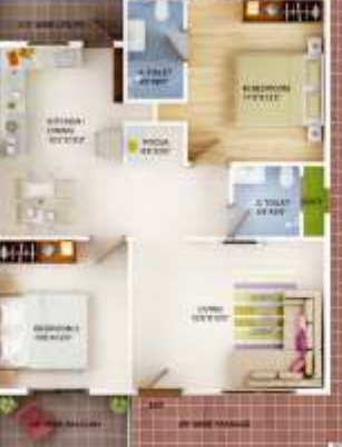
2 BHK NORTH (011) 1137.50 SQ FT