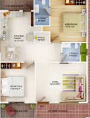
2 BHK NORTH (013) 1137.50 SQ FT