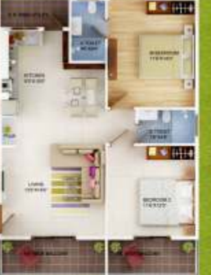
2 BHK EAST (012) 1211 SQ FT