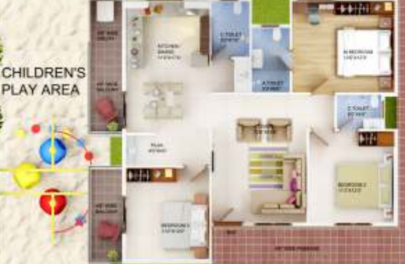
3 BHK NORTH (016) 1585 SQ FT