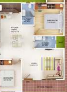
2 BHK NORTH (018) 1024.50 SQ FT