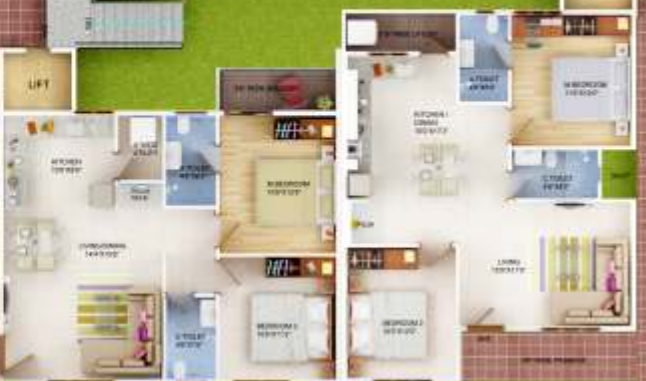
2 BHK EAST (017) 993.25 SQ FT