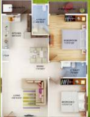
2 BHK NORTH (002) 1115 SQ FT