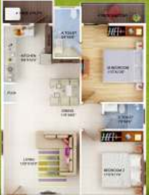
2 BHK NORTH (005) 1115 SQ FT