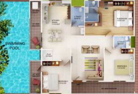
3 BHK NORTH (015) 1670 SQ FT