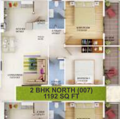
2 BHK NORTH (007) 1192 SQ FT