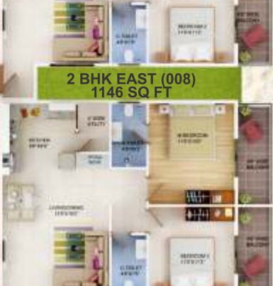
2 BHK EAST (008) 1146 SQ FT