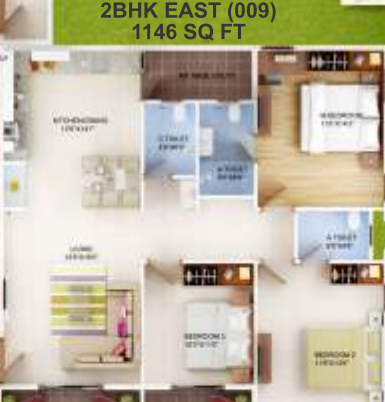
2BHK EAST (009) 1146 SQ FT