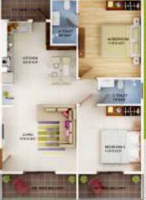
2 BHK EAST (014) 1211 SQ FT