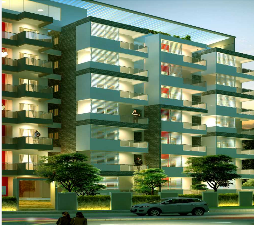
WESTLINE BONITA NH66 THOKKOTTU, MANGALORE