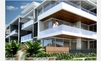
WESTLINE GREEN SQUARE BEJAI, MANGALORE