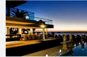
WESTLINE EL-RIO JEPPU, MANGALORE