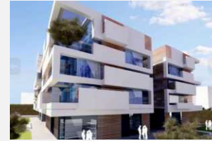
WESTLINE FAIRMONT NANTHOOR, MANGALORE