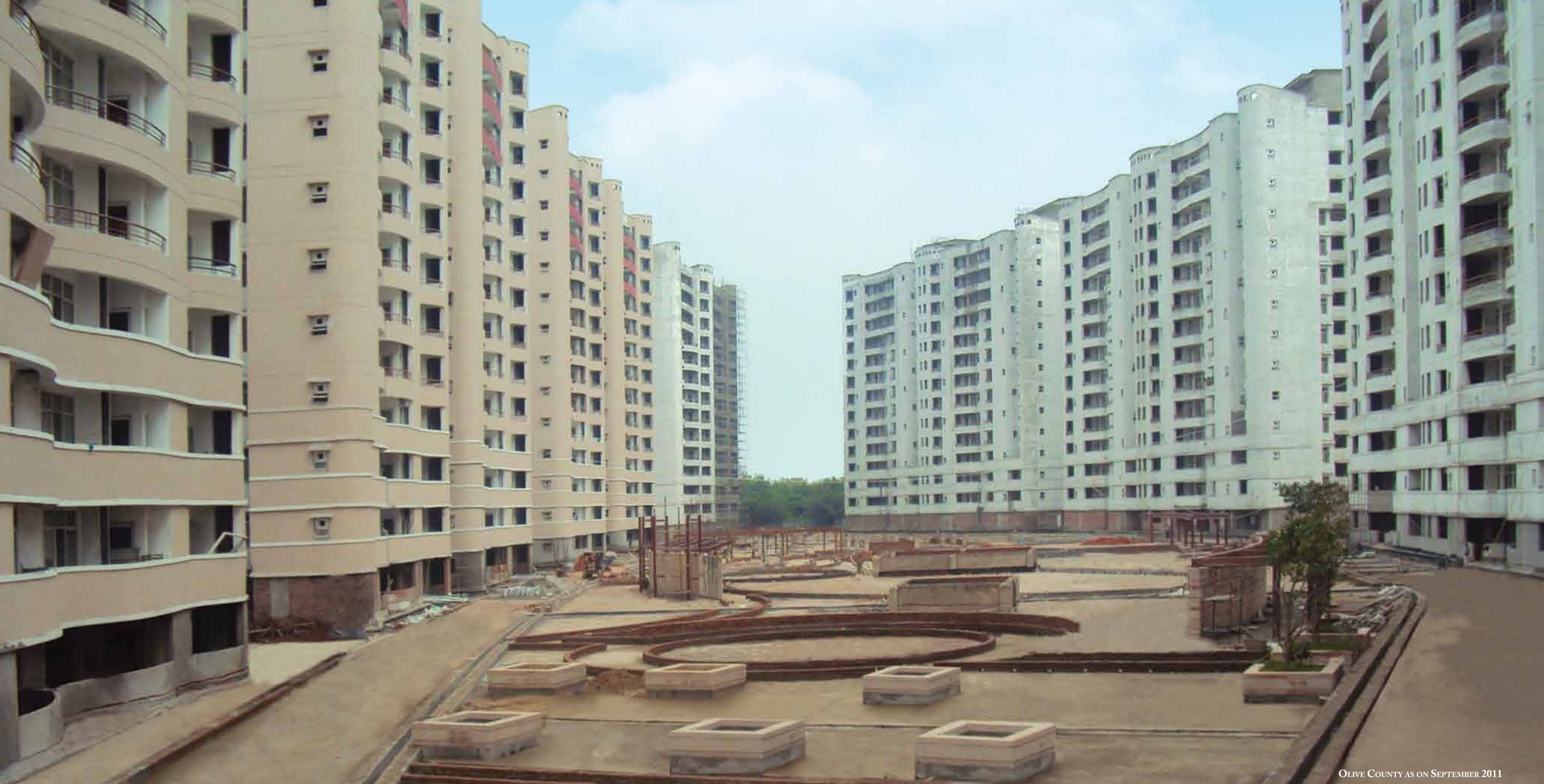
OLIVE COUNTY AS ON SEPTEMBER 2011