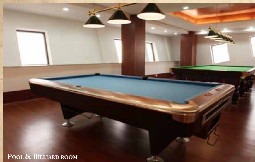
POOL & BILLIARD ROOM