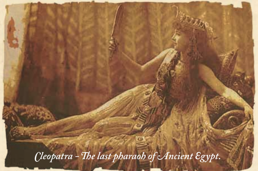
Cleopatra - The last pharaoh of Ancient Egypt.

NO CULTURE HAS LEFT ITS INFLUENCE ON THE WORLD MORE THAN THE EGYPTIAN CULTURE. ITS PAST CAN BE TRACED TO THE GREAT EGYPTIAN CIVILISATION. AS THE TIME PASSED IT GREW BOTH IN SIZE AND WEALTH UNDER THE STEWARDSHIP OF ITS AMBITIOUS PHARAOS. ONE OF THE AREAS THEY LEFT THEIR MARK WAS ARCHITECTURE.