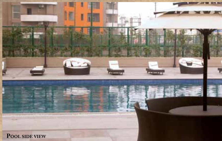
POOL SIDE VIEW