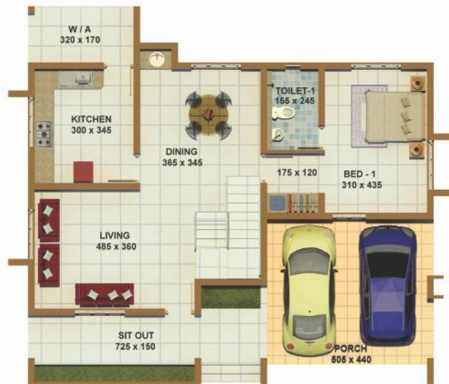
GROUND FLOOR PLAN PLINTH AREA - 1281 sq. ft.