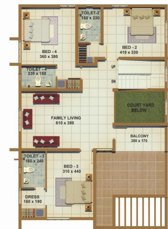
FIRST FLOOR PLAN PLINTH AREA - 1237 sq. ft. STAIR CABIN - 112 sq. ft.

* All dimensions are in centimetres * Dimensions and details are subject to alteration without notice * Furniture layout is only indicative