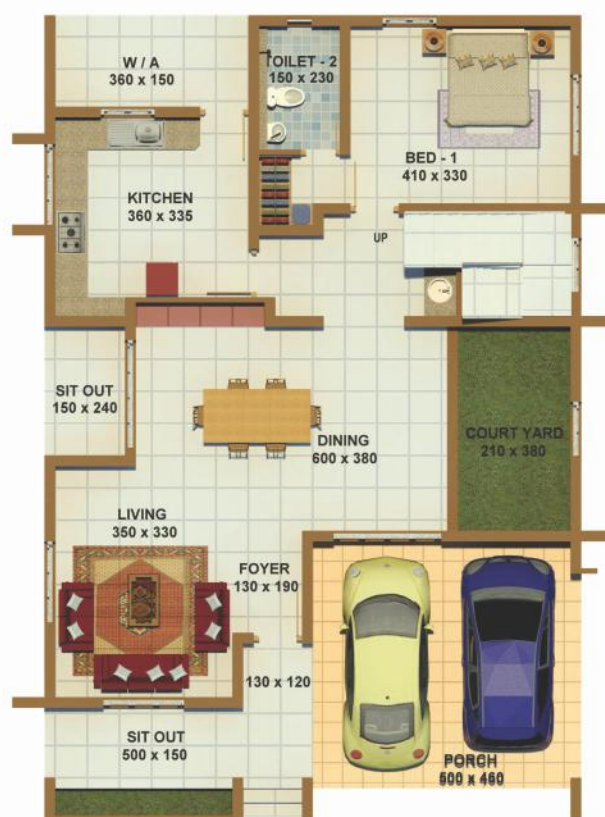
GROUND FLOOR PLAN PLINTH AREA - 1549 sq. ft.