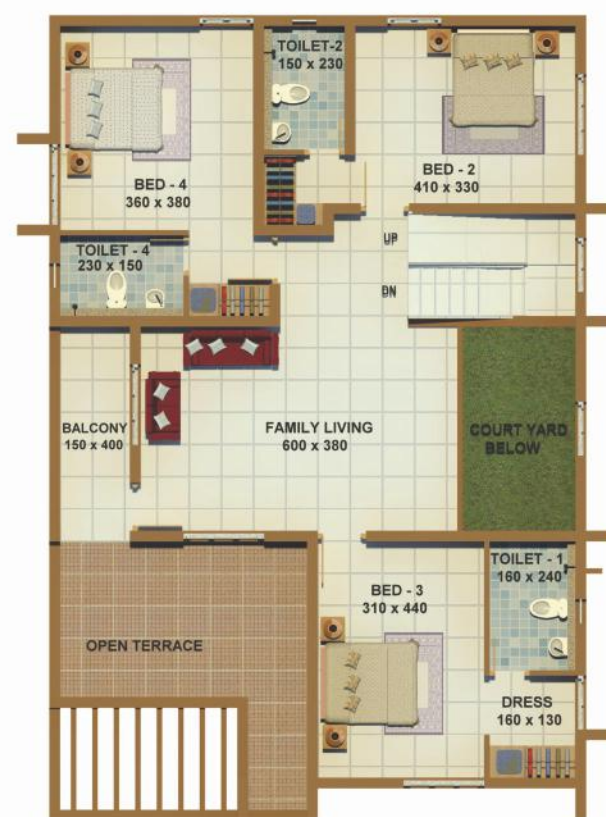
FIRST FLOOR PLAN PLINTH AREA - 1226 sq. ft. STAIR CABIN - 122 sq. ft.

* All dimensions are in centimetres * Dimensions and details are subject to alteration without notice * Furniture layout is only indicative