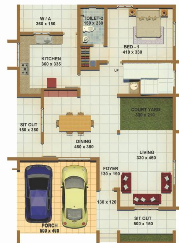
GROUND FLOOR PLAN PLINTH AREA - 1549 sq. ft.