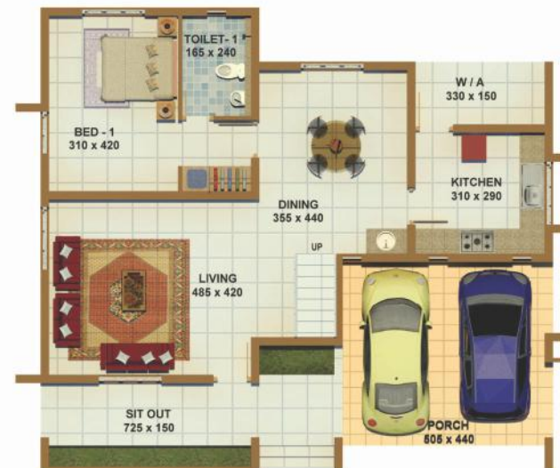
GROUND FLOOR PLAN PLINTH AREA - 1291 sq. ft.