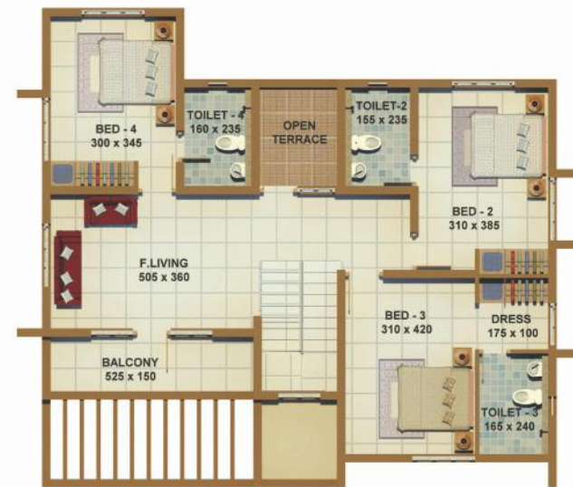
FIRST FLOOR PLAN PLINTH AREA - 1109 sq. ft. STAIR CABIN - 121 sq. ft.