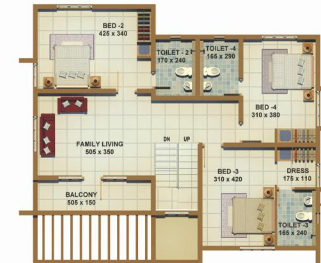
FIRST FLOOR PLAN PLINTH AREA - 1177 sq. ft. STAIR CABIN - 121 sq. ft.

* All dimensions are in centimetres * Dimensions and details are subject to alteration without notice * Furniture layout is only indicative