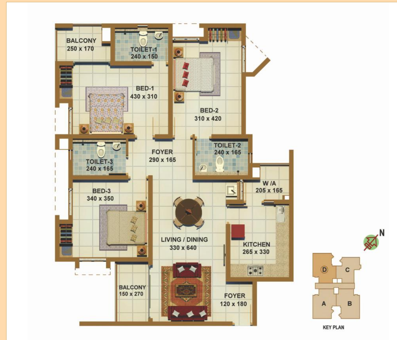
3 BED UNIT - D 1508 sq.ft

* ALL DIMENSIONS ARE IN CENTIMETRES * DIMENSIONS ARE SUBJECT TO ALTERATION WITHOUT NOTICE * FURNITURE LAYOUT IS ONLY INDICATIVE