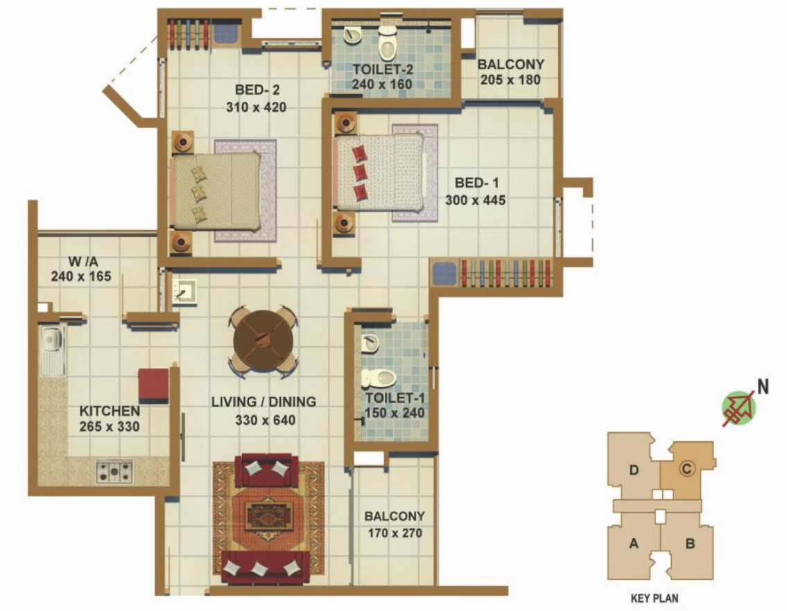
2 BED UNIT - C 1199 sq.ft

* ALL DIMENSIONS ARE IN CENTIMETRES * DIMENSIONS ARE SUBJECT TO ALTERATION WITHOUT NOTICE * FURNITURE LAYOUT IS ONLY INDICATIVE