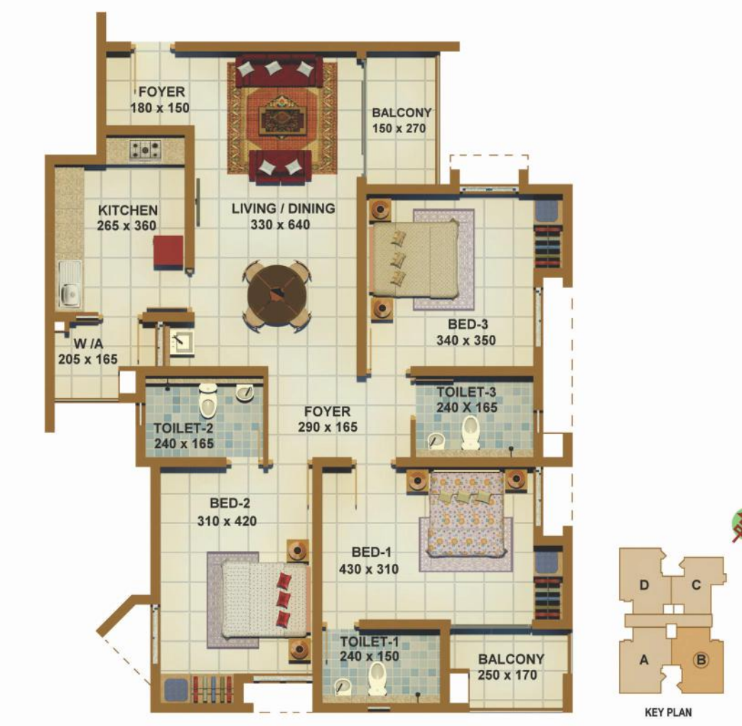
3 BED UNIT - B 1520 sq.ft