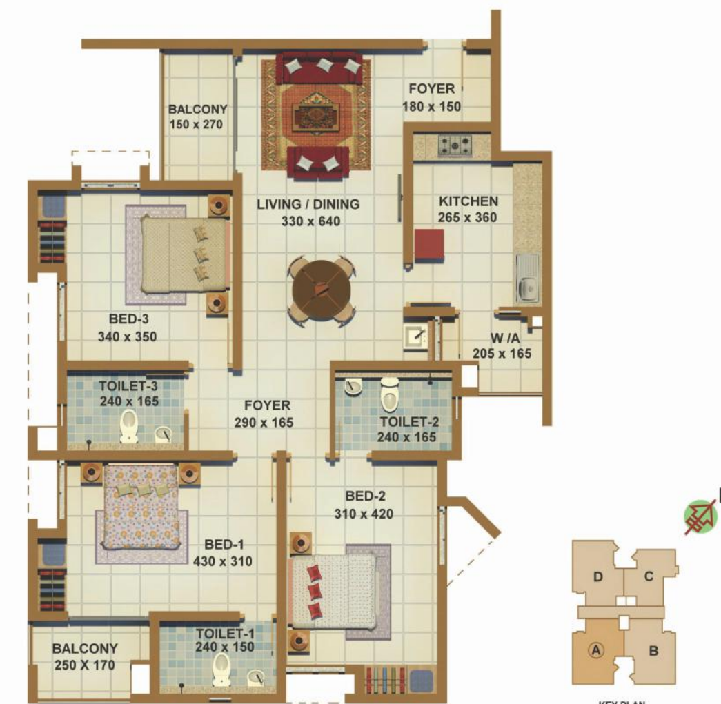
3 BED UNIT - A 1520 sq.ft