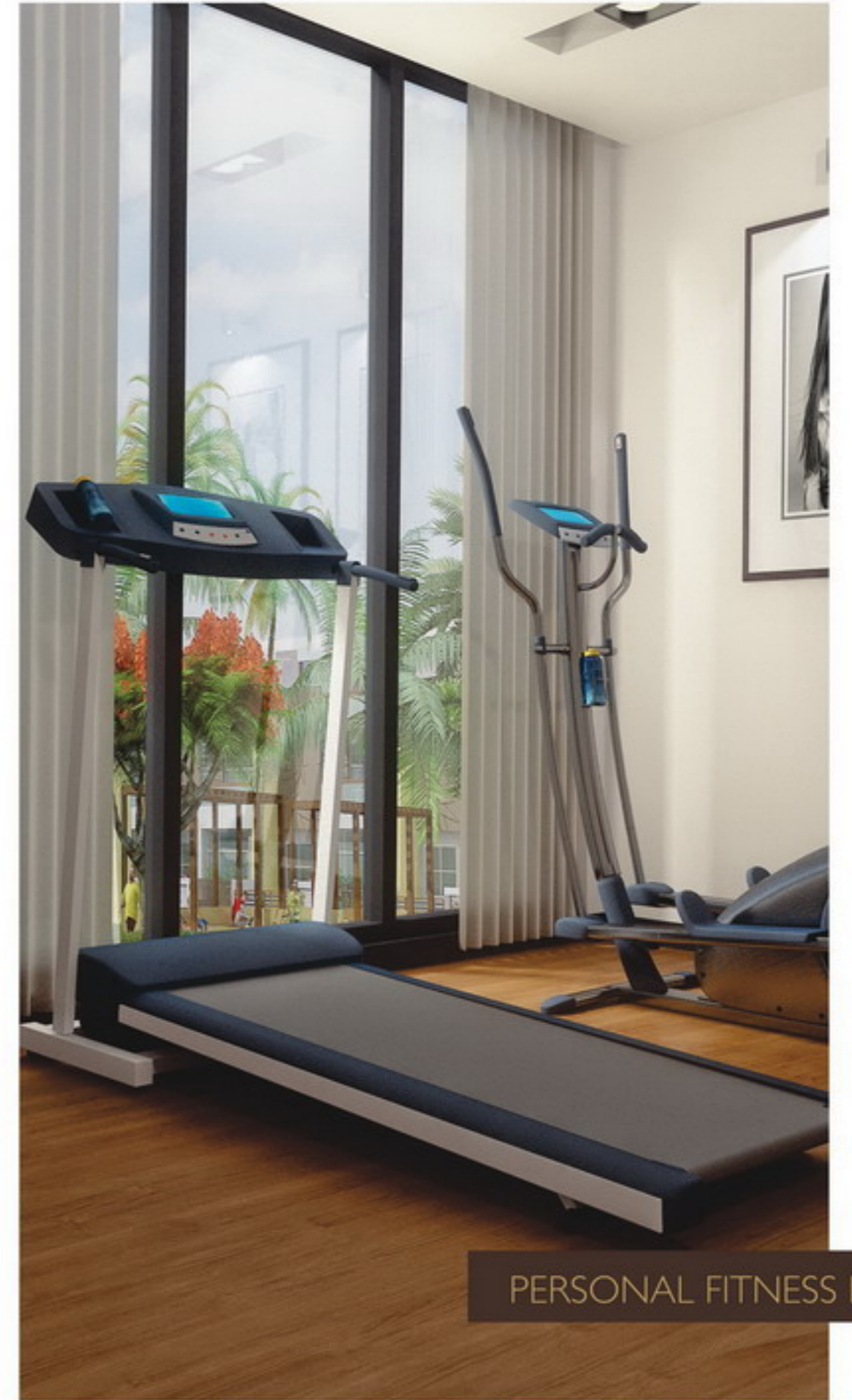
PERSONAL FITNESS ROOM