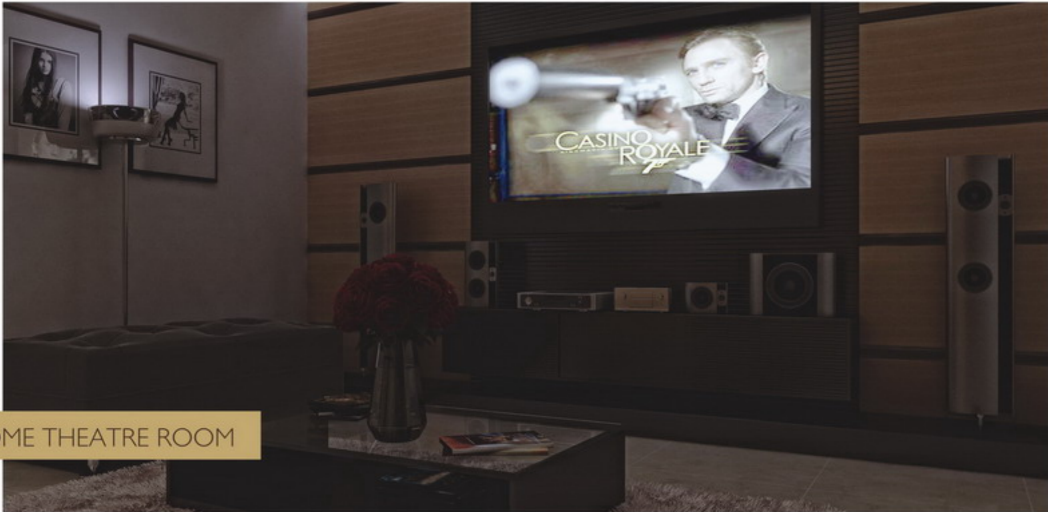
HOME THEATRE ROOM