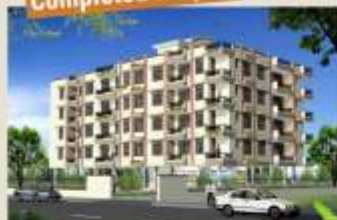
Vardhman Apartments, Banipark