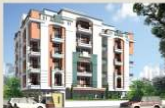
Arihant Enclave, Ajmer Road