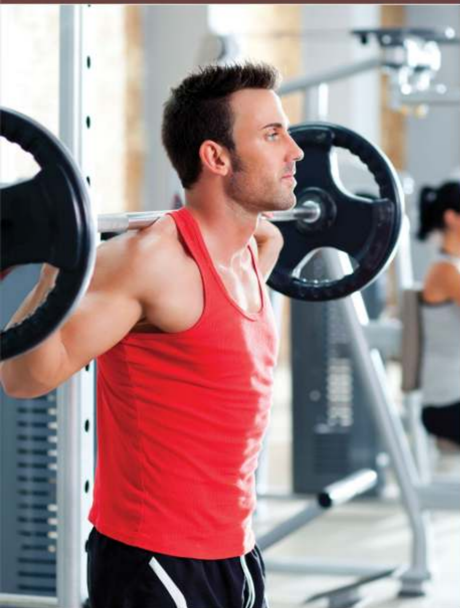
Well equipped gym