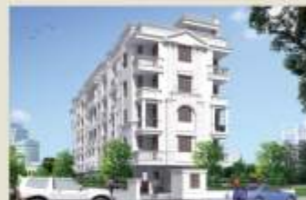
Arihant Residency, Ajmer Road