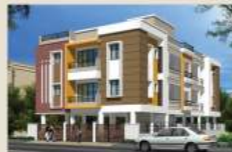
Siddarth Nagar, Malviya Nagar