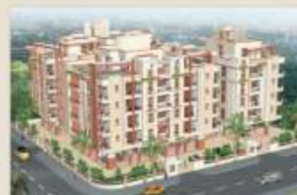
Vardhman Residency, Ajmer Road