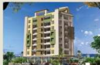
Western Heights, Shyam Nagar