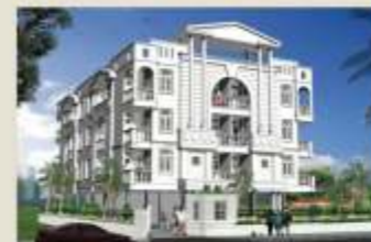
Vardhman Majesty, Shyam Nagar