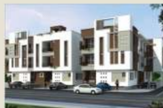
Classic Residency, Vaishali Nagar