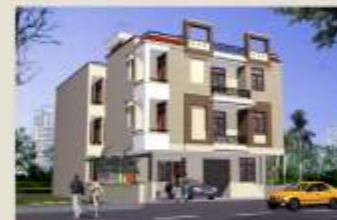
Aastha Apartments, Nirman Nagar