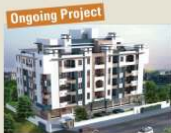
Arihant Palm, Ajmer Road