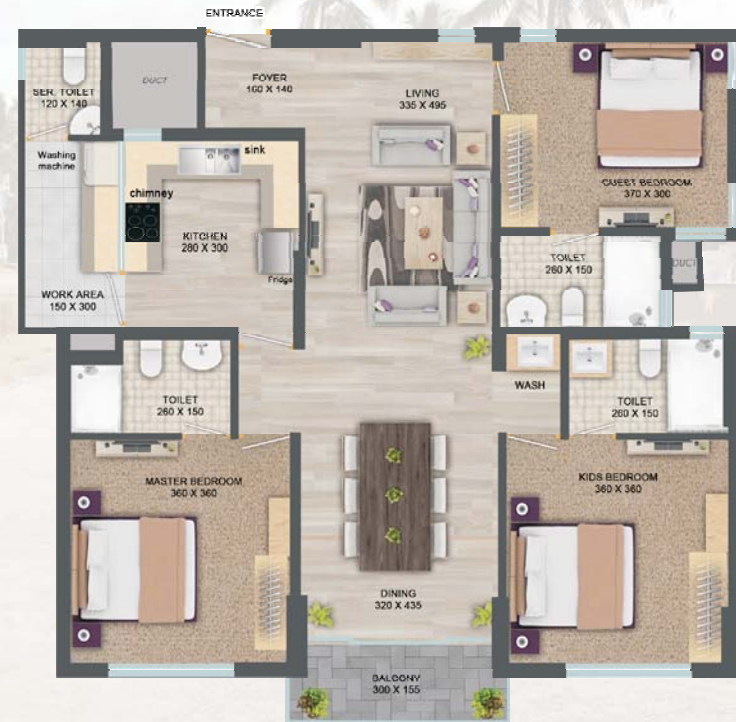
Type - F 3BHK, SBA : 1507sqft