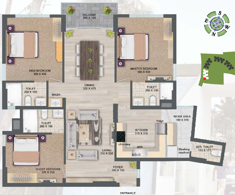
Type - A 3BHK, SBA : 1597sqft