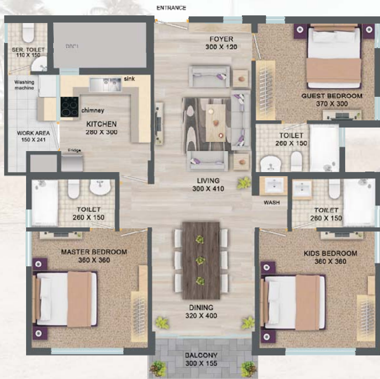
Type - E 3BHK, SBA : 1466sqft