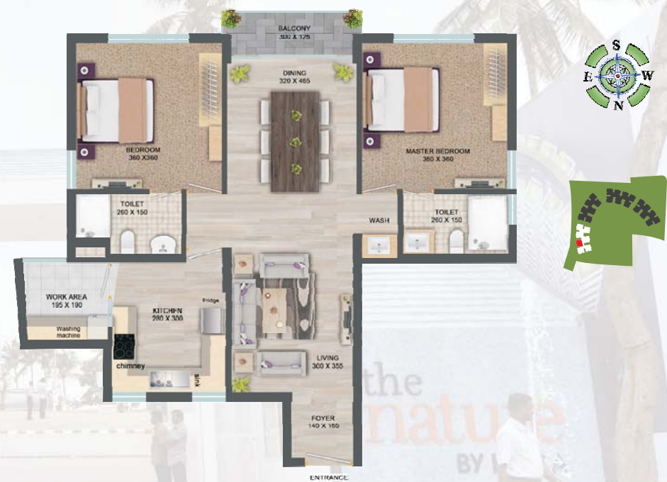
Type - B 2BHK, SBA : 1168sqft