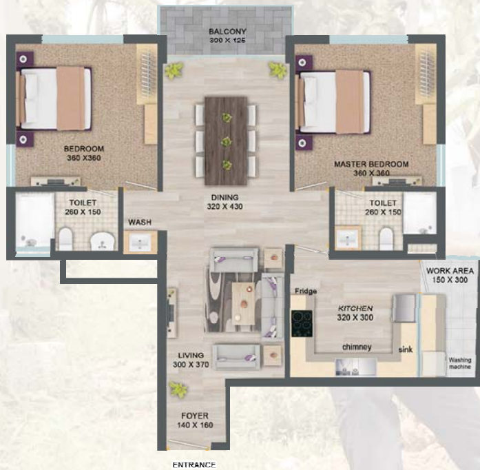
Type - C 2BHK, SBA : 1198sqft