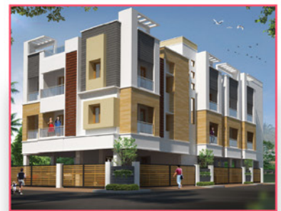
ASN DWARAKA Rajakilpakkam