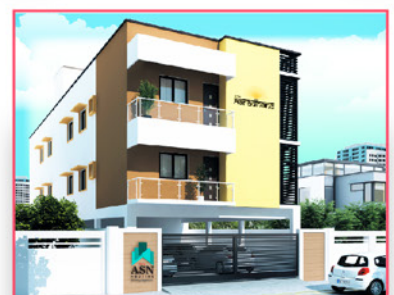
ASN AARADHANA Chrompet