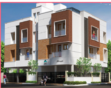
ASN SHREYAS Pallavaram