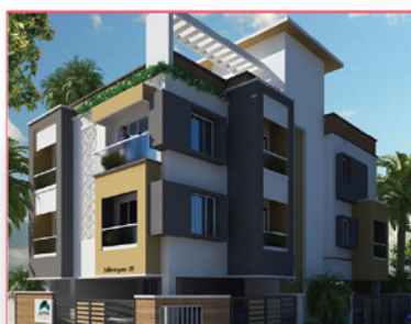
ASN SHREYAS - II Pallavaram