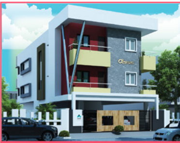
ASN OASIS Pallikaranai