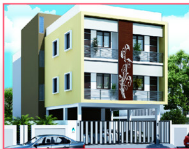
ASN PARADISE Pammal