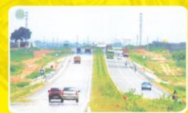
Banglore Express Highway

Registered & Corporate Office : SuvarnaAvani Estates (India) Pvt. Ltd. 1st Floor, Plot # 22, Phase - I, Kamalapuri Colony, Near Satya Sai Nigamagamam, Hyderabad - 500 073 Ph: 040-2373 5601 Fax : 040-2373 5602 www.suvarnaavani.com | Email: info@suvarnaavani.com