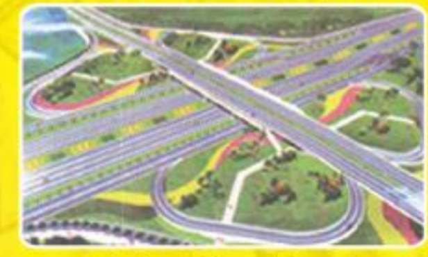
Outer Ring Road